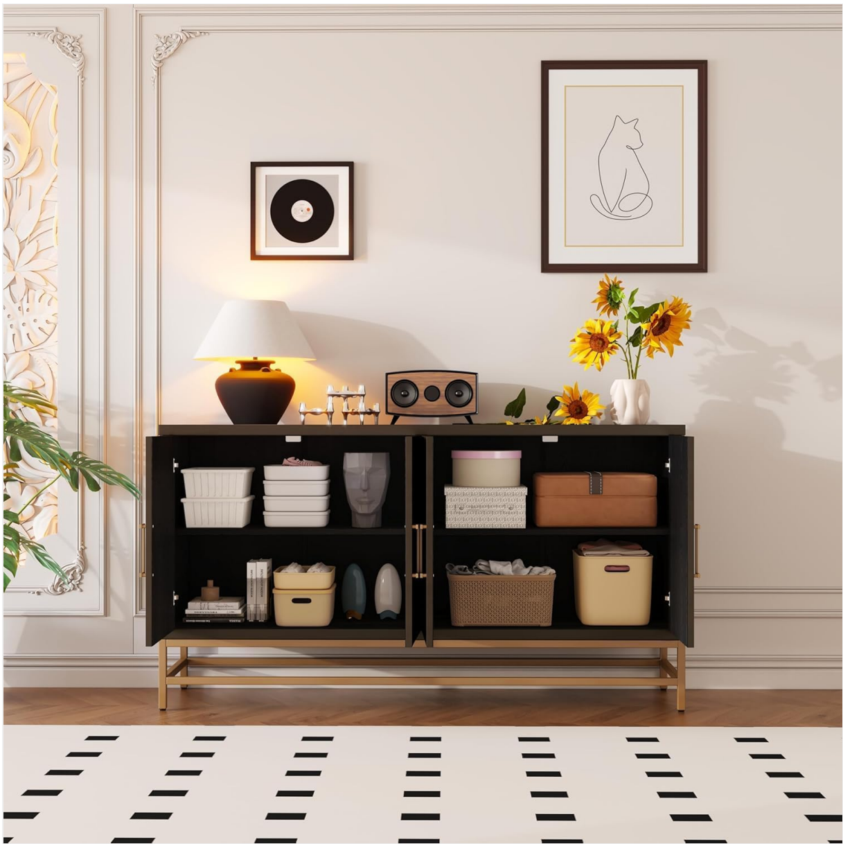
The assembled Virubi Sideboard Buffet Cabinet in a home environment.