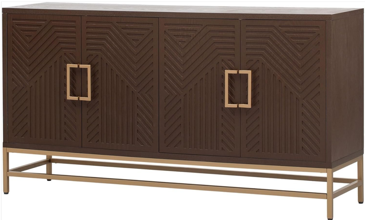
Front view of the Virubi 60 inch Espresso Sideboard Buffet Cabinet.

Thank you for choosing the Virubi 60 inch Sideboard Buffet Cabinet. This manual provides essential information for the safe assembly, operation, and maintenance of your new furniture. Please read it thoroughly before beginning assembly and retain it for future reference.