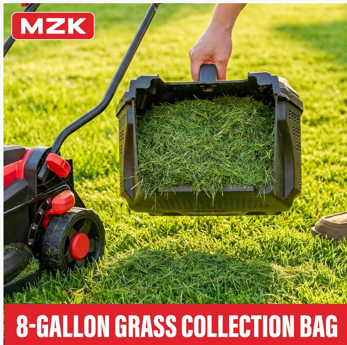
Image: The MZK 20V 13-inch Cordless Electric Lawn Mower, showcasing its compact design and red and black color

The MZK 20V 13-inch Cordless Electric Lawn Mower is designed for efficient grass cutting in yards, gardens, and farms. It features a brushless motor, dual-battery system, and adjustable cutting height for versatile use.