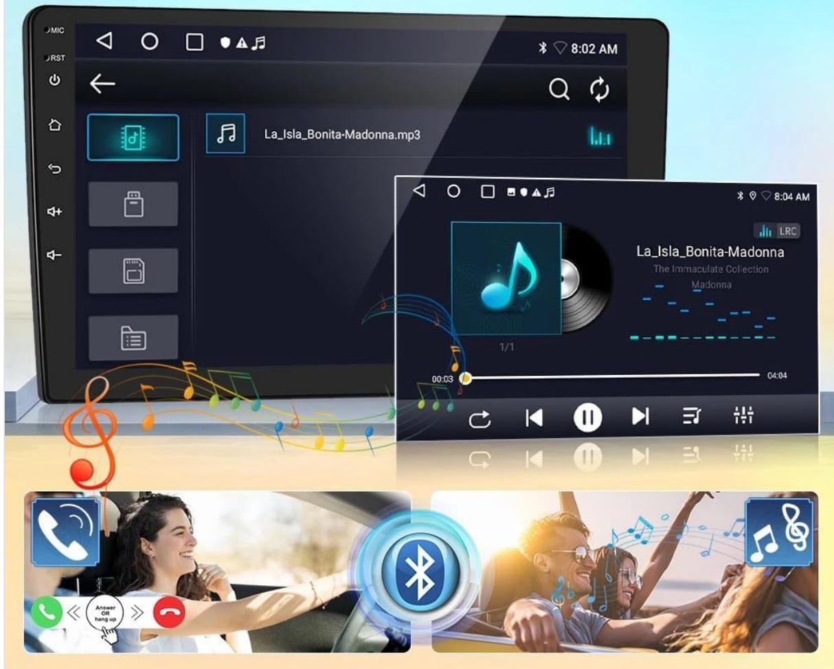
Image: Bluetooth interface showing music playback and call management.

Through BT, we can listen to music or answer hands-free calls while navigating, which greatly reduces driving risks