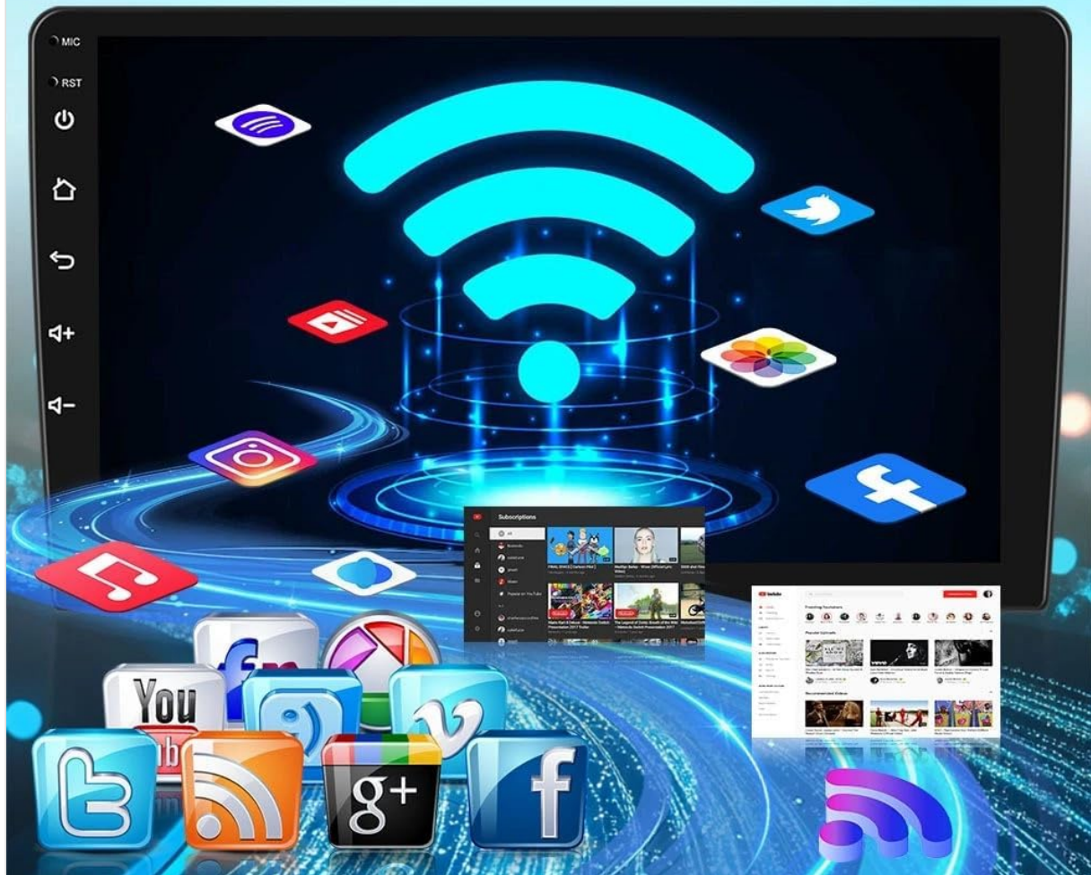
Image: Screen displaying WiFi connection status and available online applications.

High-speed internet access, application download, online video watching, music playing... Rich entertainment gets you out of a tiring drive