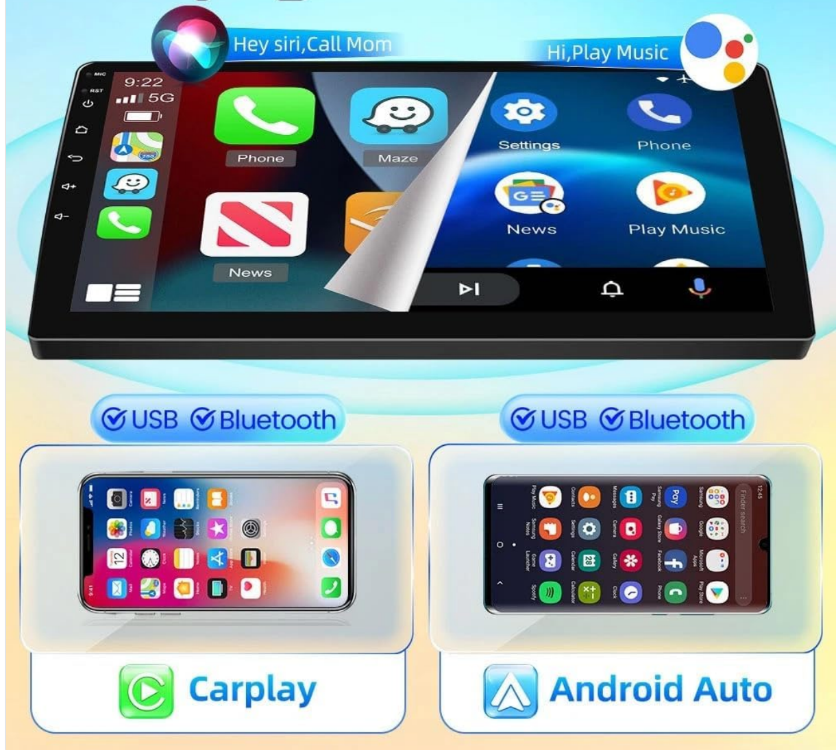
Image: Display showing Apple CarPlay and Android Auto interfaces.