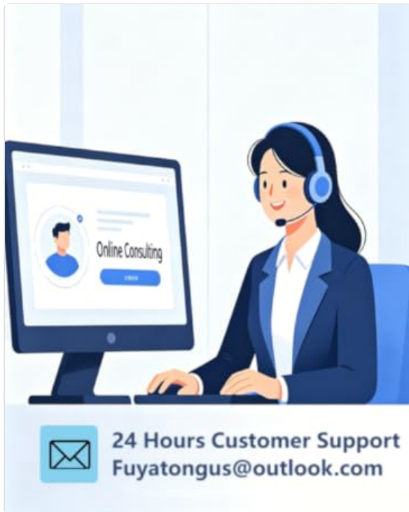
Image: Illustration of customer support representative with contact email.