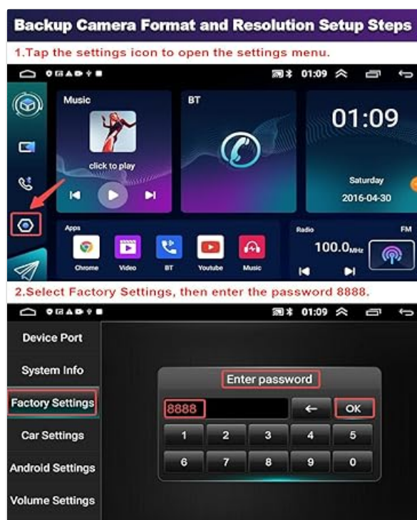
Image: Steps for configuring backup camera resolution settings.