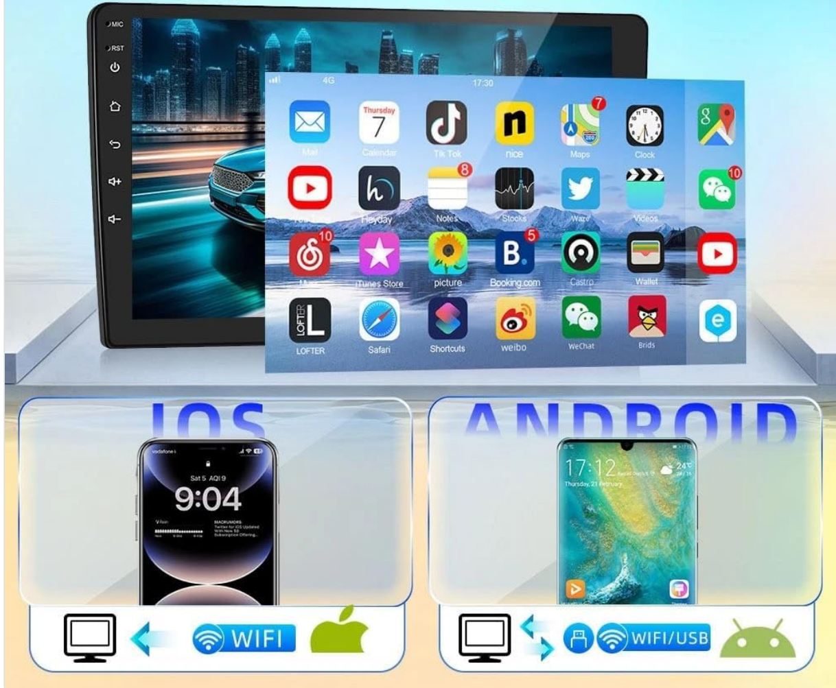
Image: Illustration of Mirror Link connecting a smartphone screen to the car stereo.

Through the USB data cable/WIFI connection, you can achieve mirroring the mobile phone screen to the car player