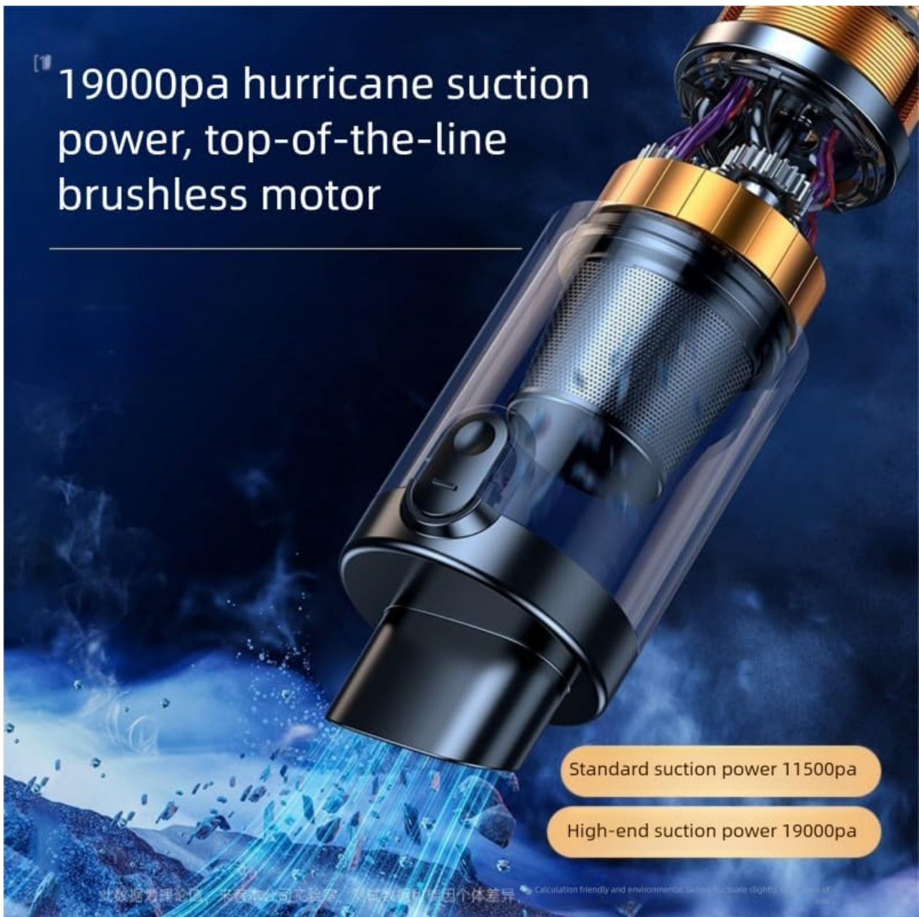
Image: The V-15Pro Car Vacuum disassembled, showing the dust cup and filter components for easy cleaning.