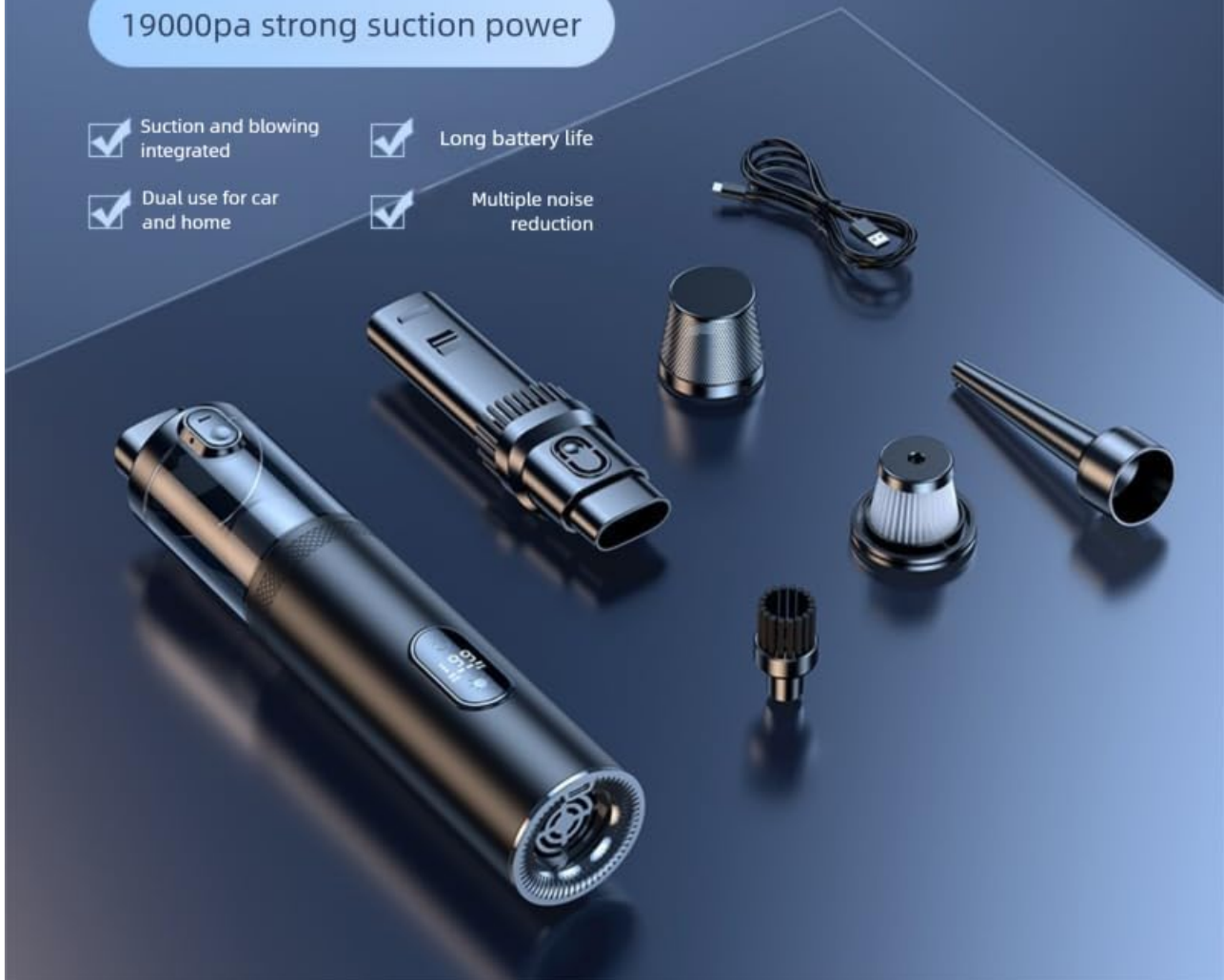
Image: All components included in the V-15Pro Car Vacuum package, including the main unit, charging cable, and various attachments.