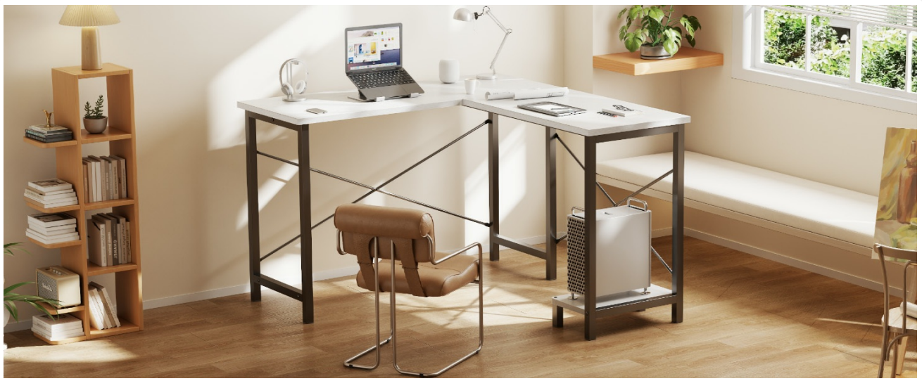
Image: Desk surface demonstrating waterproof and easy-to-clean features.