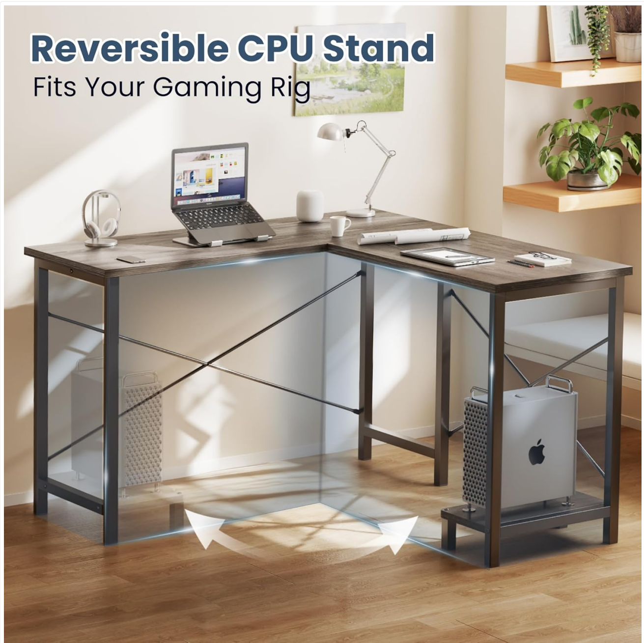
Image: Reversible CPU stand for flexible setup.

Video: Detailed assembly guide for the DUMOS L-Shaped Desk. This video demonstrates step-by-step instructions for putting together the desk components, including frame assembly, tabletop attachment, and CPU stand installation.