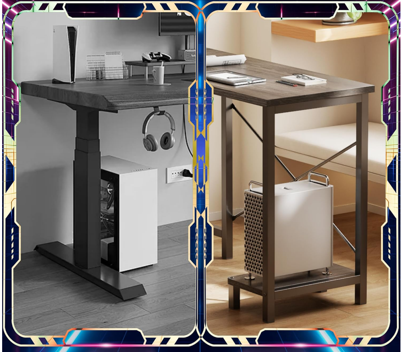
Image: Effective cable management for a clean workspace.