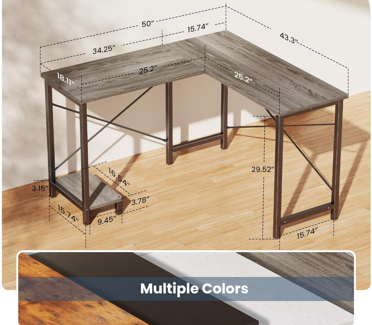
Image: Product dimensions and components overview.