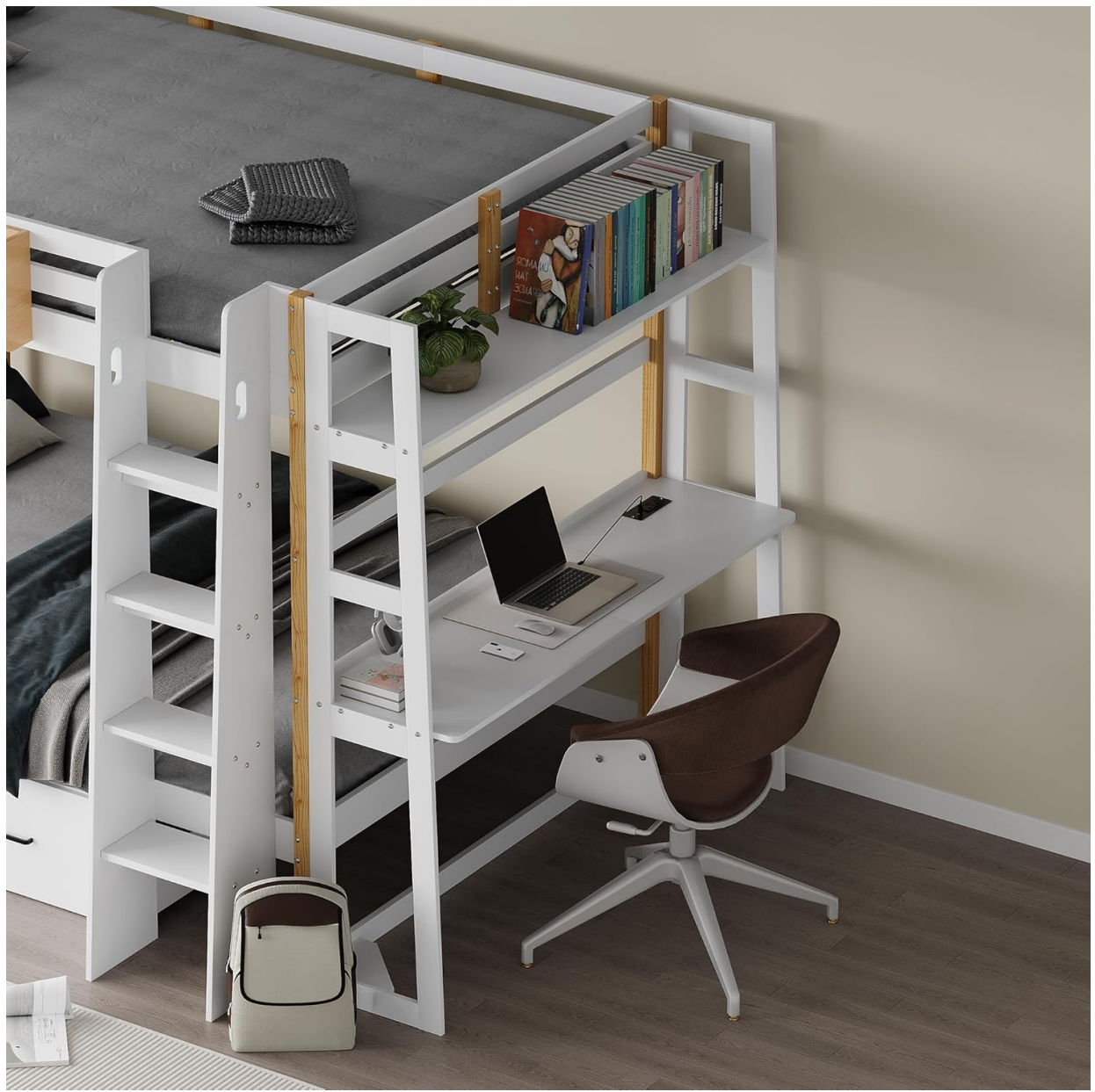
Figure 3.2: Versatile Side Desk. This image demonstrates the flexibility of the side desk, which can be positioned on either side of the bunk bed to adapt to various room configurations.