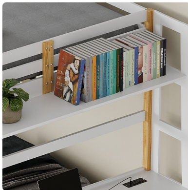
Top shelf provides space to display photos, décor or small essentials