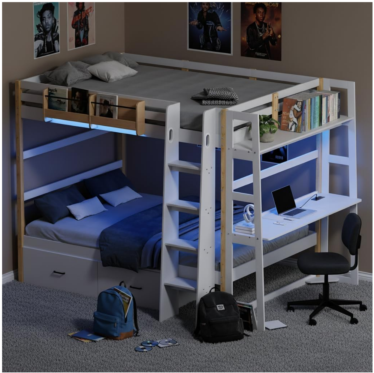
Figure 2.1: Overall view of the adwin Full Over Full Bunk Bed. This image displays the complete bunk bed unit, highlighting the upper and lower sleeping areas, the integrated desk, ladder, and storage drawers.