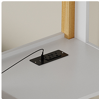
Built-in power outlet with 2 standard sockets, 1 USB, 1 Type-C port