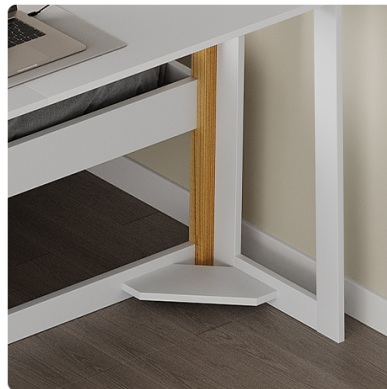
Reinforced bottom corners ensure durability and stability