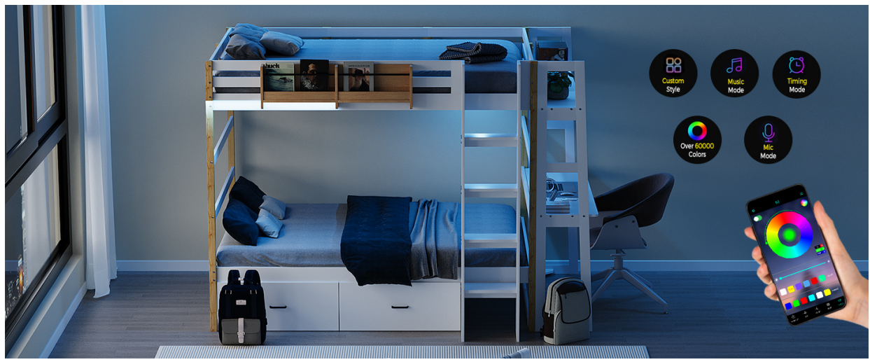
Figure 4.4: Angled Ladder Design. This image highlights the ergonomic angled design of the ladder, which facilitates easier and safer climbing to the upper bunk, and includes a built-in handle.