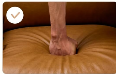
High Resilient Sponge