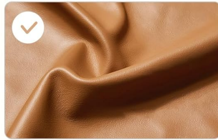
Premium PU Leather