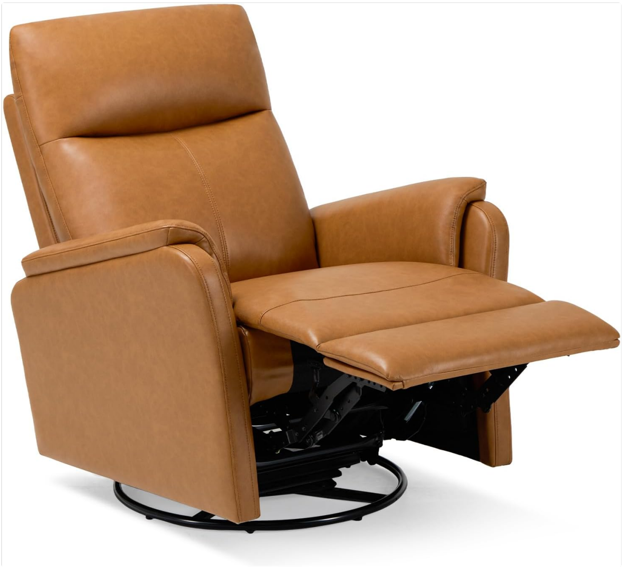
Image 2.1: The MALOL Swivel Rocking Recliner Glider Chair, showcasing its camel PU leather upholstery and partially extended footrest.