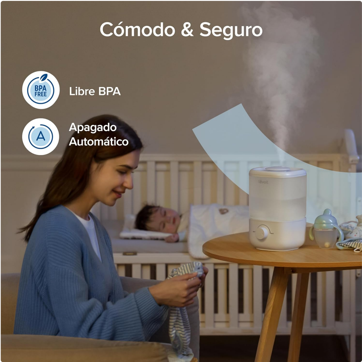
Image: A woman with a baby near the humidifier, highlighting its BPA-free material and automatic shut-off safety features.