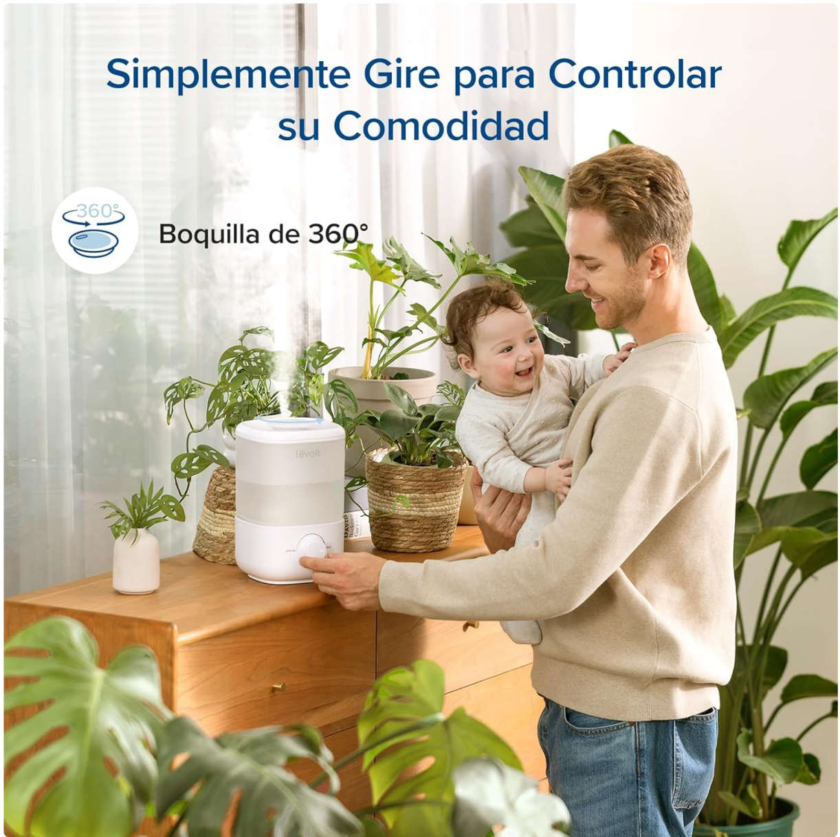
Image: A man holding a baby while adjusting the humidifier's control dial, illustrating ease of use and the 360-degree nozzle.