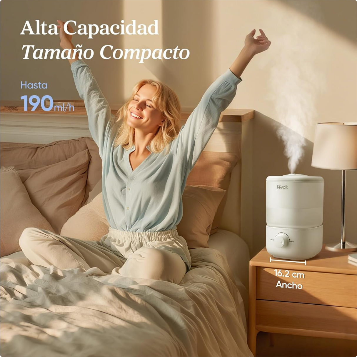
Image: A woman stretching in a bedroom, showcasing the humidifier's compact size and mist output.