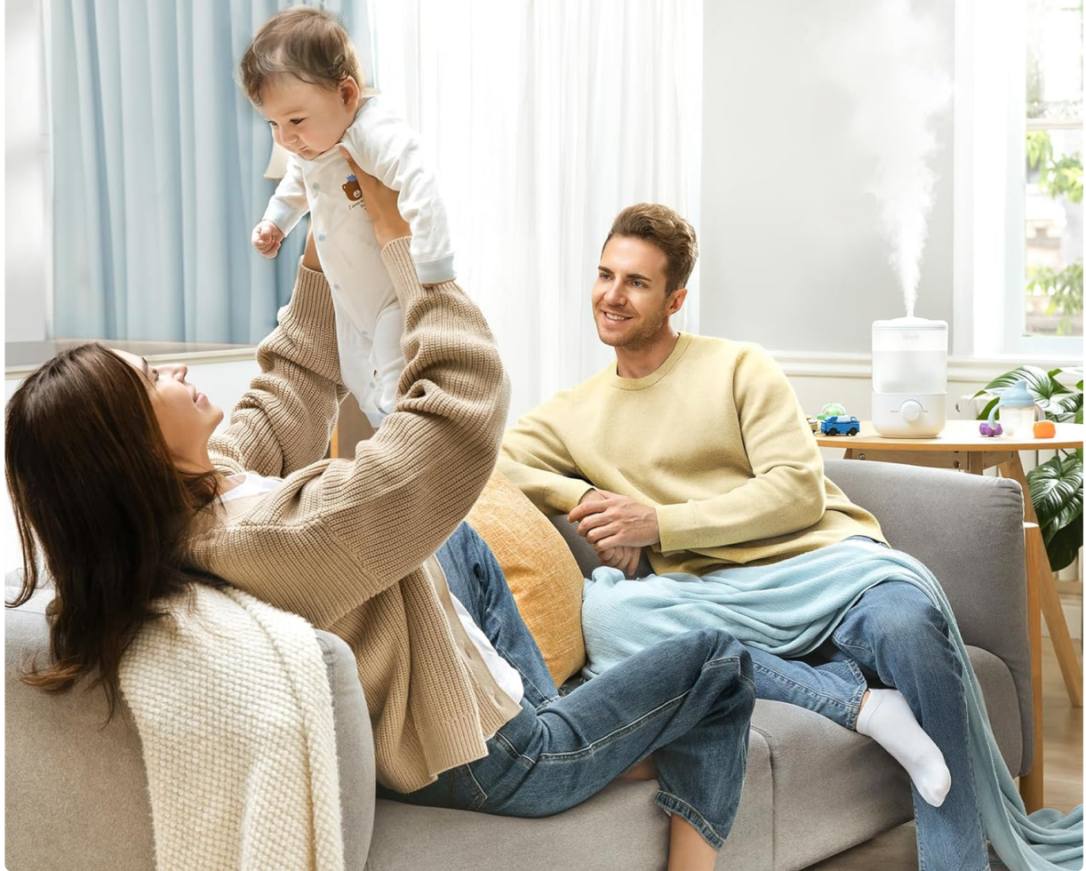
Image: A couple holding a baby, with a humidifier in the background, illustrating the product's benefit in alleviating dry air problems.

Acabe con el dolor de garganta, la sinusitis, la congestión nasal, la piel seca, los ronquidos y otros síntomas del aire seco.