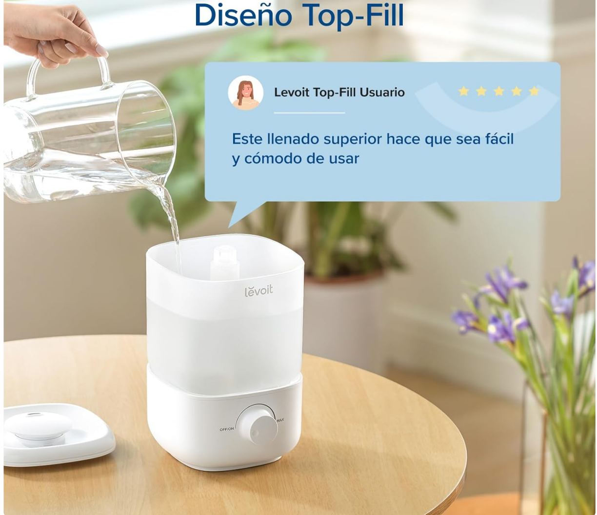
Image: A hand pouring water into the humidifier's top opening, demonstrating the easy top-fill design.