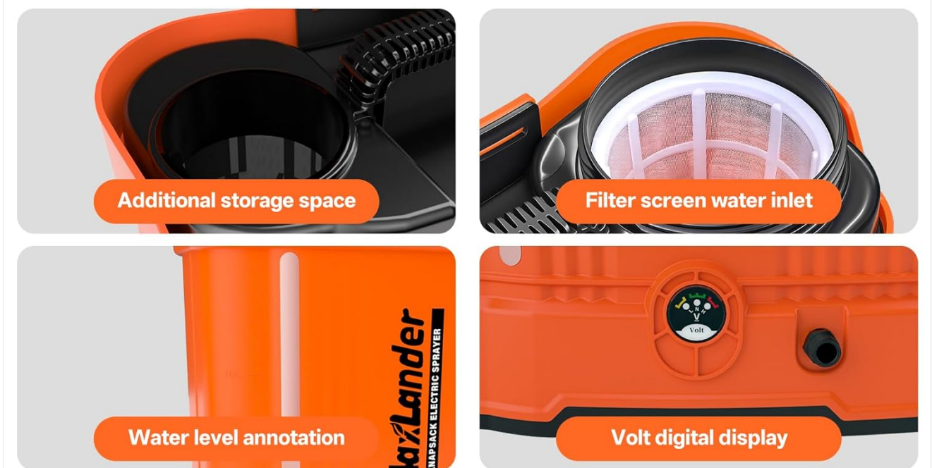
Figure 4.3: Close-up views of the sprayer's design, including the wide fill opening with filter, clear tank with water level markings, and the digital voltage display.