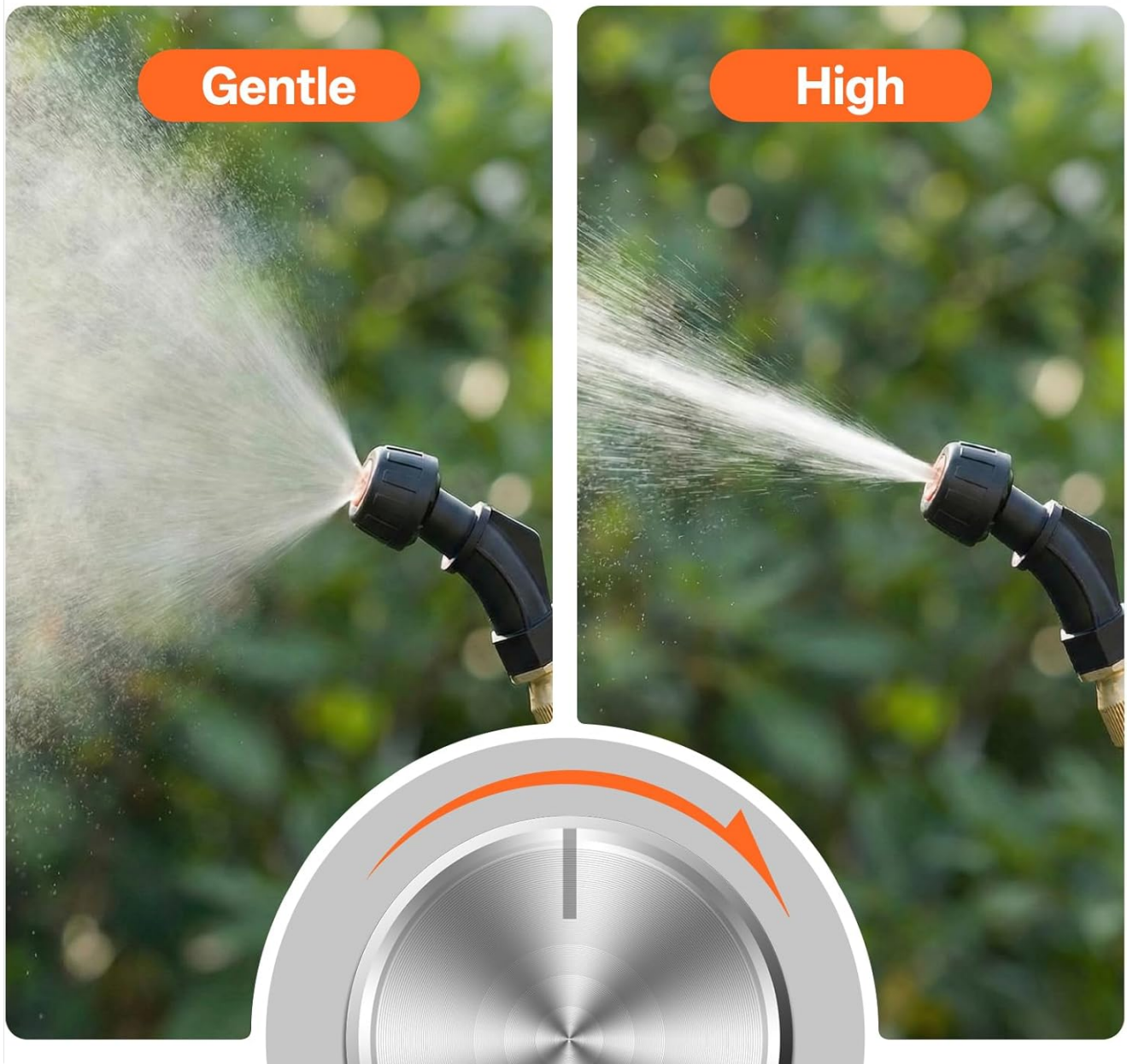
Figure 5.2: Illustrates the sprayer's ability to adjust spray intensity from a gentle mist for delicate plants to a powerful stream for broader coverage.