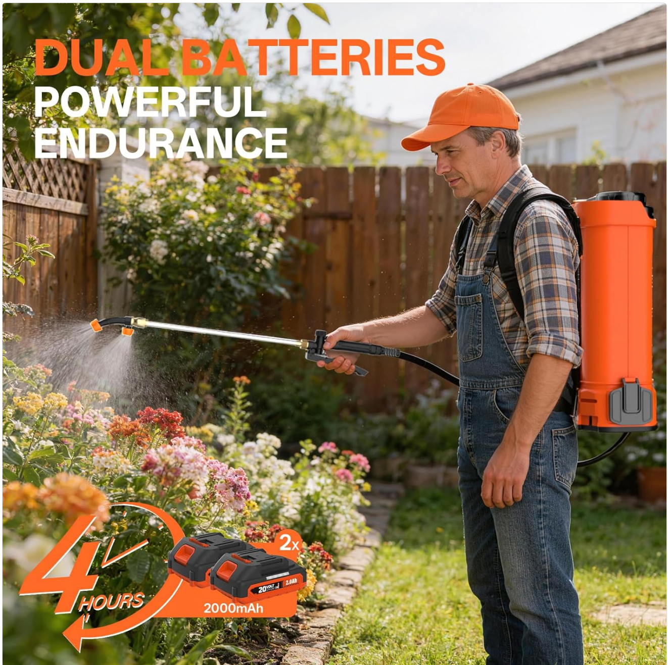
Figure 5.1: A user demonstrates the Maxlander backpack sprayer, applying liquid to garden plants. The sprayer is worn comfortably on the back.