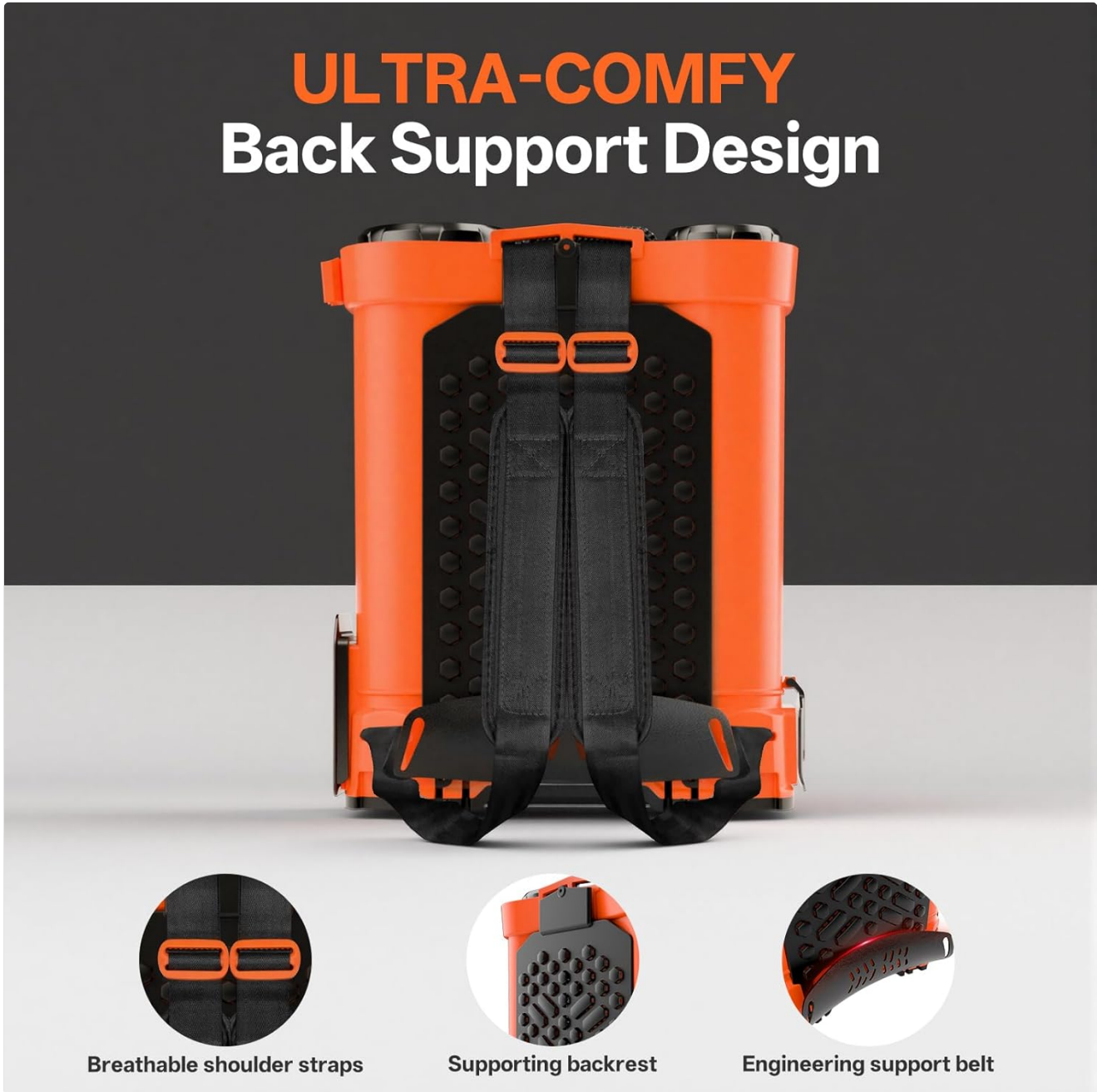
Figure 4.1: A view of the sprayer's back panel, showcasing the breathable shoulder straps, supporting backrest, and engineering support belt designed for user comfort.