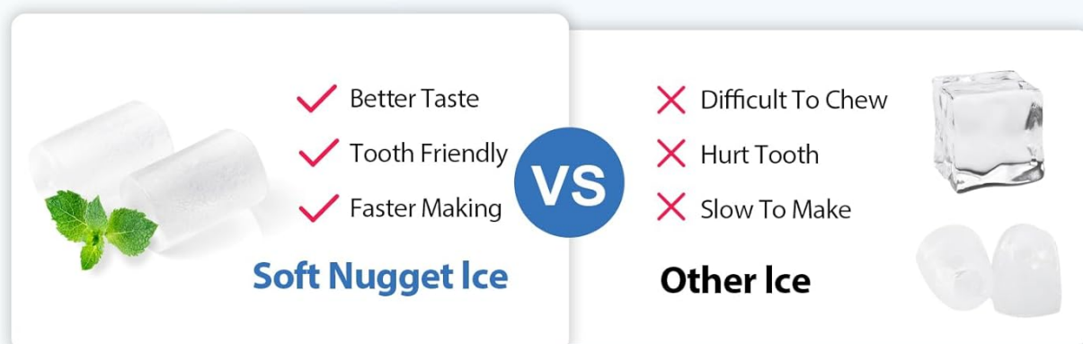
Figure 5.4: An image showcasing the chewable, soft nugget ice produced by the machine, comparing it to other ice types.