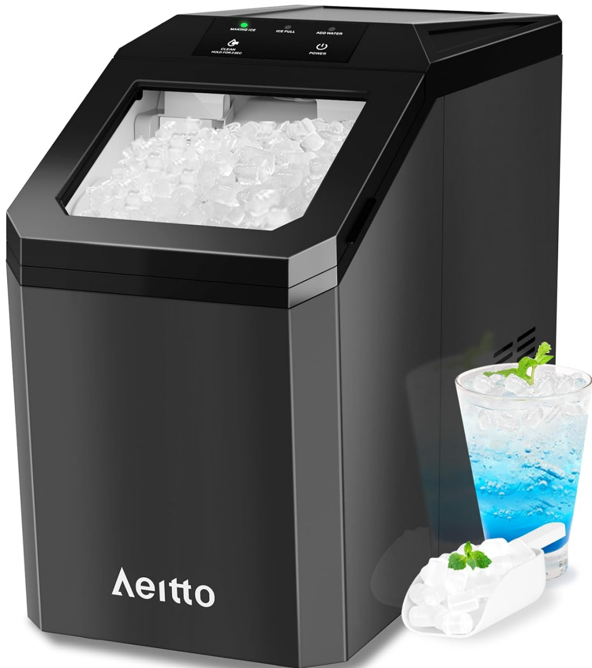
Figure 3.1: Front view of the Aeitto Nugget Ice Maker. The image shows the black ice maker with a clear lid, filled with nugget ice, alongside a glass of blue beverage and an ice scoop.