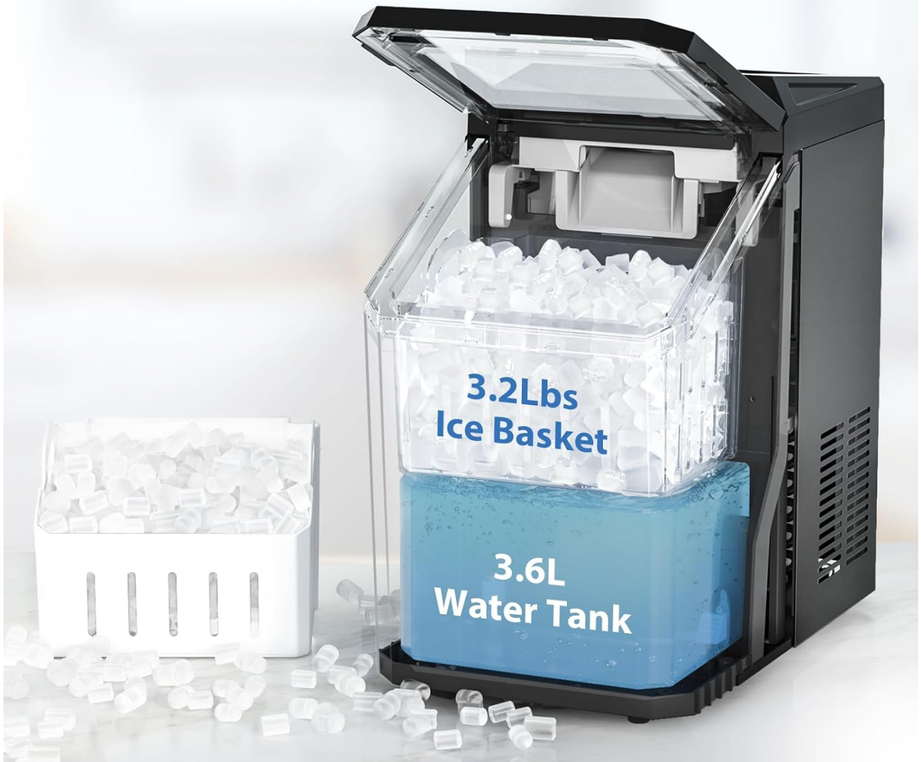
Figure 3.2: Internal view of the ice maker, highlighting the 3.6L water tank and the 3.2 lbs removable ice basket. This illustrates the large capacity for continuous ice production.

Makes More Ice at Once, Perfect for Large Party