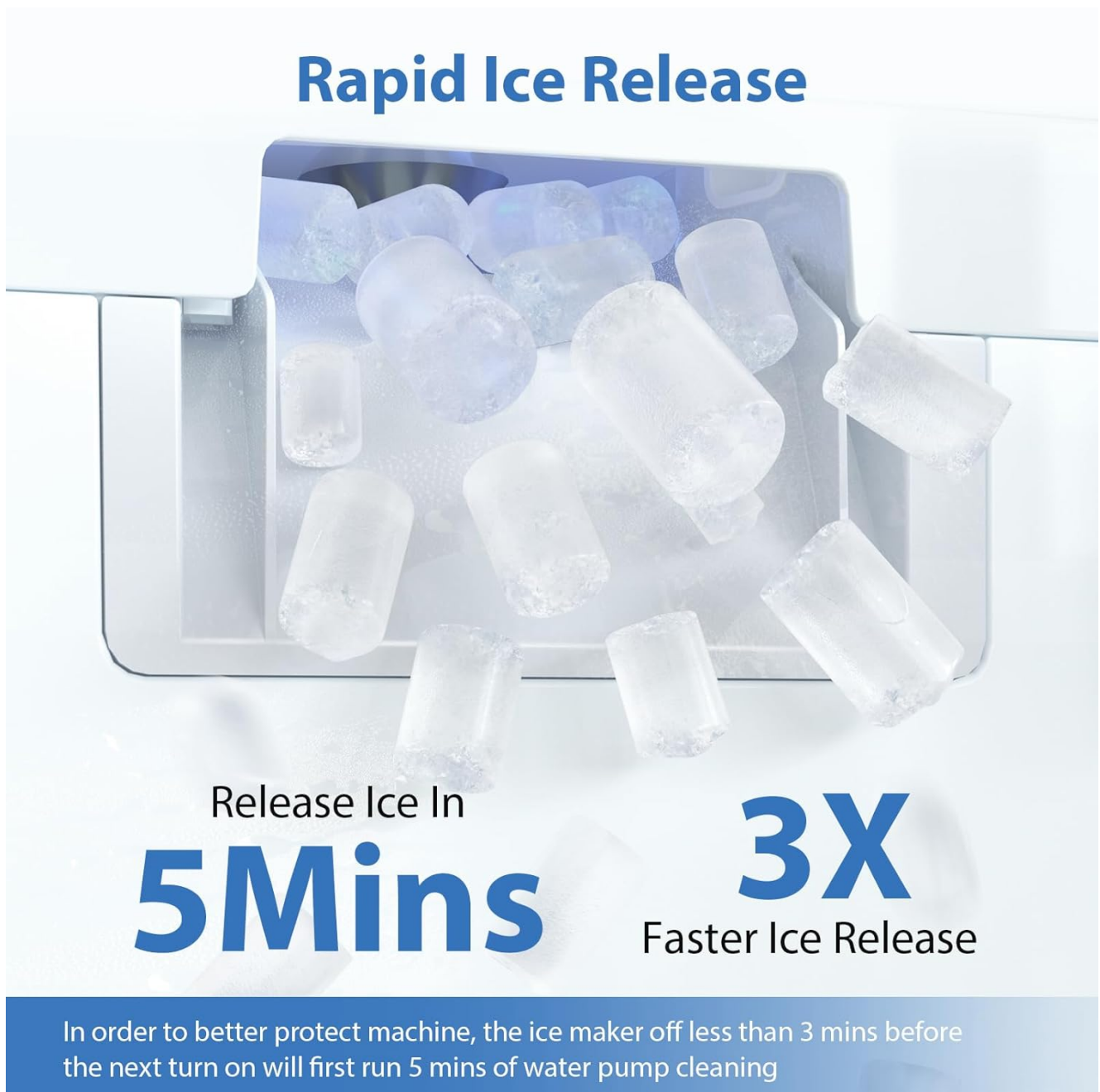
Figure 5.1: Close-up view of the ice maker's internal mechanism, showing ice being released. Text indicates 'Rapid Ice Release In 5 Mins'.

Once powered on and with sufficient water, the 'Making Ice' indicator will illuminate. The unit will begin producing nugget ice, with rapid ice release in approximately 5 minutes. The ice maker operates on an automatic continuous cycle.