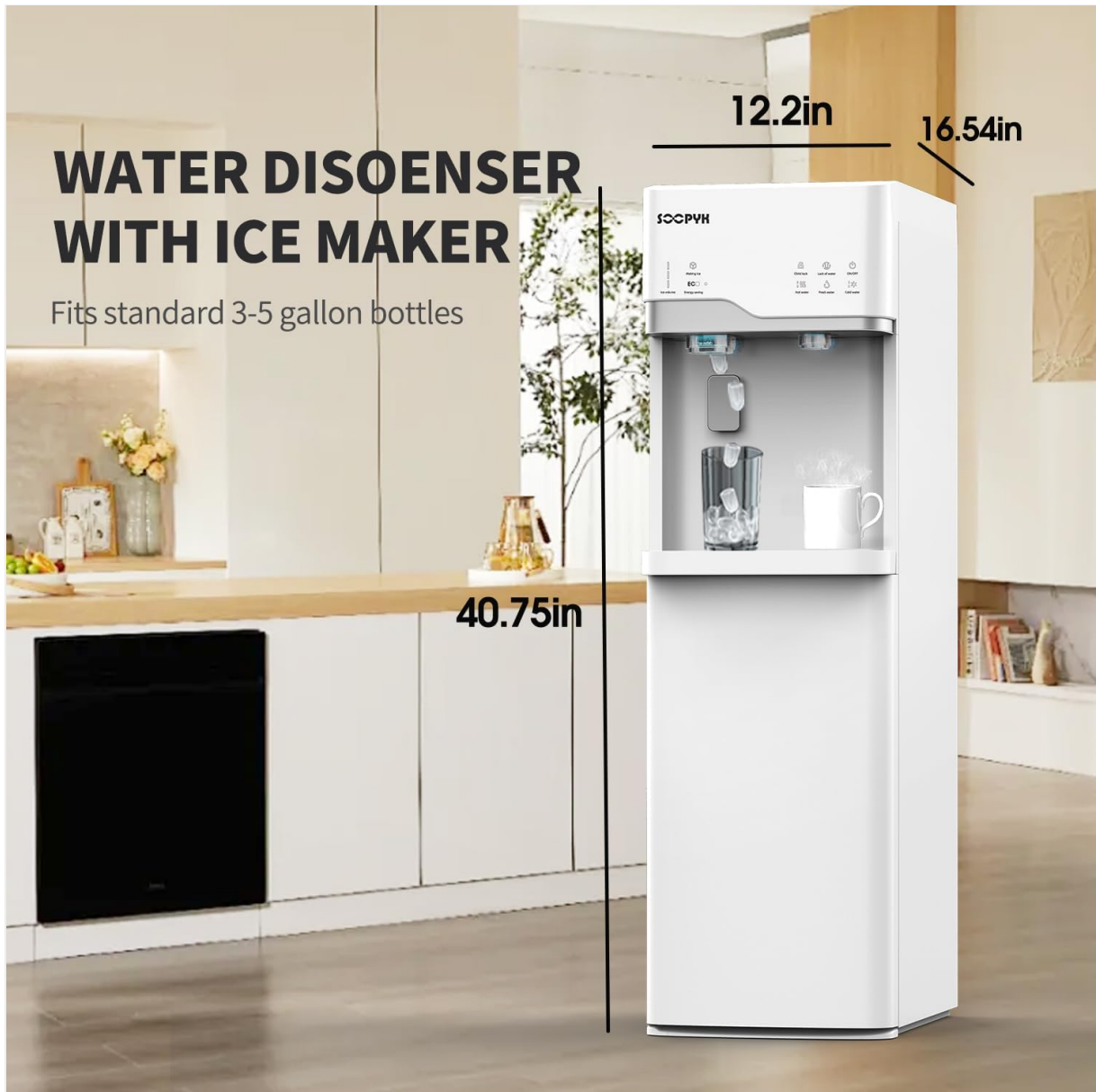
Image: The SOOPYK water cooler dispenser with key dimensions (depth, width, height) indicated.