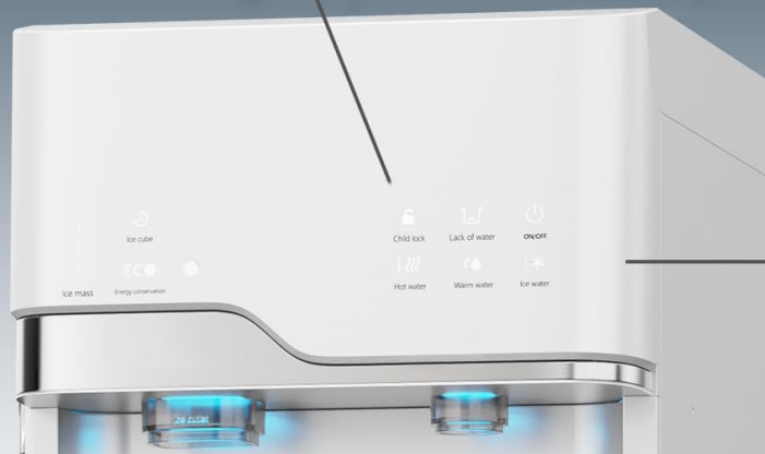
Image: Front view of the SOOPYK Water Cooler Dispenser, showcasing its sleek design and dispensing area.