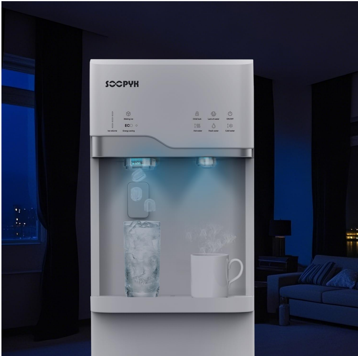
Image: The SOOPYK water cooler dispenser in a dimly lit room, with the dispensing area illuminated by a blue nightlight.

The nightlight feature illuminates the water spouts, making them visible in low-light conditions. It activates automatically when dispensing water or ice.