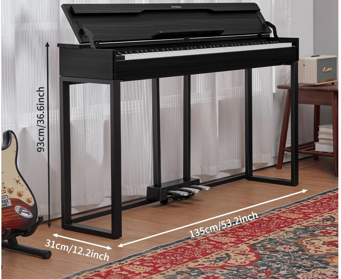
Figure 8.1: Product Dimensions

Crafted with a classic branded design in brown, it exudes understated luxury that seamlessly complements any setting