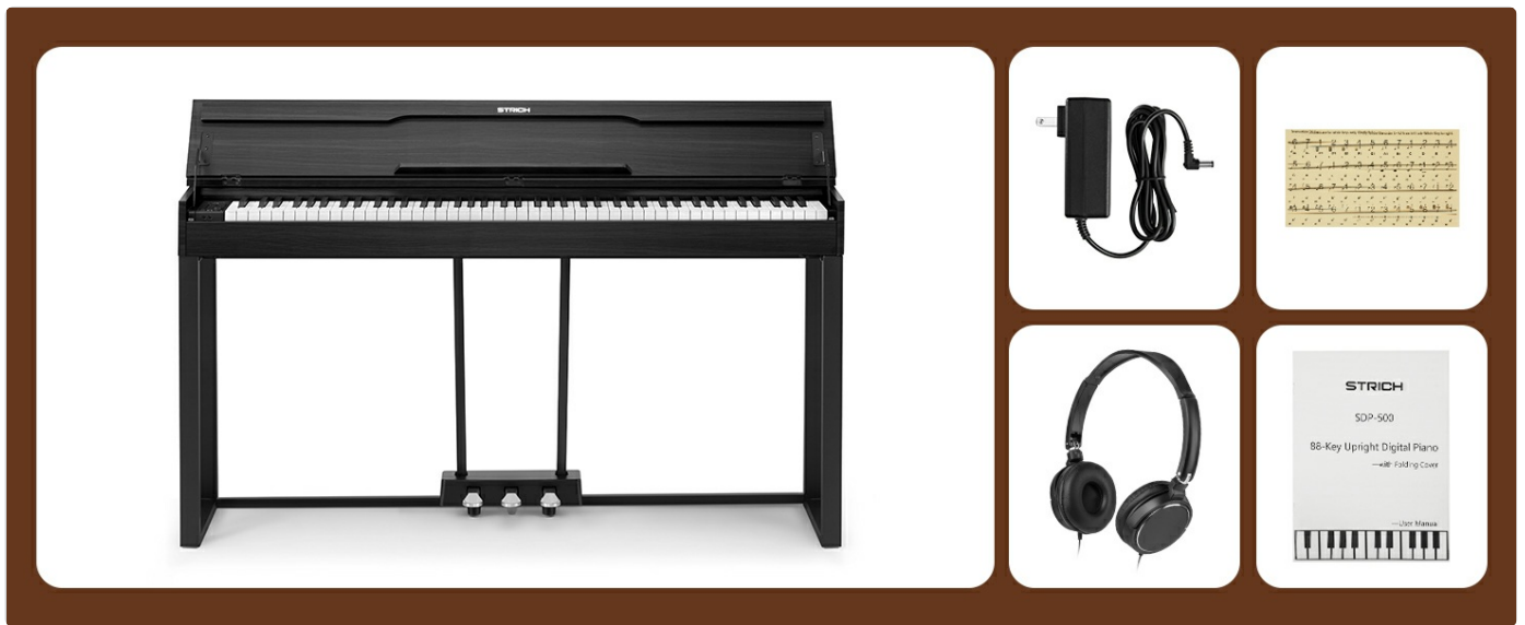
Figure 3.1: Included Accessories