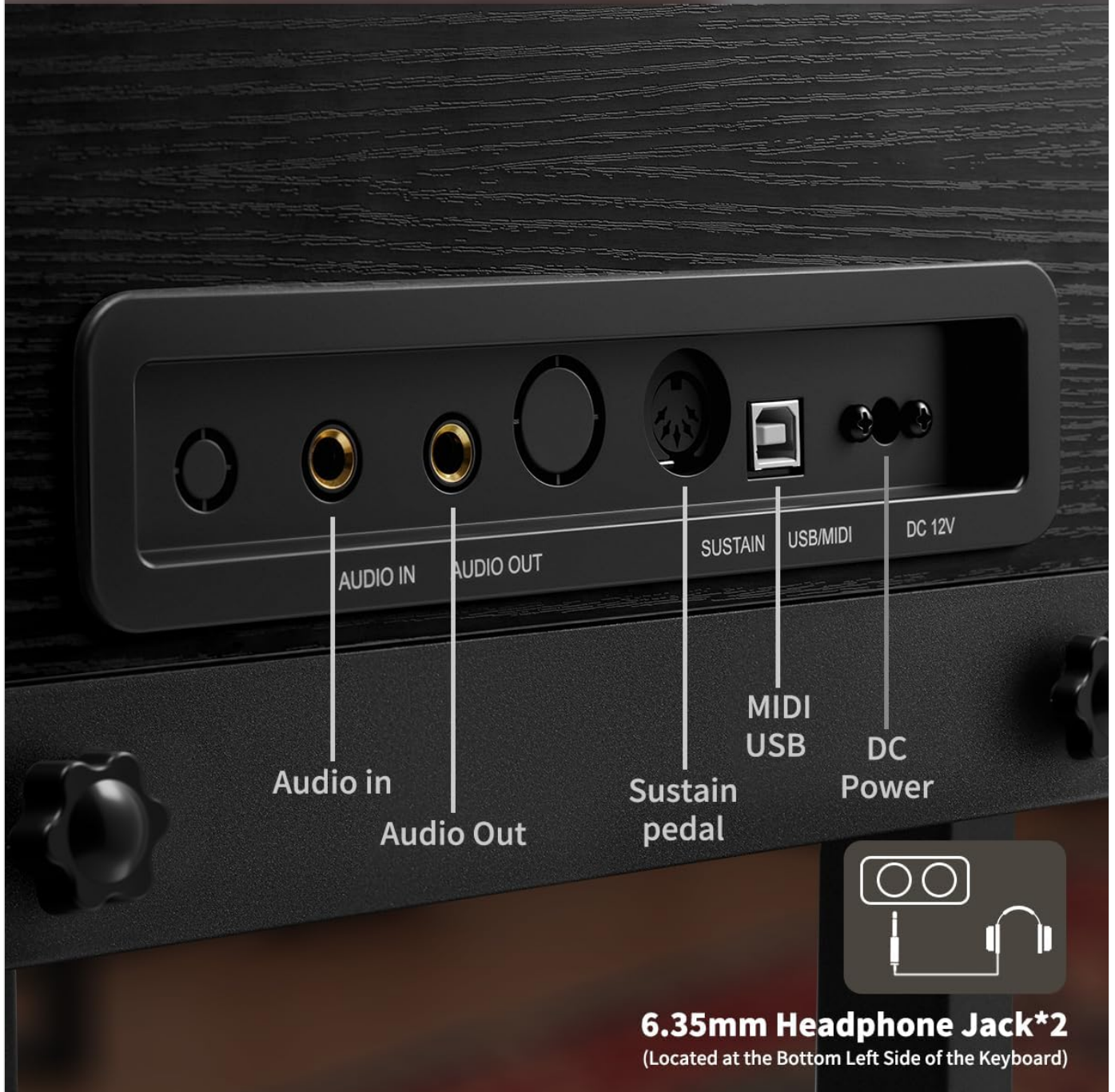
Figure 4.2: Rear Connection Panel