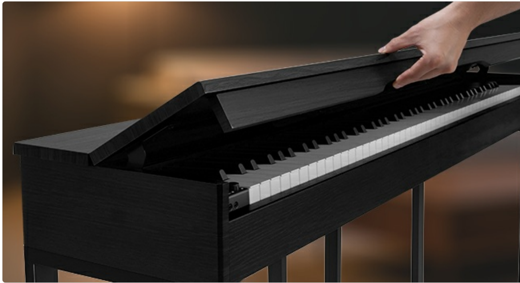
Figure 6.1: Closing the Key Cover

The integrated flip-top key cover protects the keys from dust and scratches when not in use. Gently close the cover to prevent damage.