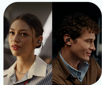
Image: Visual representation of the HUAWEI FreeClip 2's battery life and fast charging capabilities.