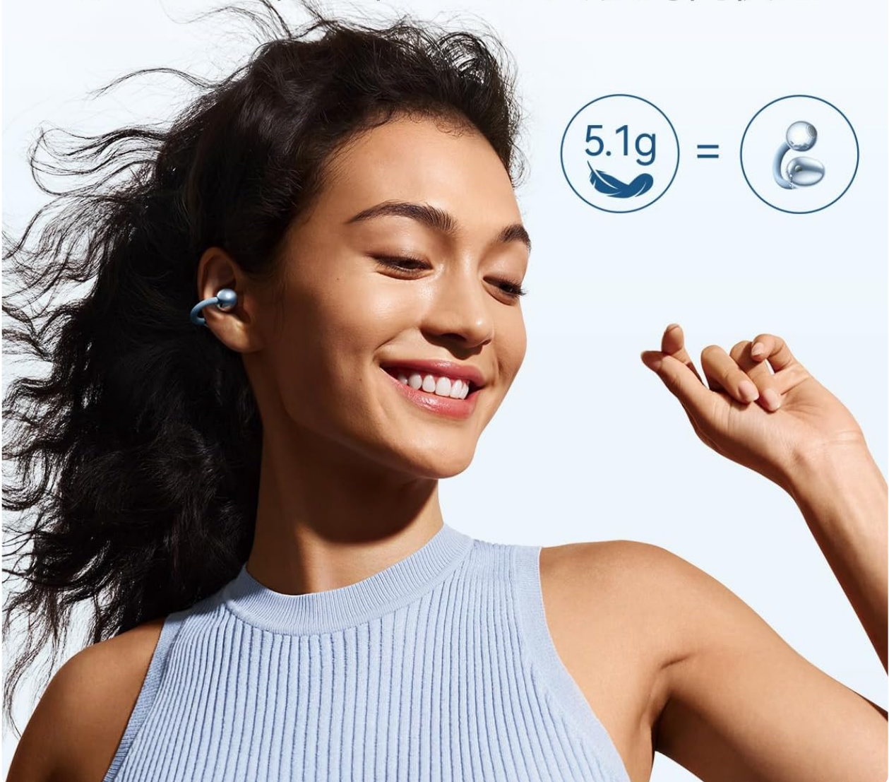
Image: A woman wearing the HUAWEI FreeClip 2 earphones, demonstrating the comfortable and discreet fit.