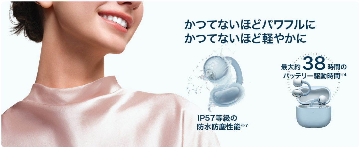
Image: The HUAWEI FreeClip 2 earphones shown with water splashes, illustrating their IP57 dust and splash resistance.