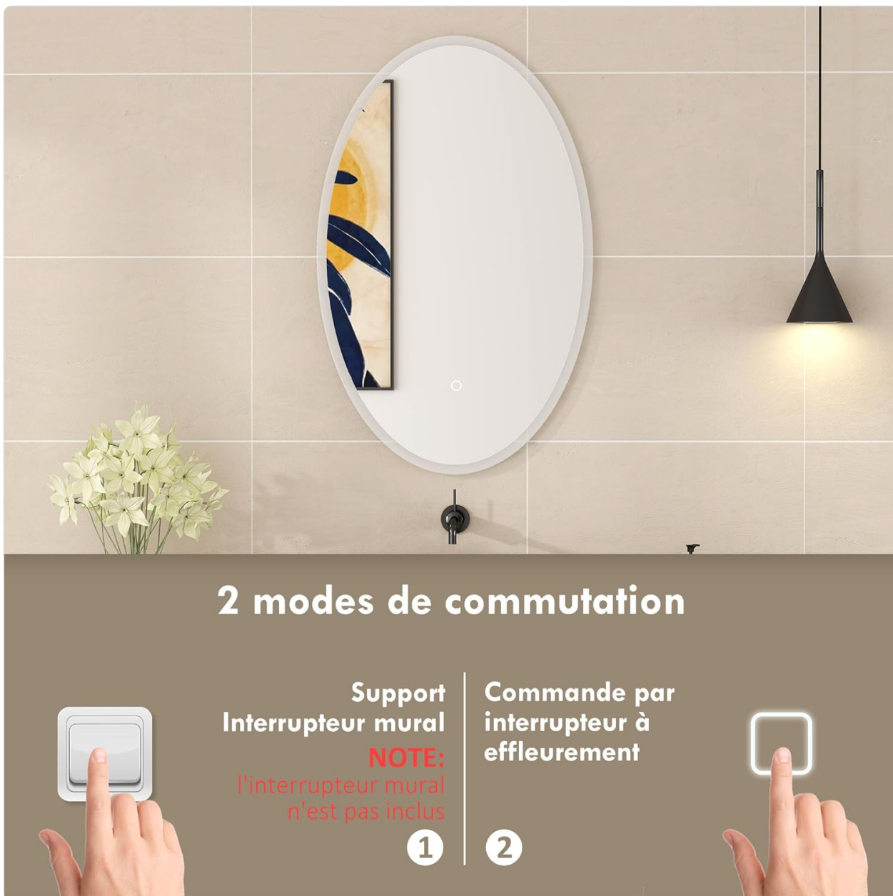
Image: An illustration demonstrating two ways to control the mirror's functions: via a wall switch (not included) or directly using the integrated touch sensor on the mirror surface.