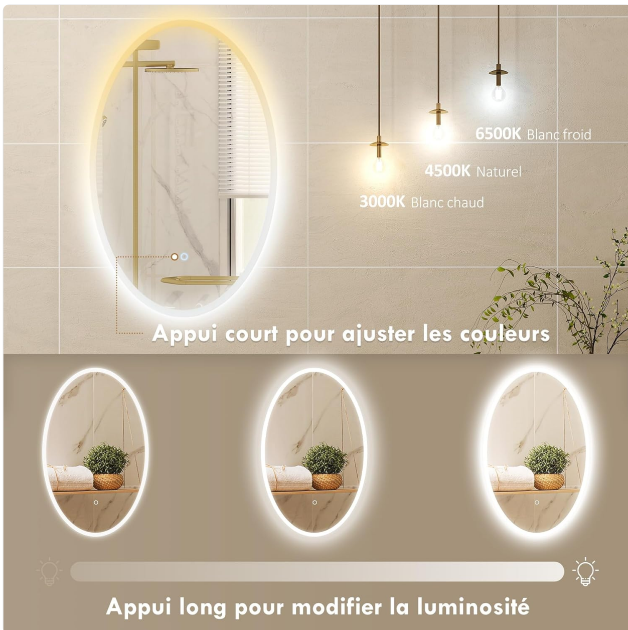
Image: Instructions for operating the mirror's lighting. A short press on the touch sensor changes the light color (3000K Warm, 4500K Natural, 6500K Cold), while a long press adjusts the brightness.