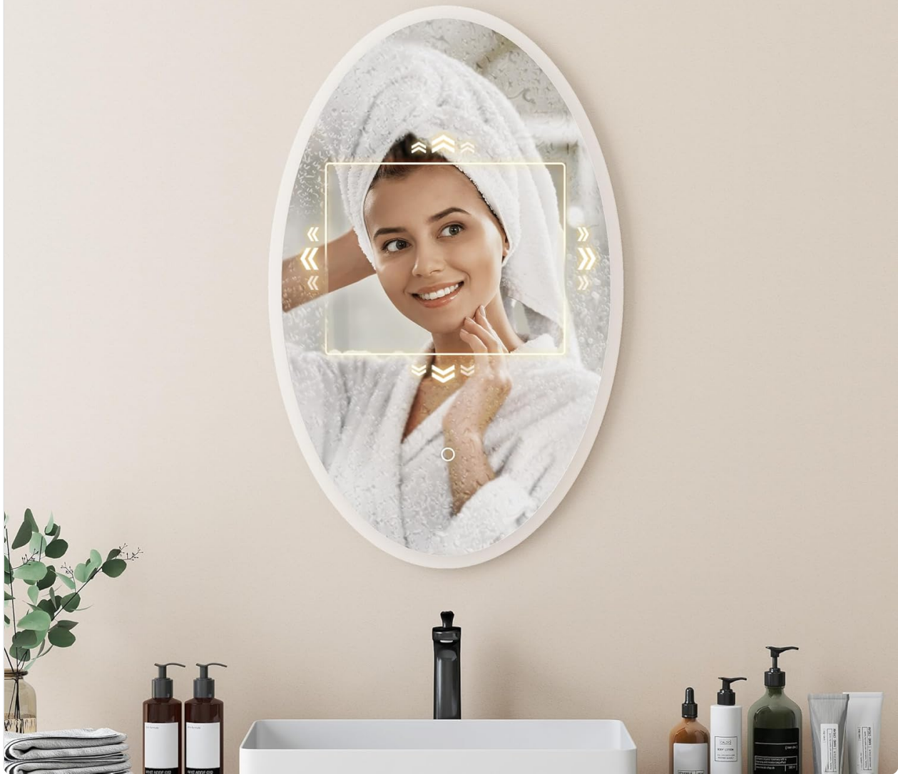
Image: A visual demonstration of the anti-fog function, showing a clear central image of a woman in a humid bathroom environment.

Offre une image centrale claire, même dans une salle de bains humide