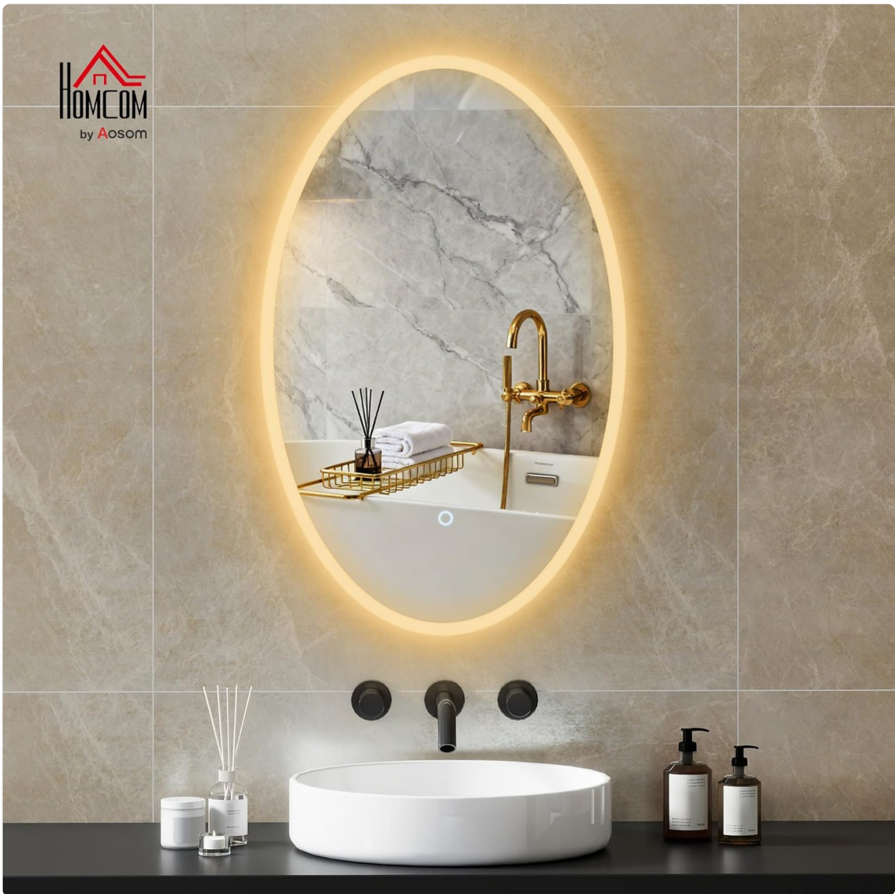
Image: The HOMCOM LED Bathroom Mirror, an oval mirror with illuminated edges, installed in a modern bathroom setting above a white sink with a gold faucet. The mirror displays a warm light glow.