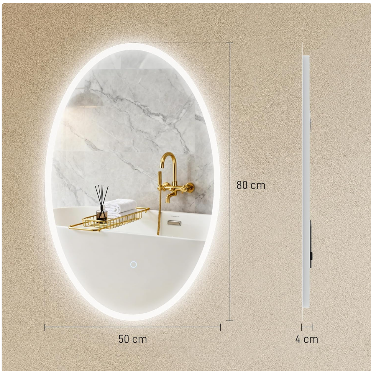
Image: A diagram illustrating the mirror's dimensions: 80 cm in height, 50 cm in width, and 4 cm in depth.