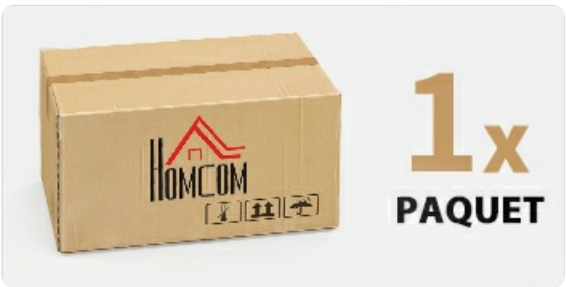
Image: A brown cardboard box with the HOMCOM logo and text indicating '1x PACKAGE', representing the product packaging.