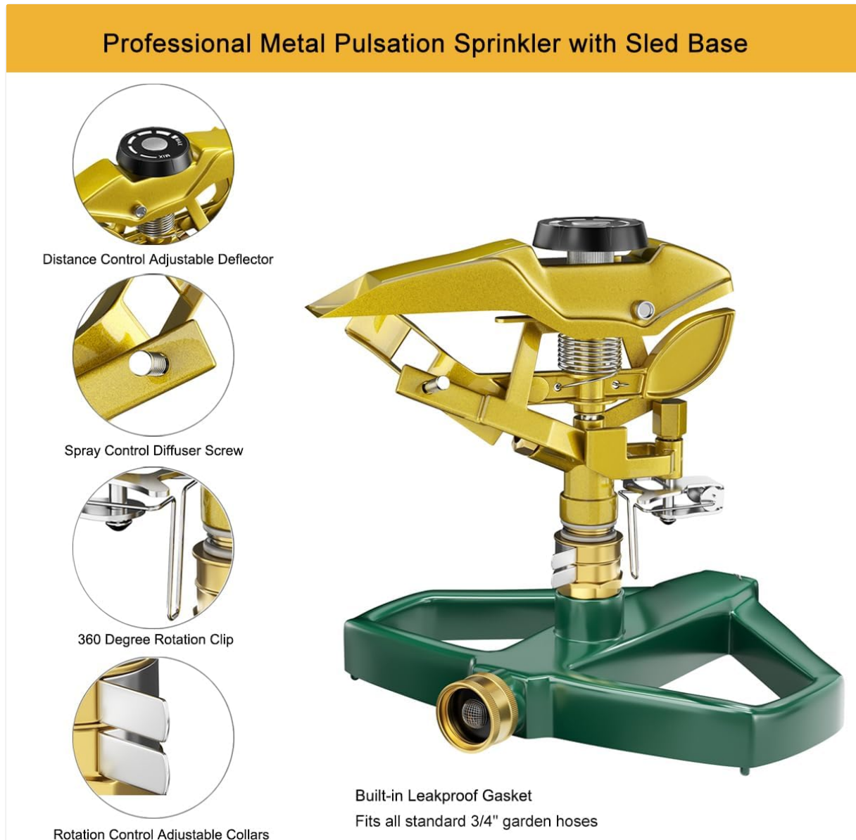
Figure 1: Overview of the FANHAO Pulsating Impact Sprinkler. This image highlights the Distance Control Adjustable Deflector, Spray Control Diffuser Screw, 360 Degree Rotation Clip, and the Built-in Leakproof Gasket.

The FANHAO Pulsating Impact Lawn Sprinkler features a durable all-metal construction designed for longevity and reliable performance. Key components include: