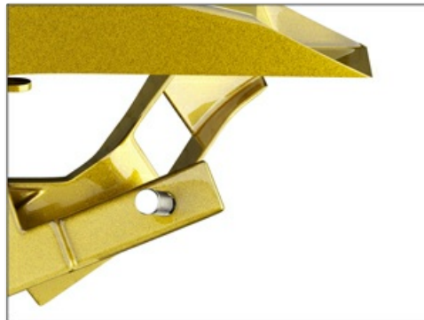
Figure 3: Detail of the rotation control clips used to set the watering arc.