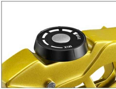
Figure 4: The adjustable deflector knob for controlling spray distance.