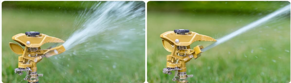
Figure 6: Examples of adjustable spray patterns, from a wide mist to a focused stream.