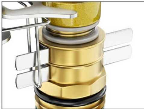
Figure 5: The diffuser screw for adjusting spray pattern and intensity.