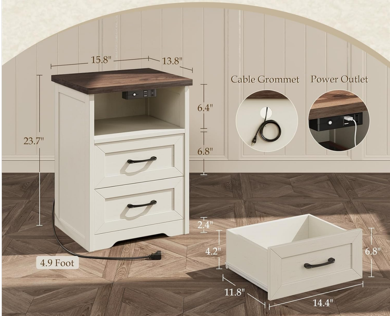
Image: Product dimensions and key features like cable grommet and power outlet.