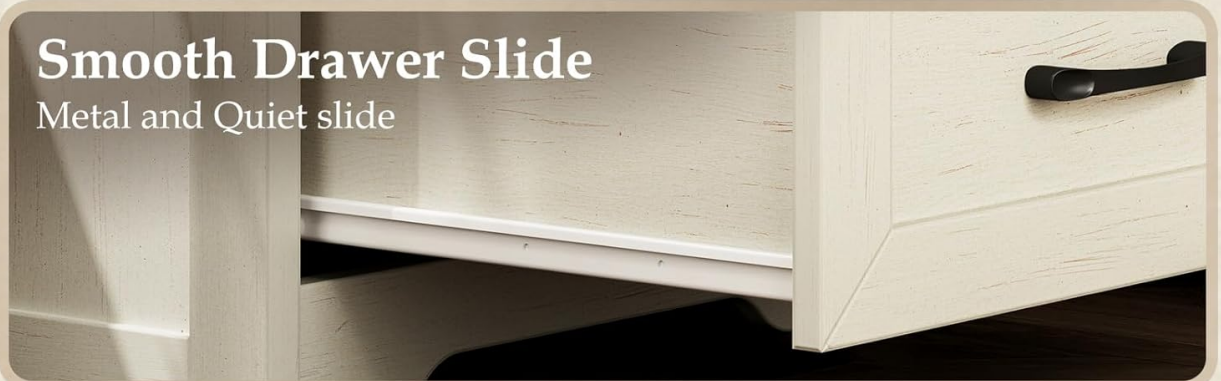
Image: Details of the sturdy drawer handle, ample storage space, and smooth metal drawer slides.