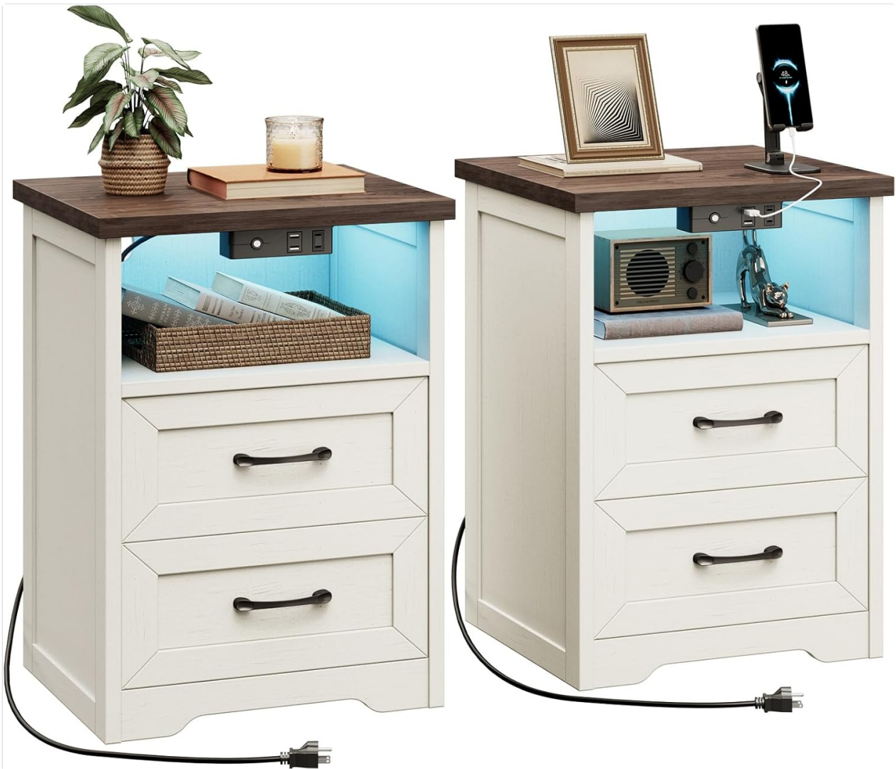
Image: AODK Farmhouse Nightstand, showcasing its rustic design, LED lighting, and charging station.