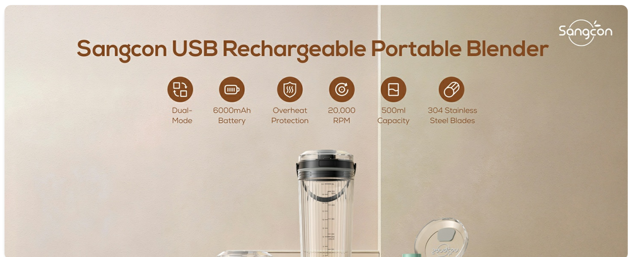
Image: Overview of the Sangcon Portable Blender's key features including dual mode, battery, and blade material.

Thank you for choosing the Sangcon Personal Portable Blender. This manual provides essential information for the safe and efficient operation, maintenance, and care of your new blender. Please read it thoroughly before first use and keep it for future reference.