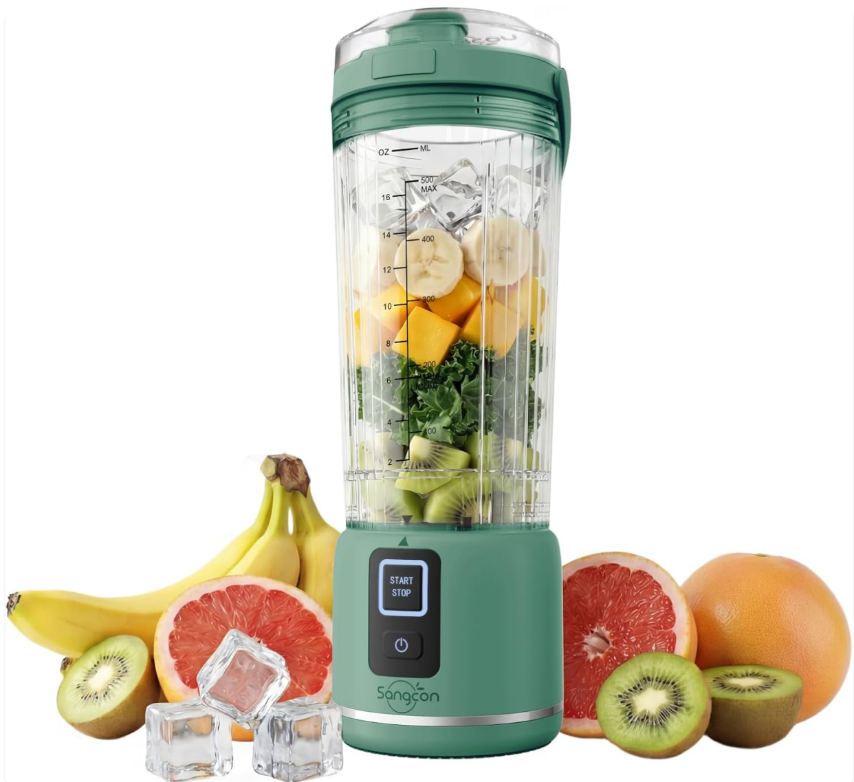
Image: The Sangcon Personal Portable Blender, illustrating its main components.