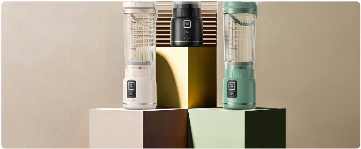
Image: The Sangcon Portable Blender in various colors, ready for use.