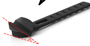
Seat Post Mount

This strap features a 45° angle for optimal mounting on your seatpost, directing the light backward for maximum rear visibility and safety.