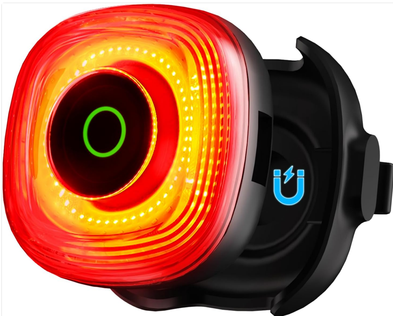
Figure 1: Magicshine SEEMEE 150 MAG Rear Bike Light

This manual provides detailed instructions for the safe and effective use of your Magicshine SEEMEE 150 MAG Magnetic Rear Bike Light. Please read this manual thoroughly before operating the device and retain it for future reference.