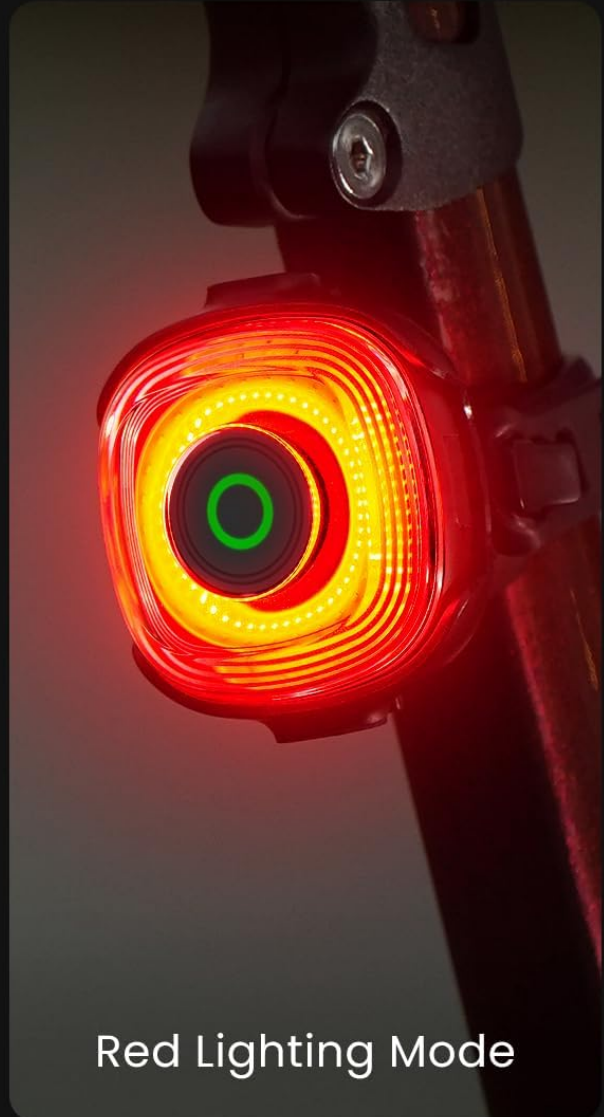
Figure 7: Dual light sources (Red and White).