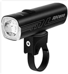
Figure 10: Product Specifications.