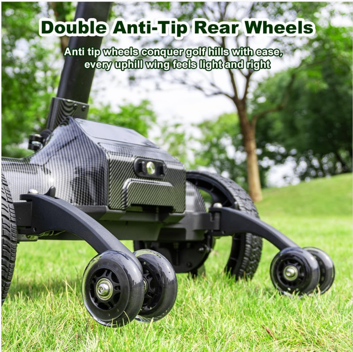
Image: A close-up view of the G3 Electric Golf Cart's double anti-tip rear wheels, designed to provide stability when traversing uphill terrain.

Anti tip wheels conquer golf hills with ease, every uphill wing feels light and right