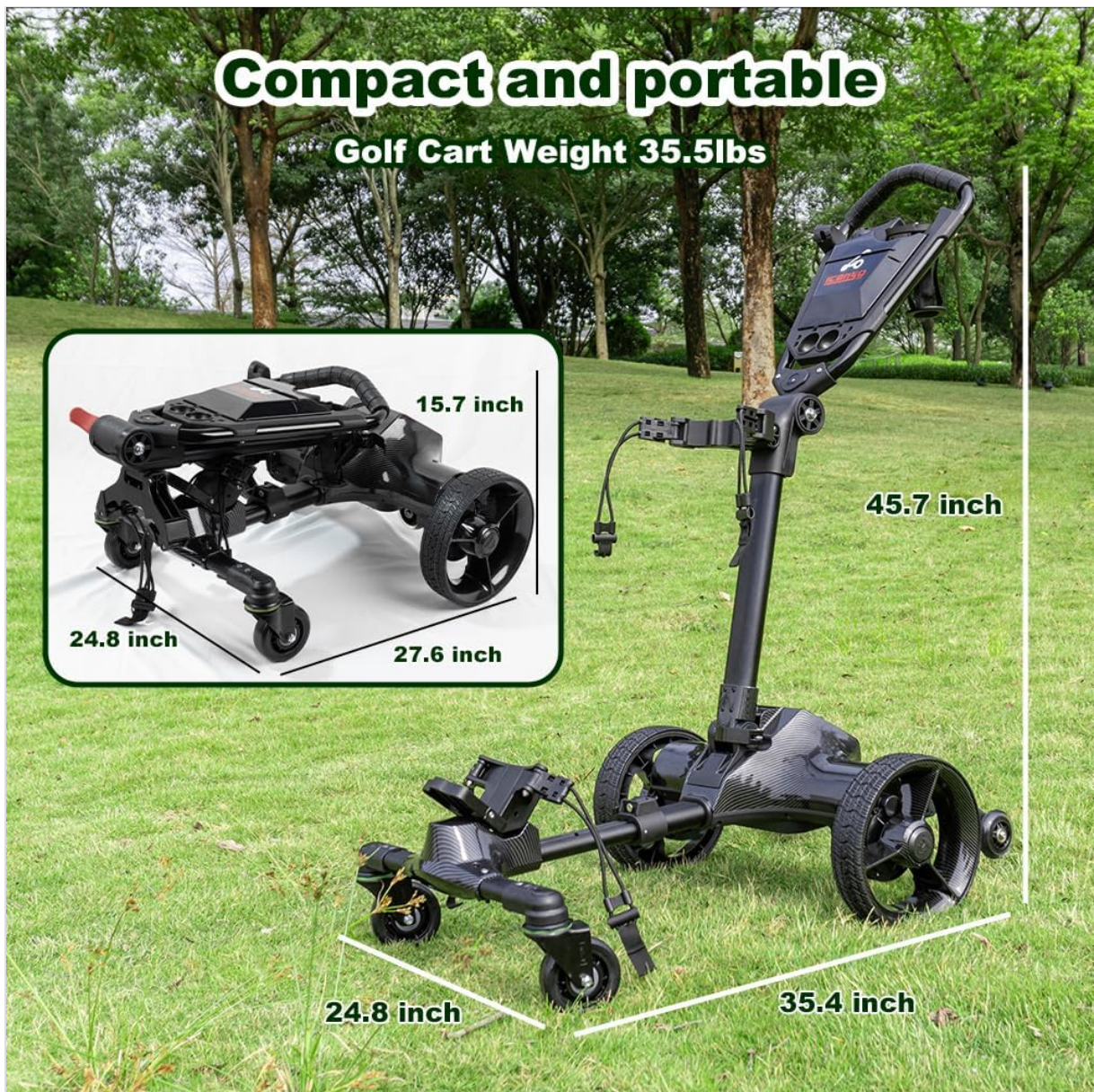
Image: The Icango caddy G3 Electric Golf Cart shown in both its unfolded and folded states, highlighting its compact dimensions for storage and transport.