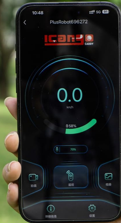
Image: A hand holding a smartphone showing the Icano caddy G3 app interface, which allows users to adjust various settings and monitor cart data.