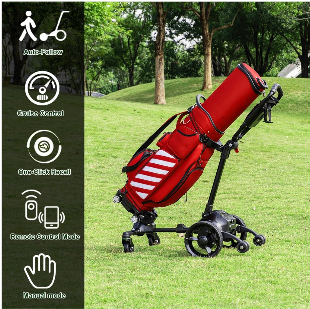
Image: The G3 Electric Golf Cart on a golf course, surrounded by icons illustrating its various operating modes, including auto-follow, cruise control, one-click recall, remote control, and manual push.