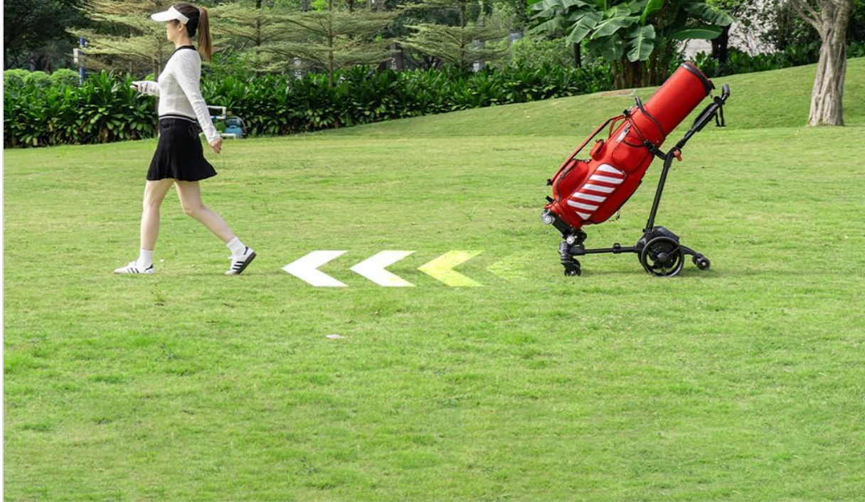
Image: A golfer walking on a green, with the G3 Electric Golf Cart following behind her, demonstrating the auto-follow feature.