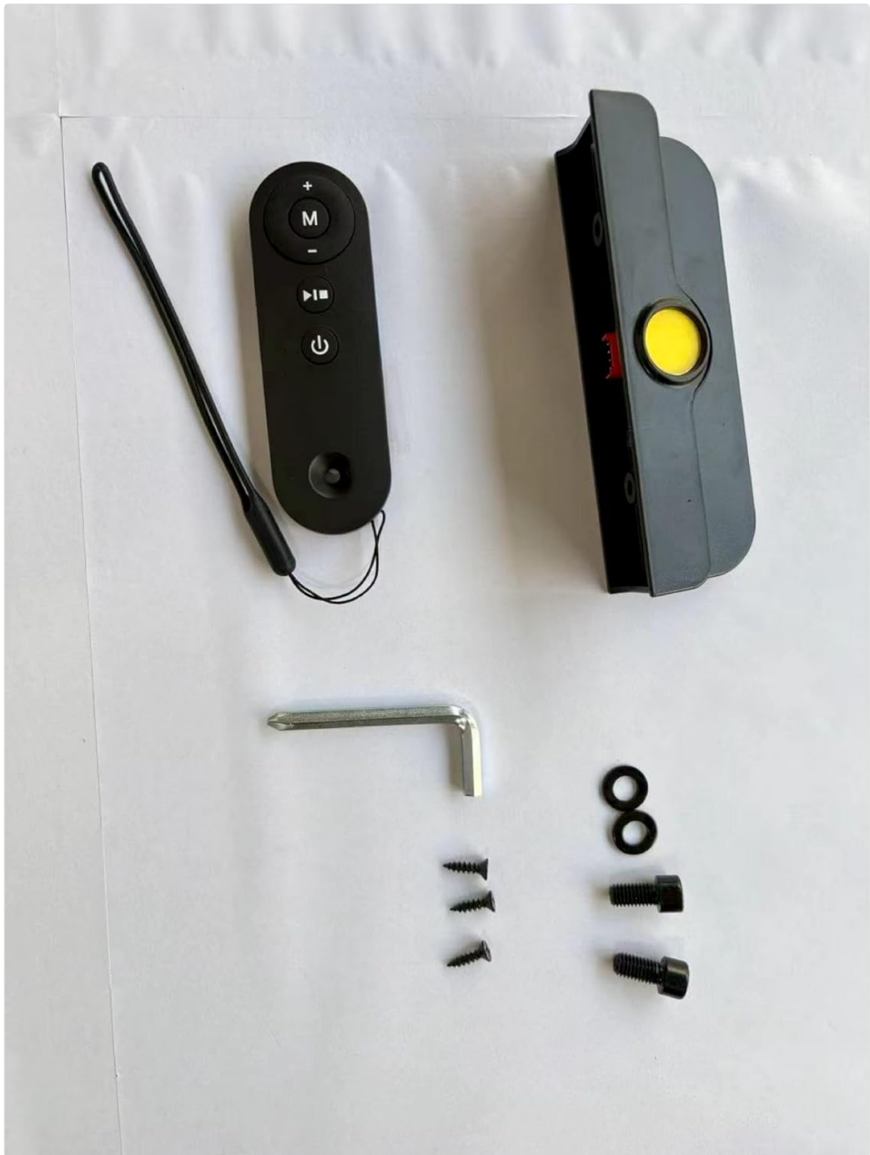
Figure 2.2: Remote control, magnetic safety switch, L-shaped wrench, small screws, and washers.