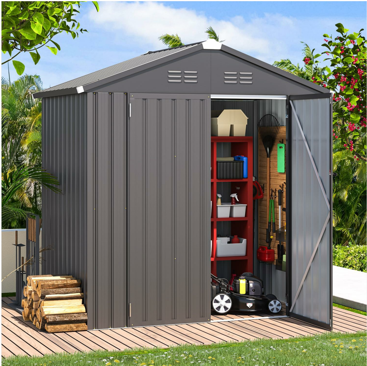
Image: The AECOJOY 6' x 4' Outdoor Storage Shed, showcasing its dark grey finish and compact design suitable for various outdoor spaces.