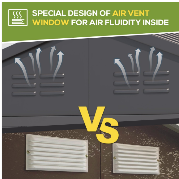
Image: Detail of the air vent window, designed to promote air circulation within the shed.