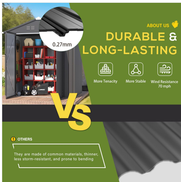
Image: Visual comparison highlighting the robust thickness of the AECOJOY shed's metal panels for enhanced durability.