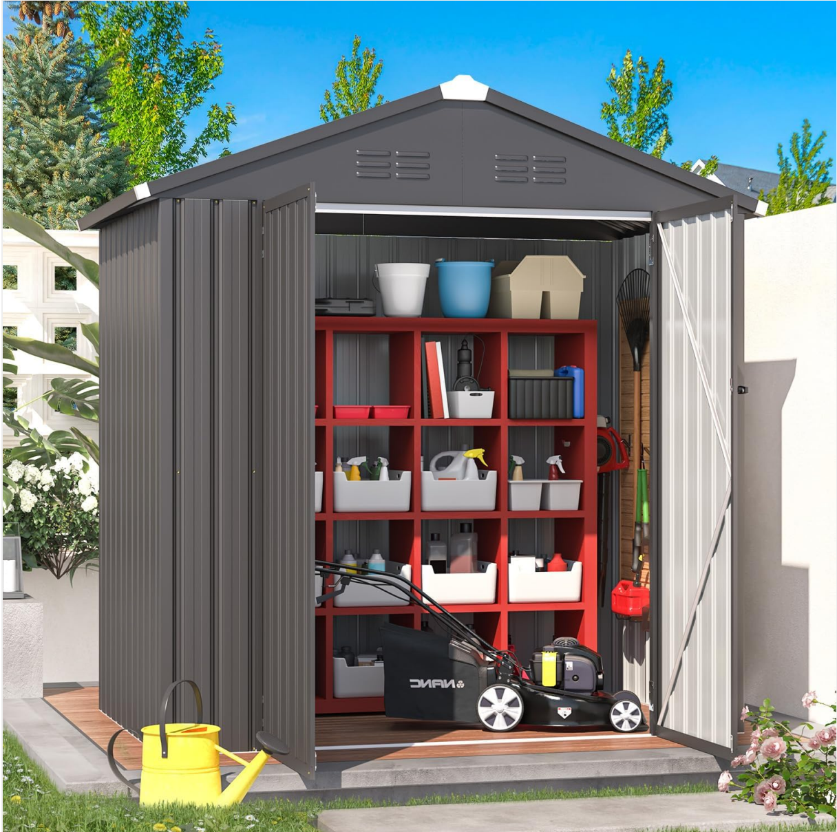
Image: The exterior of the AECOJOY shed, illustrating the completed assembly ready for use.

Refer to the included detailed manual and step-by-step video tutorials for visual guidance. Our expert technical team is available for remote assistance if needed.