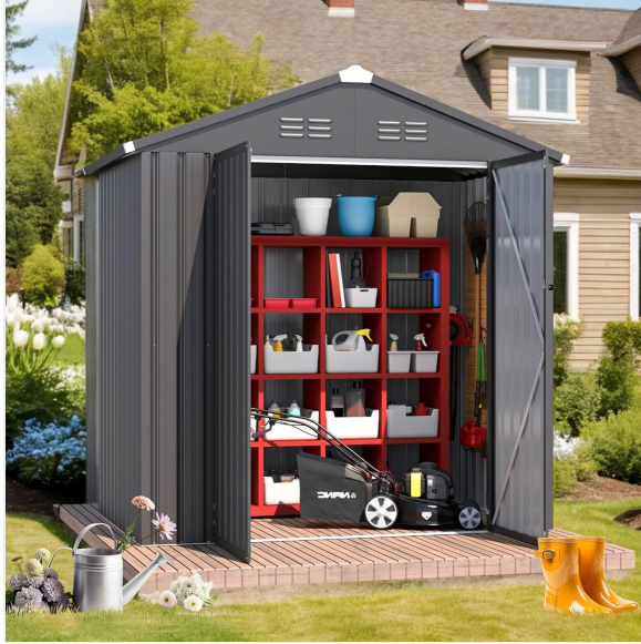
Image: Interior view of the shed demonstrating its spacious capacity for various tools and equipment.