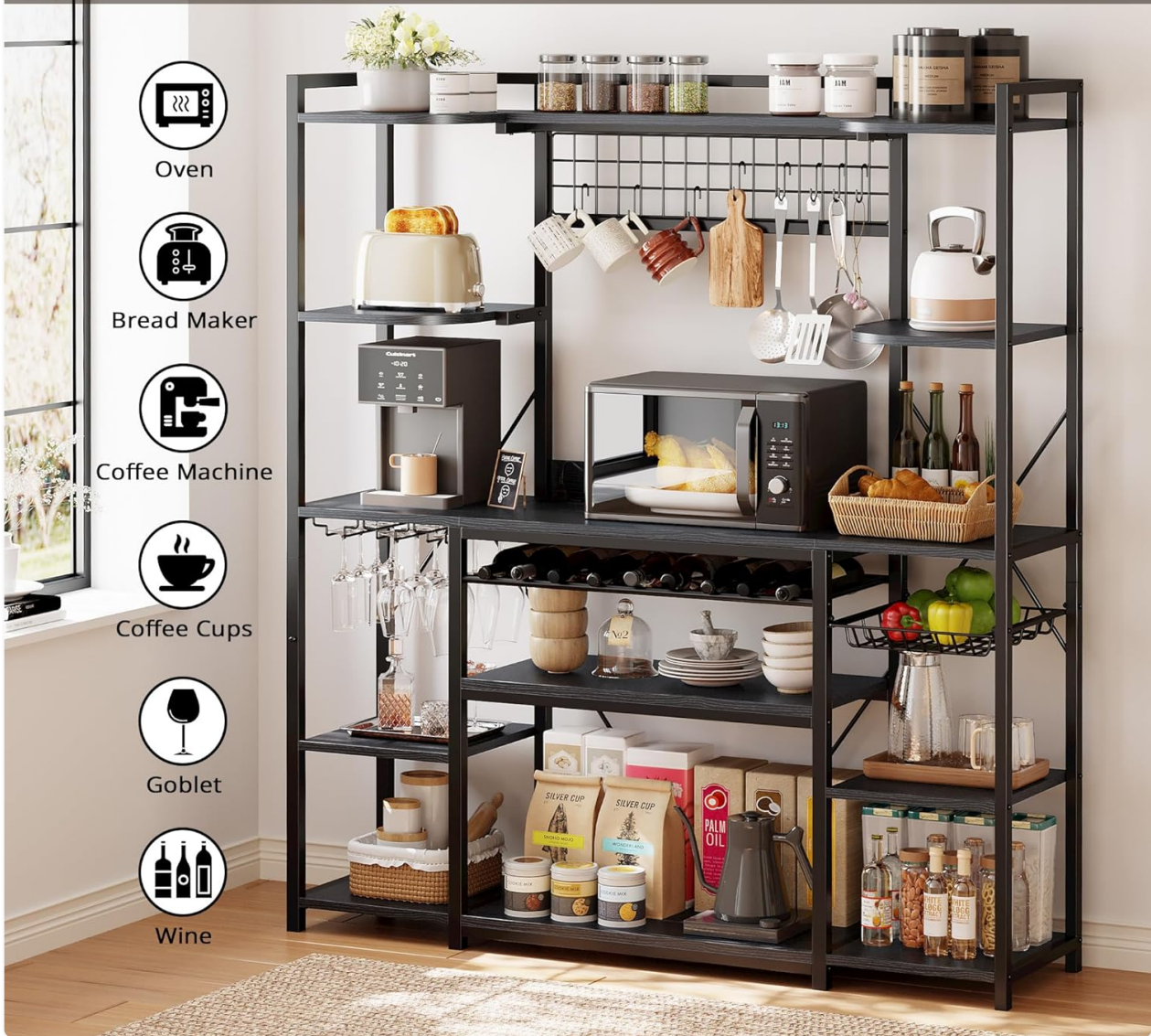
Image 1.1: The IRONCK Large Bakers Rack demonstrating its versatile storage capabilities for kitchen appliances and items.

This bakers rack features a spacious 62.4-inch wide countertop, ideal for accommodating larger appliances such as microwaves, coffee makers, or blenders. It includes integrated storage options like open shelves, a wine rack, a pull-out wire basket, and S-hooks for organizing kitchen essentials, bottles, and vegetables. The sturdy construction combines high-quality engineered wood (MDF) with a durable metal frame, ensuring stability and longevity.