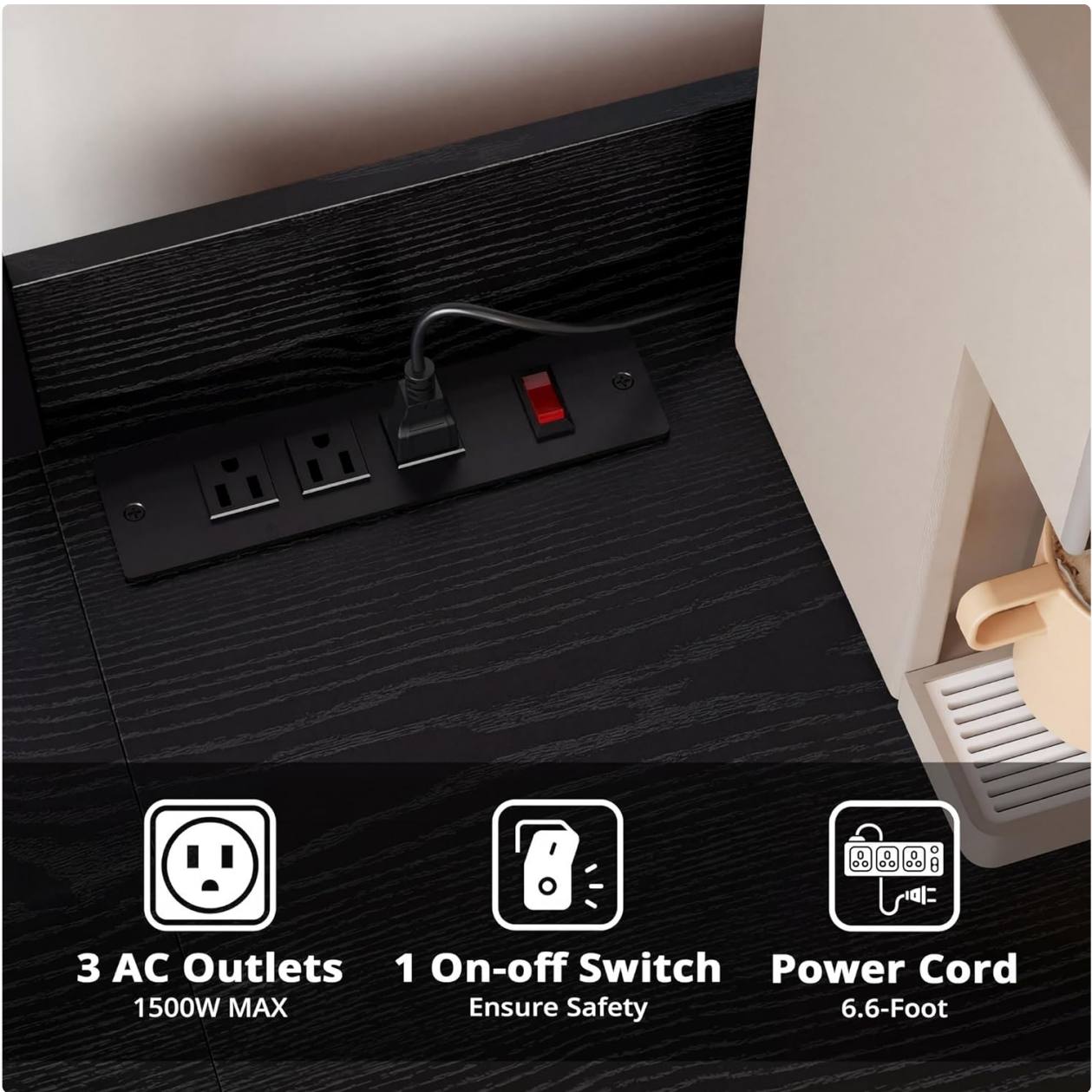
Image 5.1: Detail of the integrated power outlet with 3 AC outlets, on-off switch, and 6.6-foot power cord.