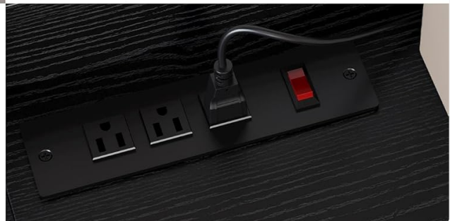
Image 5.2: Overview of the functional storage elements: S-hooks, pull-out wire basket, wine rack, and power outlet.

Your browser does not support the video tag.