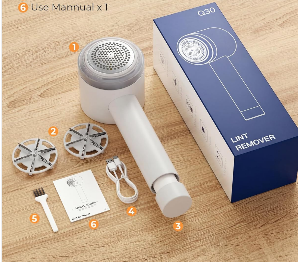
Image: All components included in the Peiyuu Q30 Fabric Shaver package.