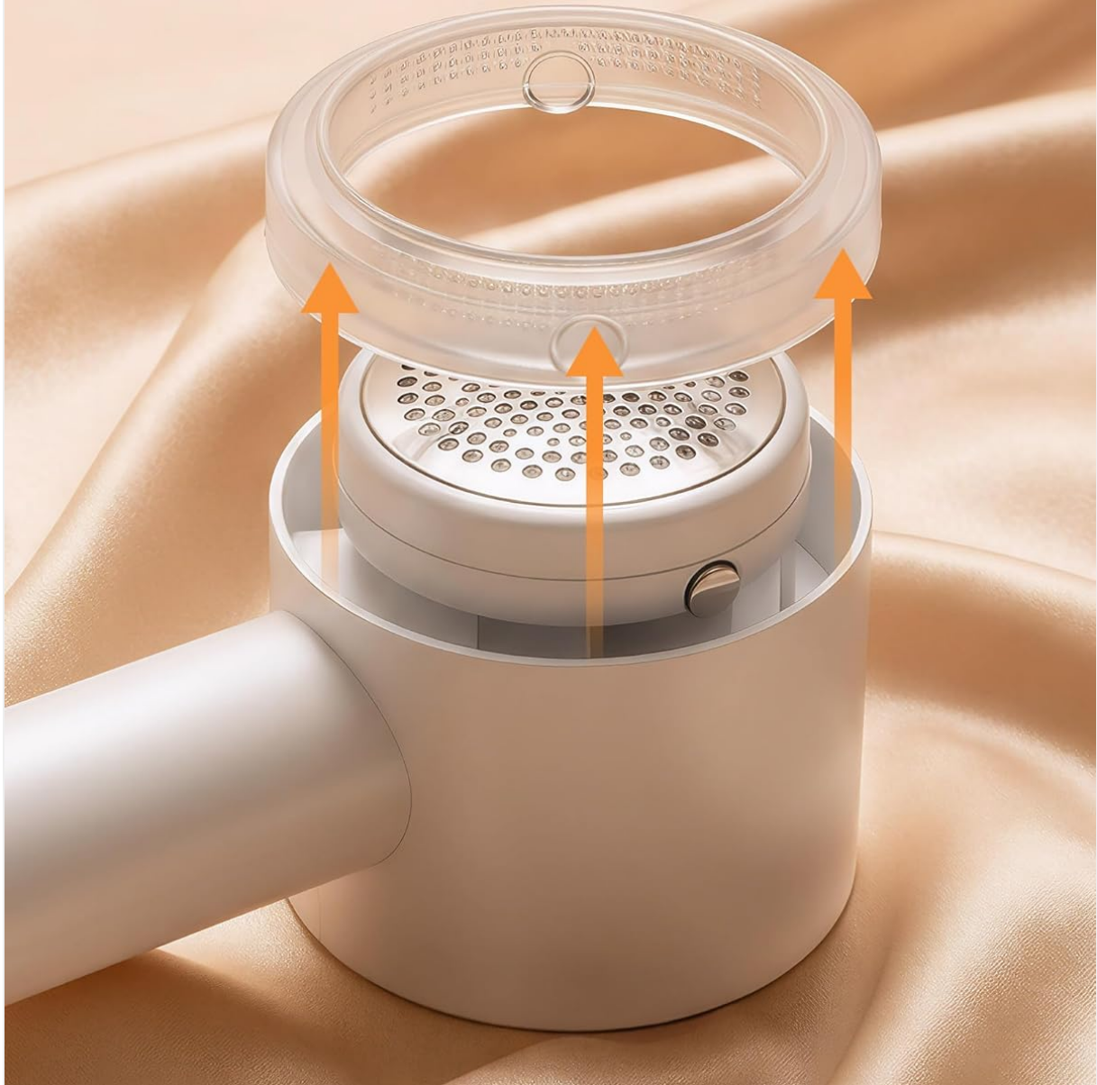
Image: Removing the magnetic lint container for cleaning.