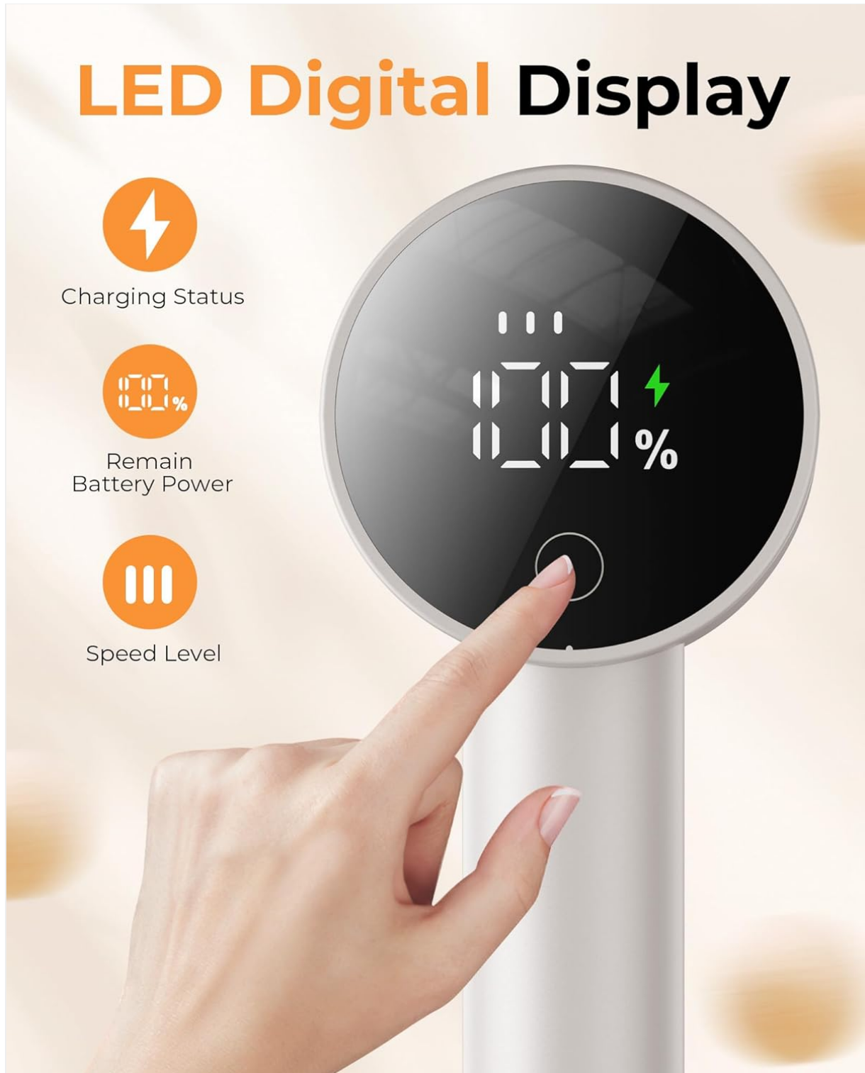
Image: LED Digital Display showing battery and speed settings.

Press the power button once to turn on the device. The LED display will illuminate, showing the current battery level and speed mode. Press the button again to cycle through the three available speed settings (Level 1, Level 2, Level 3). Long-press the power button to turn off the device instantly.