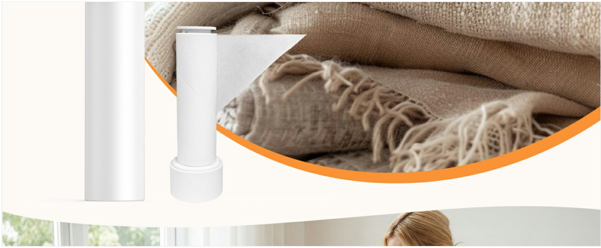
Image: The lint roller attachment collecting fuzz from fabric.