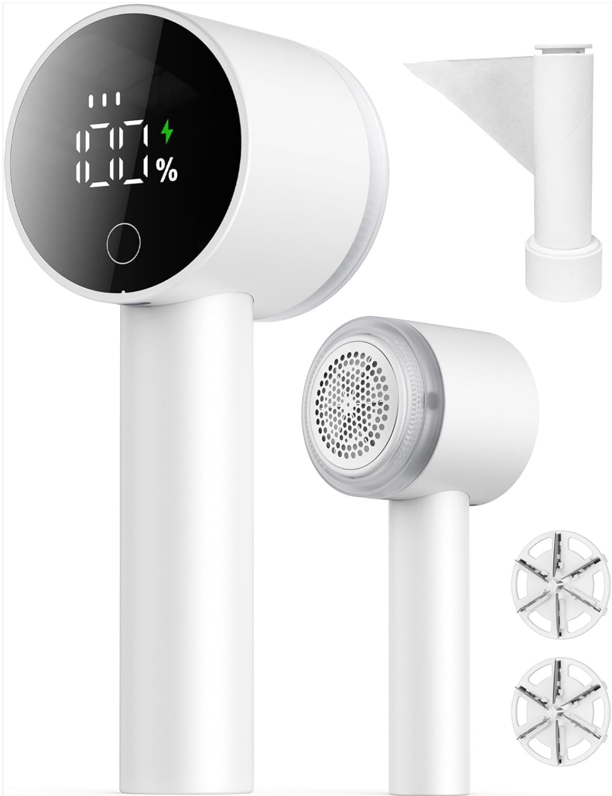
Image: Peiyuu Q30 Fabric Shaver with its integrated lint roller.