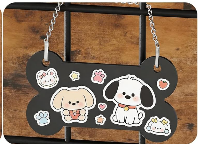
Image: Customization options for the chalkboard nameplate.