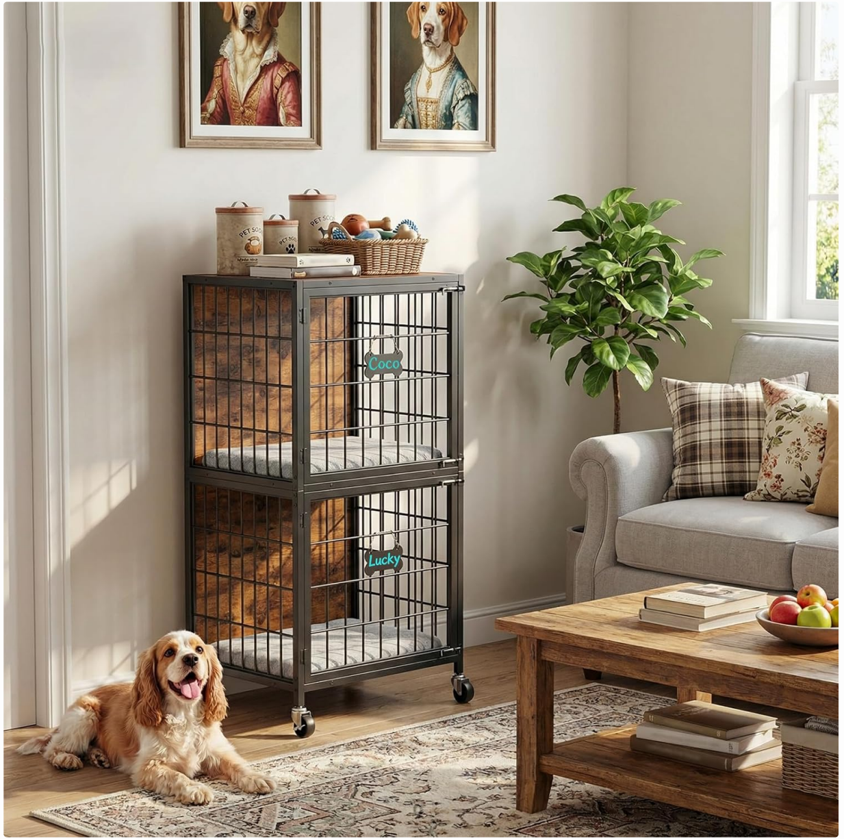
Image: Assembled MAHANCRISS DCHR5401 Double Dog Crate Furniture in a home environment.