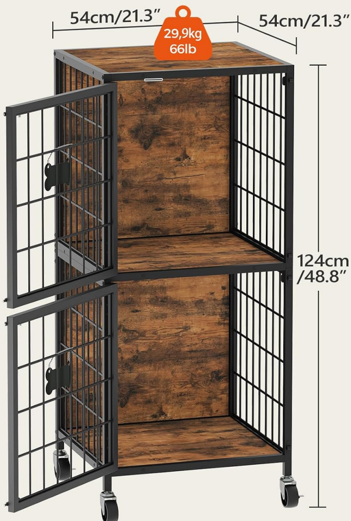
Image: Detailed dimensions of the dog crate furniture.