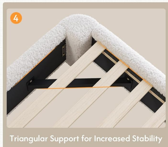
Image 3.1: Illustration of the bed frame's stability features, including wide wingback support, Velcro for securing slats, sturdy frame construction, and triangular support.

If any parts are damaged, scratched, or missing, please contact customer support immediately.