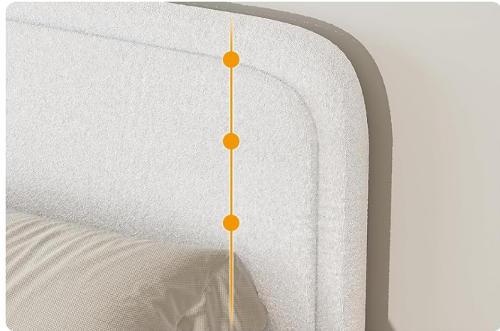
Image 2.2: Illustration of the 105° ergonomically reclining headboard providing waist and back support.