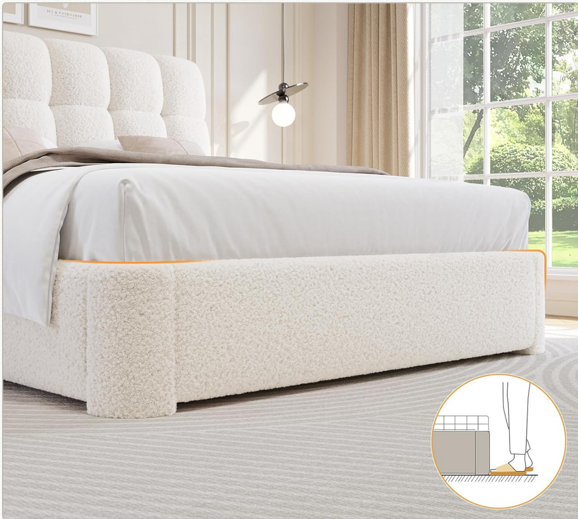
Image 2.3: View of the curved anti-collision design on the bed frame's corners and legs.

From the curvature of the backrest to the rounded legs