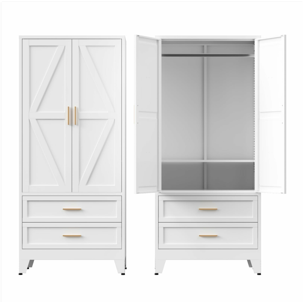
Image 1.1: The COFaR Metal Armoire Wardrobe Closet with Drawers, showcasing its interior storage capacity.