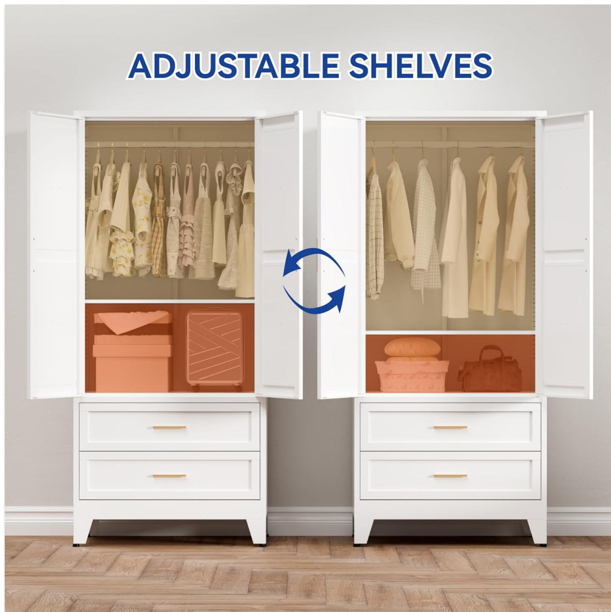
Image 5.1: The adjustable shelf feature, allowing customization of storage space.

such as folded clothes, boxes, or luggage. To adjust, carefully lift the shelf and reposition it into the desired slots.