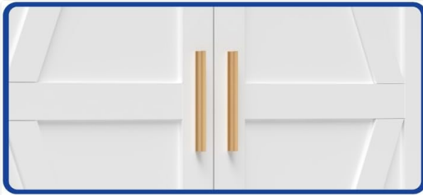
Farmhouse Doors Design