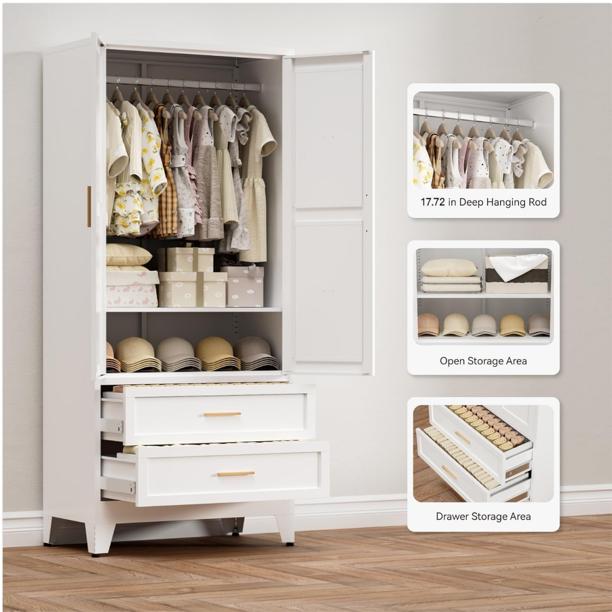
Image 5.2: Overview of the wardrobe's interior, highlighting the hanging rod, open storage area, and drawers.