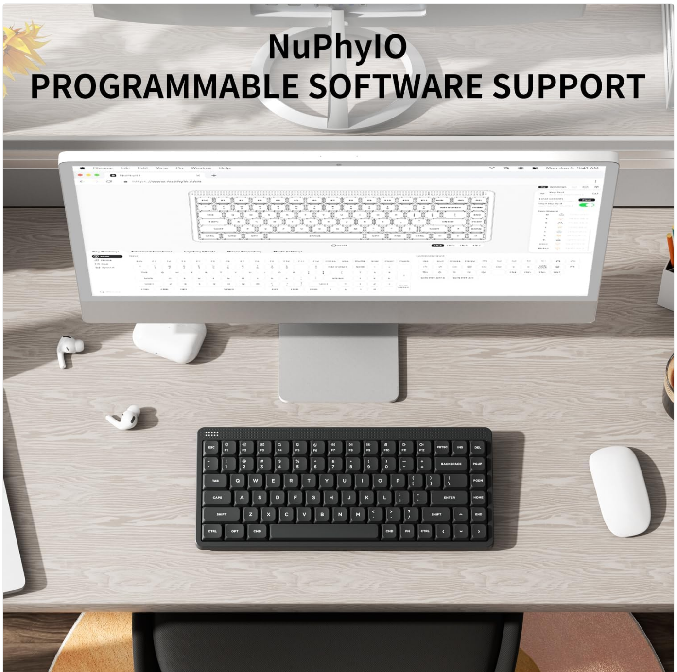
Image: The nuphy Node75 keyboard positioned in front of a monitor displaying the NuPhyIO software interface, demonstrating programmable software support.