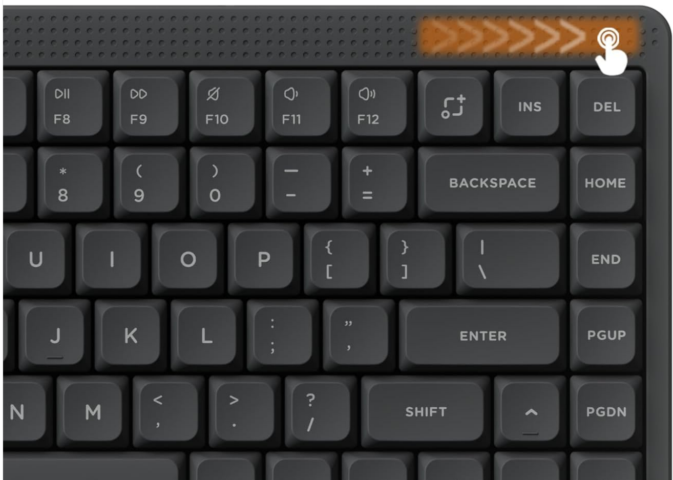
Image: Close-up view of the top right section of the Node75 keyboard, highlighting the touch-sensitive area for gesture control.

(NuPhyIO enables more customizable operation settings)