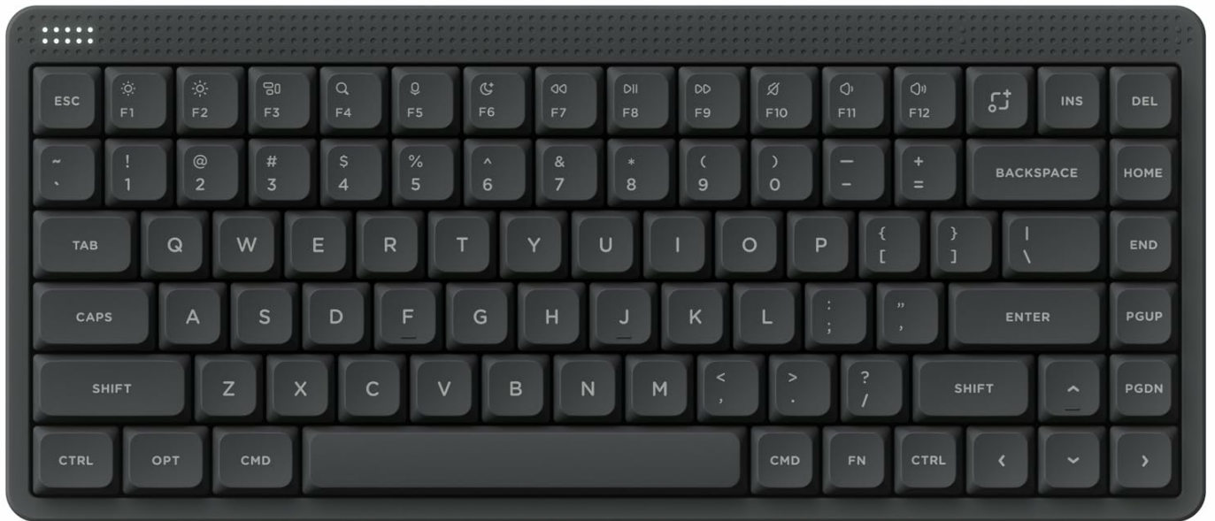
Image: The nuphy Node75 Wireless Mechanical Keyboard in Gray Low Profile, showcasing its compact 75% layout.