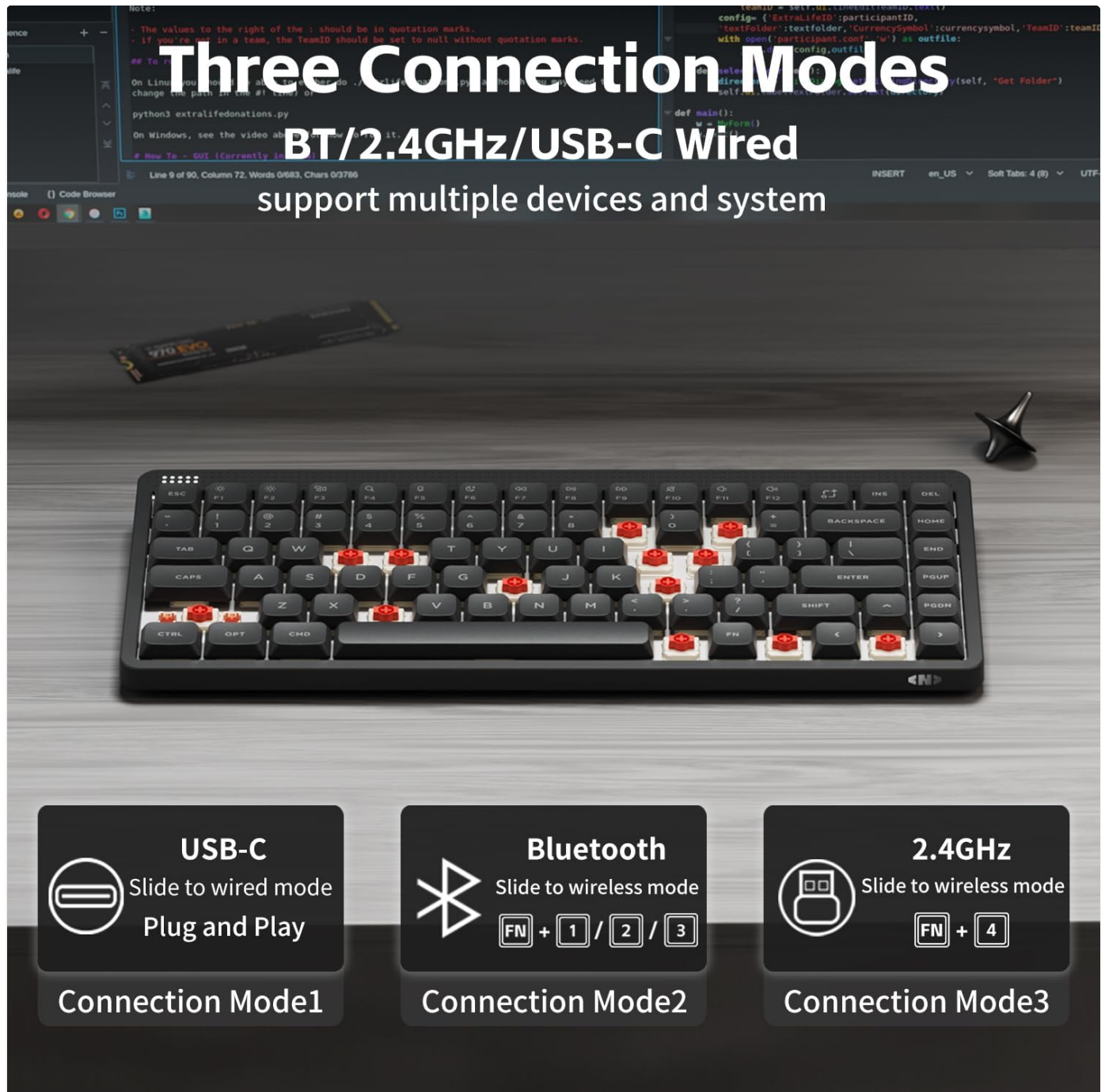
Image: Diagram illustrating the three connection modes: USB-C (wired), Bluetooth, and 2.4GHz wireless, along with their activation key combinations.

The Node75 supports three connectivity modes: USB-C wired, Bluetooth, and 2.4GHz wireless. A switch on the keyboard allows you to select the desired mode.