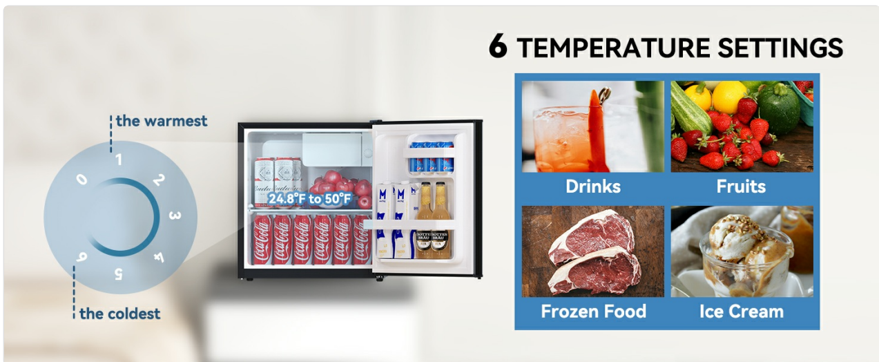
Image: Diagram of the 6 temperature settings and examples of suitable items for each.

The refrigerator features a 6-mode temperature control knob, allowing adjustment from 28.4°F to 50°F. Turn the thermostat knob to your desired setting. Setting '0' is off, and '6' is the coldest. Start with a medium setting (e.g., '3') and adjust as needed to achieve optimal cooling for your items.