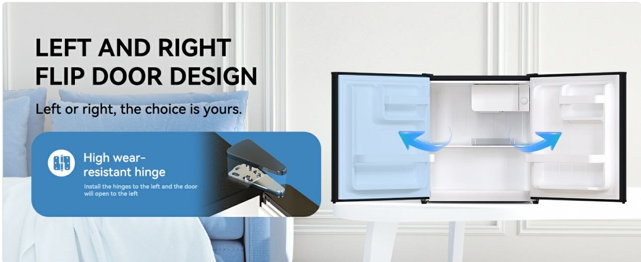
Image: Diagram illustrating the reversible door design.

The refrigerator features a reversible door, allowing you to set it to open from either the left or right side to suit your space. It also includes removable glass shelves for flexible storage and a detachable door seal for easy cleaning.