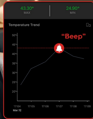
Image: A smartphone displaying a temperature trend graph within the BBQ GO app, illustrating historical temperature data.

Possiamo controllare i record visualizzando il grafico della temperatura, senza più preoccuparci di perdere dati.