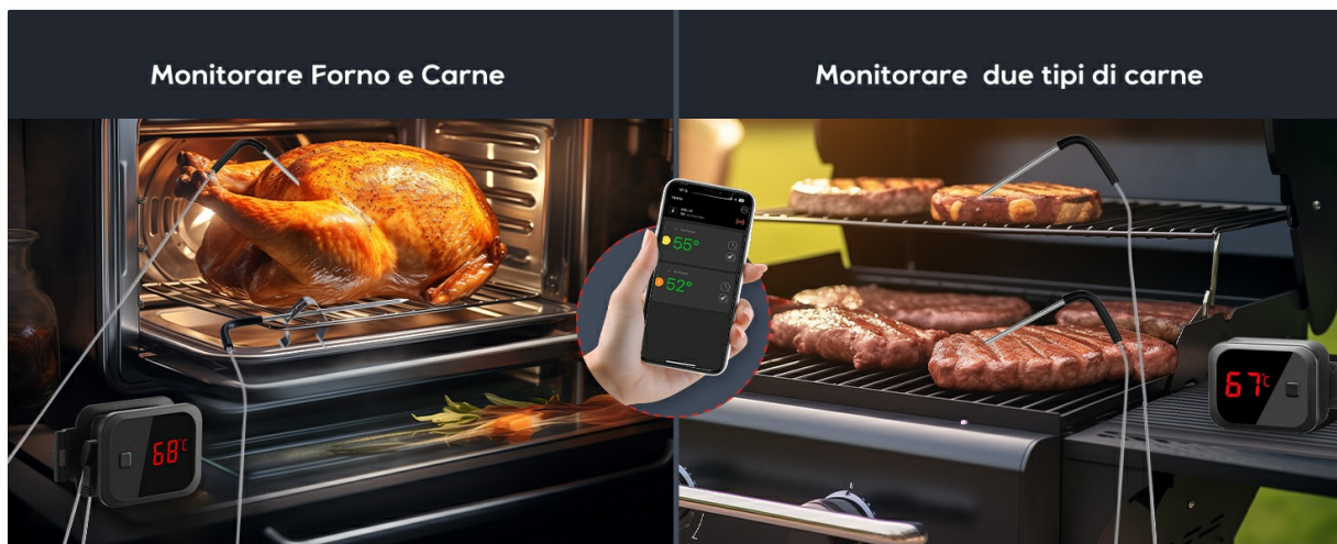
Image: The Inkbird IBT-2X thermometer in use, showing probes inserted into a chicken roasting in an oven and meat grilling on a barbecue.