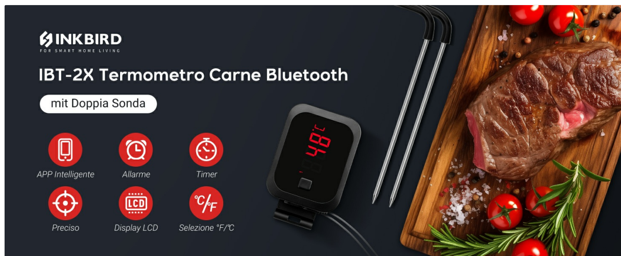
Image: The Inkbird IBT-2X main unit, two temperature probes, and a probe clip, illustrating the typical package contents.