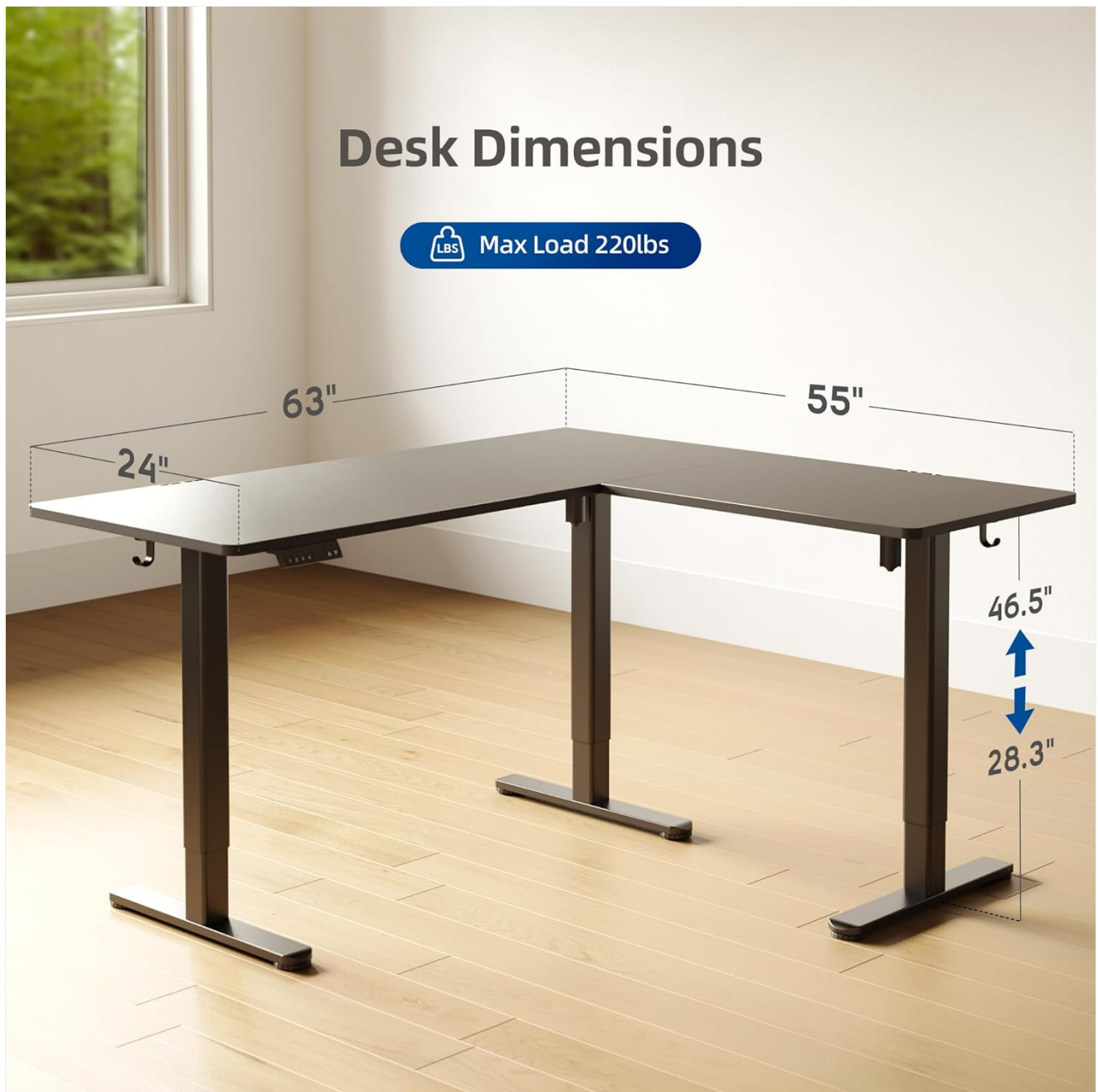
Figure 4.2: Desk dimensions and maximum load capacity for assembly planning.