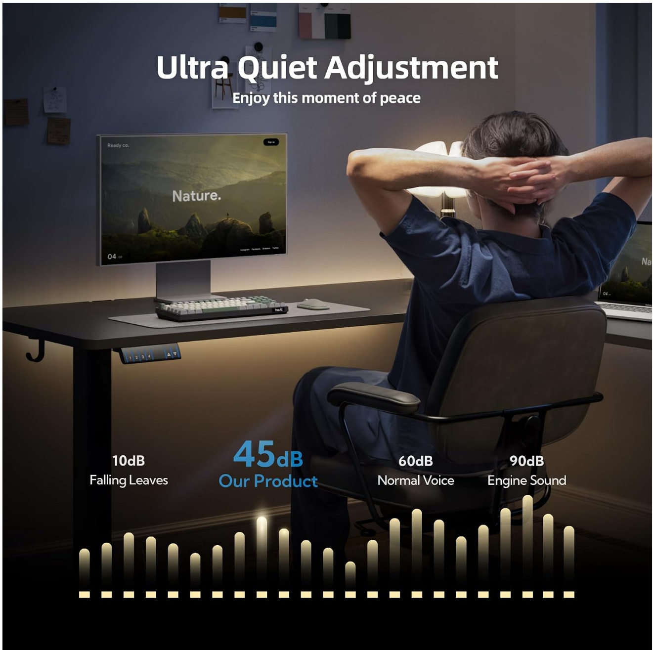
Figure 5.3: The desk operates at approximately 45dB, ensuring quiet height adjustments.