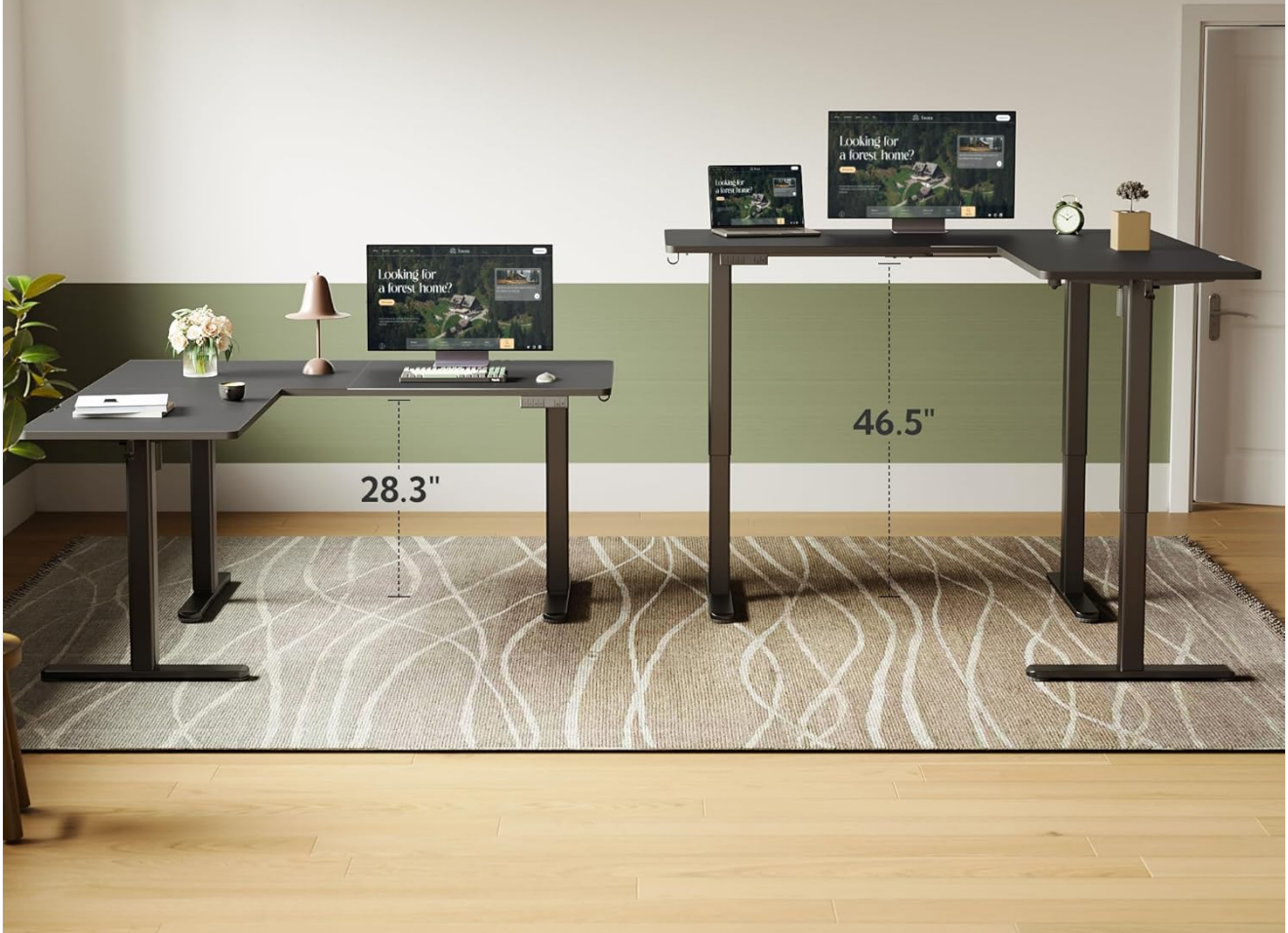
Figure 5.2: The desk offers a wide height range from 28.3 inches to 46.5 inches.