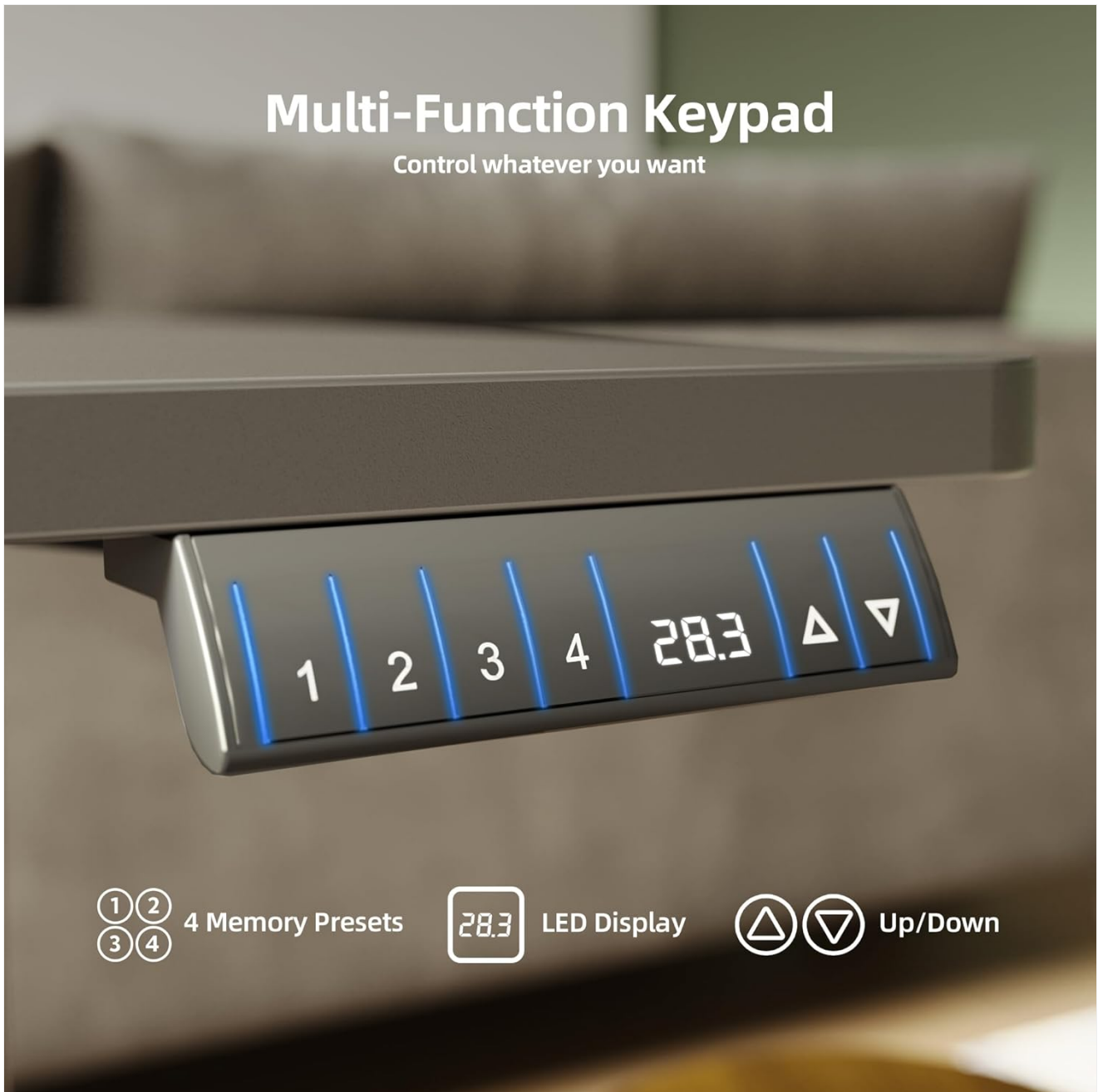
Figure 5.1: The multi-function keypad for height adjustment and memory presets.