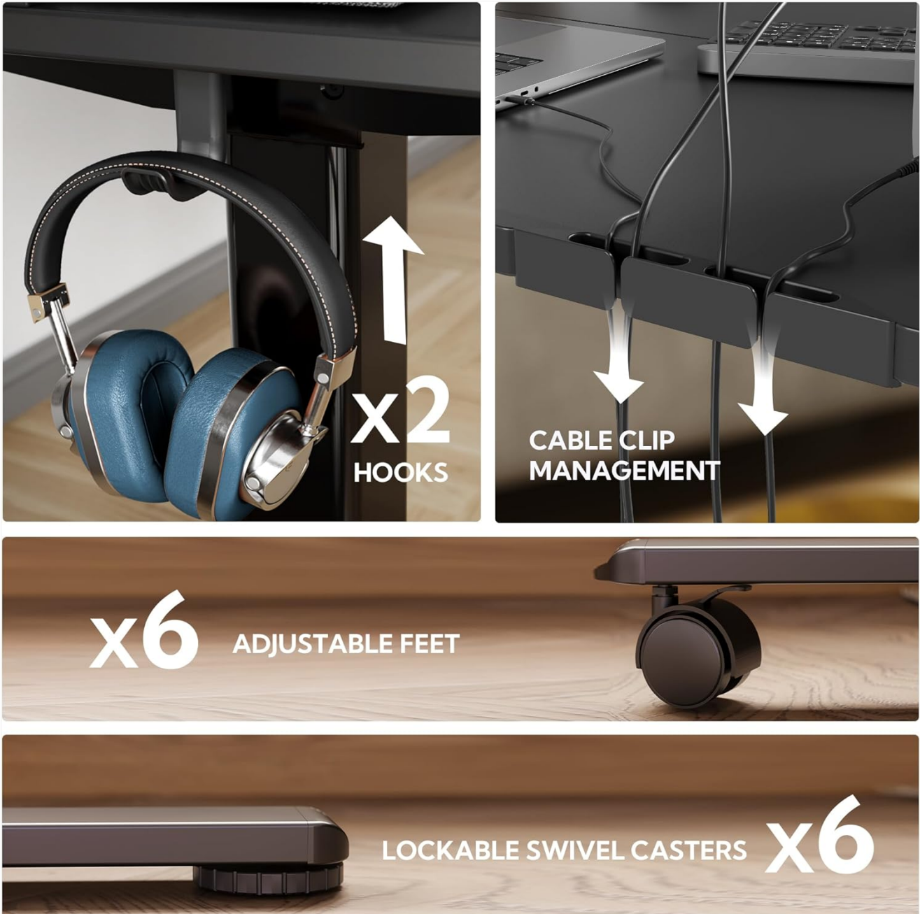
Figure 3.1: Included accessories such as headphone hooks, cable clips, adjustable feet, and optional casters.