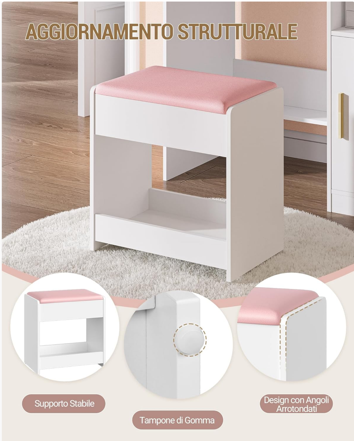
Image: Close-up views illustrating the stable support structure, integrated rubber buffers for floor protection, and the rounded corner design for safety and aesthetics.