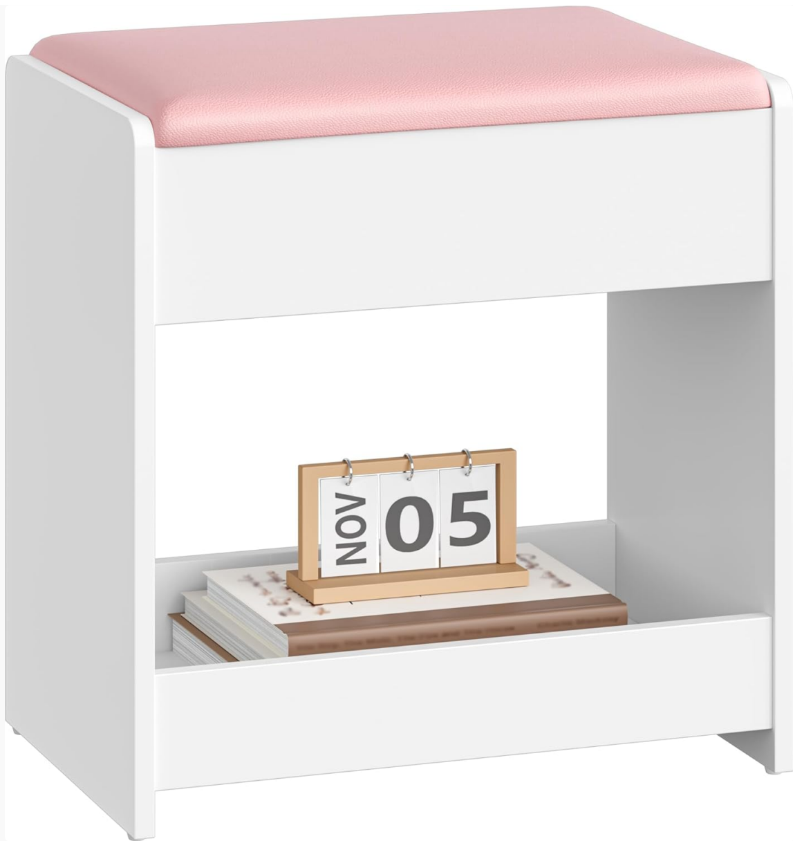
Image: A close-up view of the stool's integrated storage compartment, showing it being used to hold a calendar and books, highlighting its practical storage capabilities.