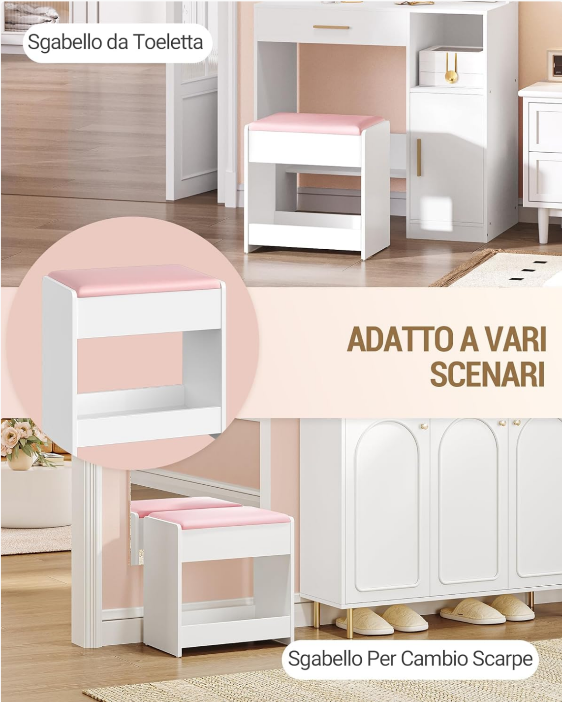
Image: The Hzueneri Makeup Vanity Stool is displayed in multiple scenarios, demonstrating its adaptability as a vanity stool and a shoe-changing bench in different home environments.