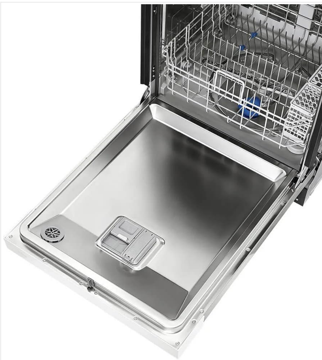
Figure 2: Interior bottom of the dishwasher tub, showing the filter assembly and detergent dispenser.