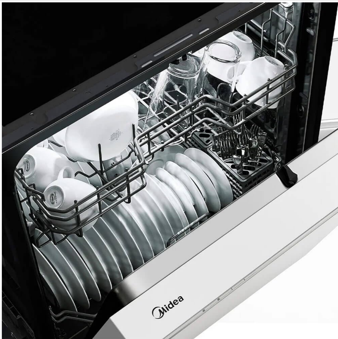
Figure 6: Dishwasher interior with dishes loaded.