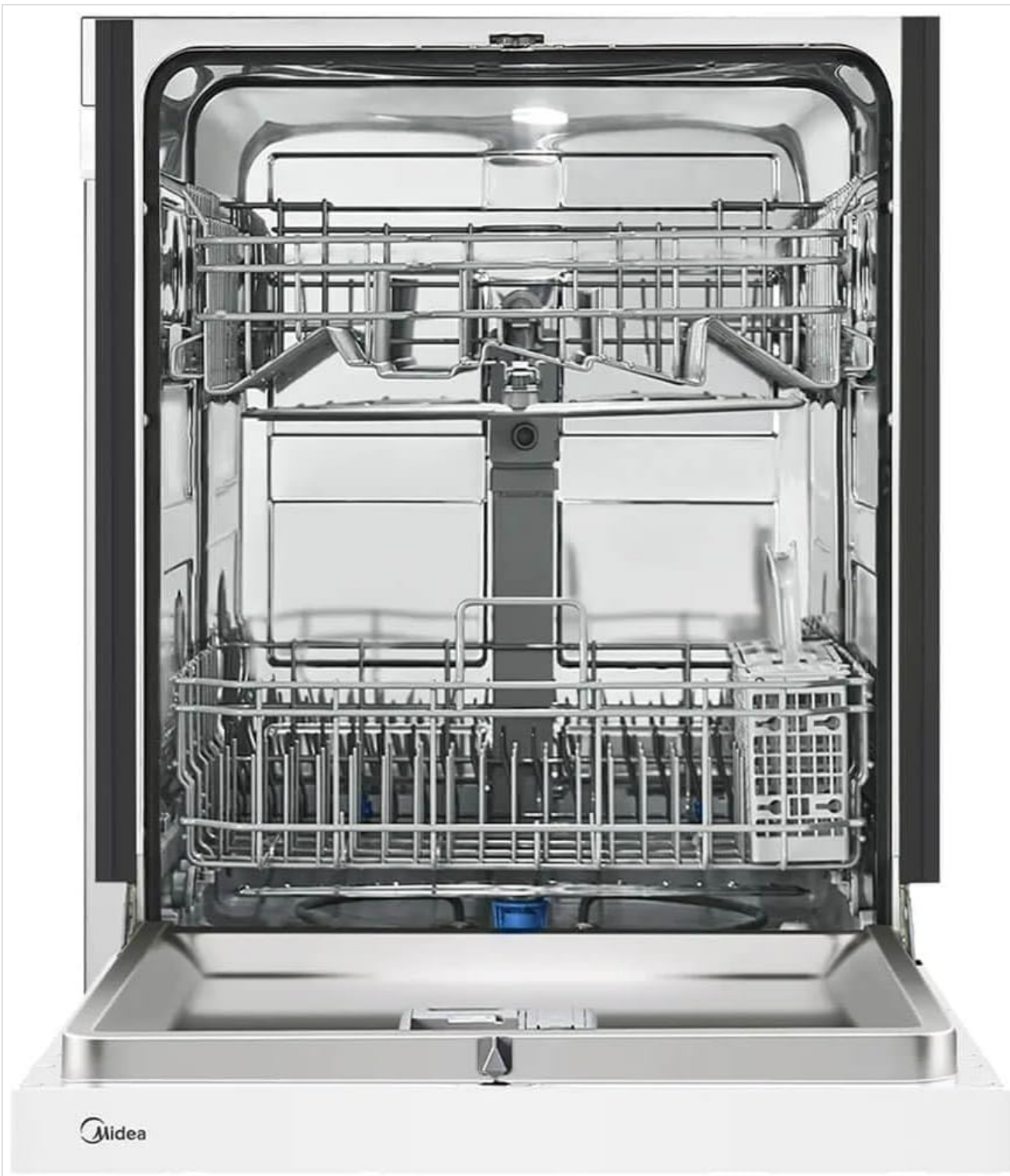
Figure 4: Dishwasher interior with empty racks.