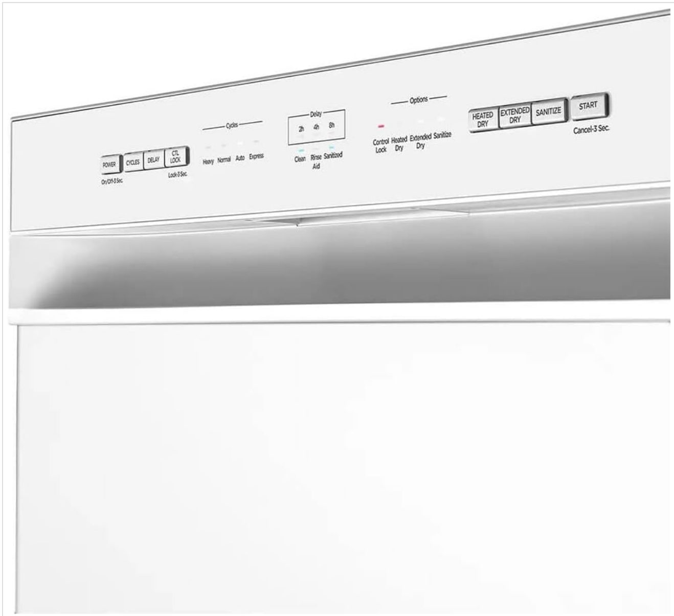
Figure 3: Dishwasher control panel with cycle and option buttons.

The front control panel allows selection of wash cycles and options.