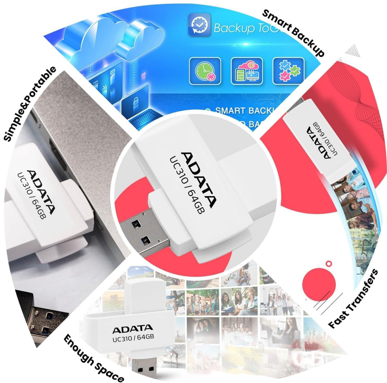
Figure 2.2: A-DATA UC310 64GB USB Flash Drive