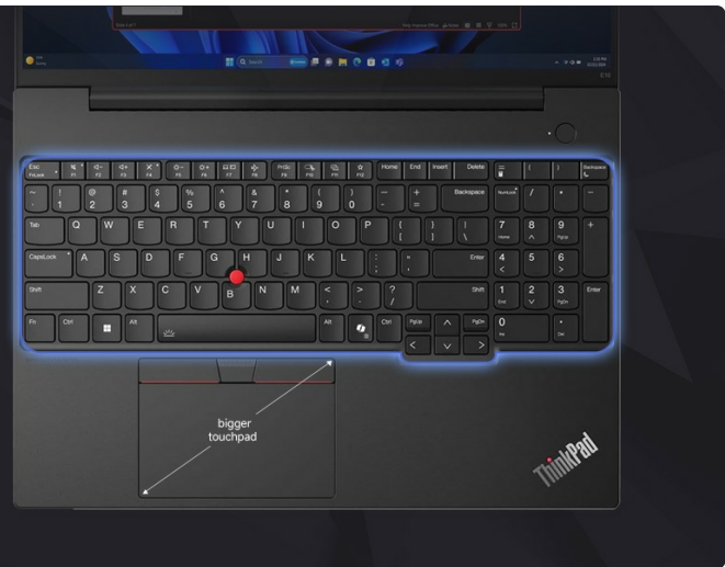
Figure 3.1: Keyboard and Touchpad Features

Features like the TrackPoint Quick Menu and Tap-to-Select make multitasking and navigation simple on the ample display. Typing is comfortable even in low light, thanks to the full-sized, keyboard. And the bigger touchpad enhances not only productivity, but the overall user experience. All with AI-based intelligent performance tuning.