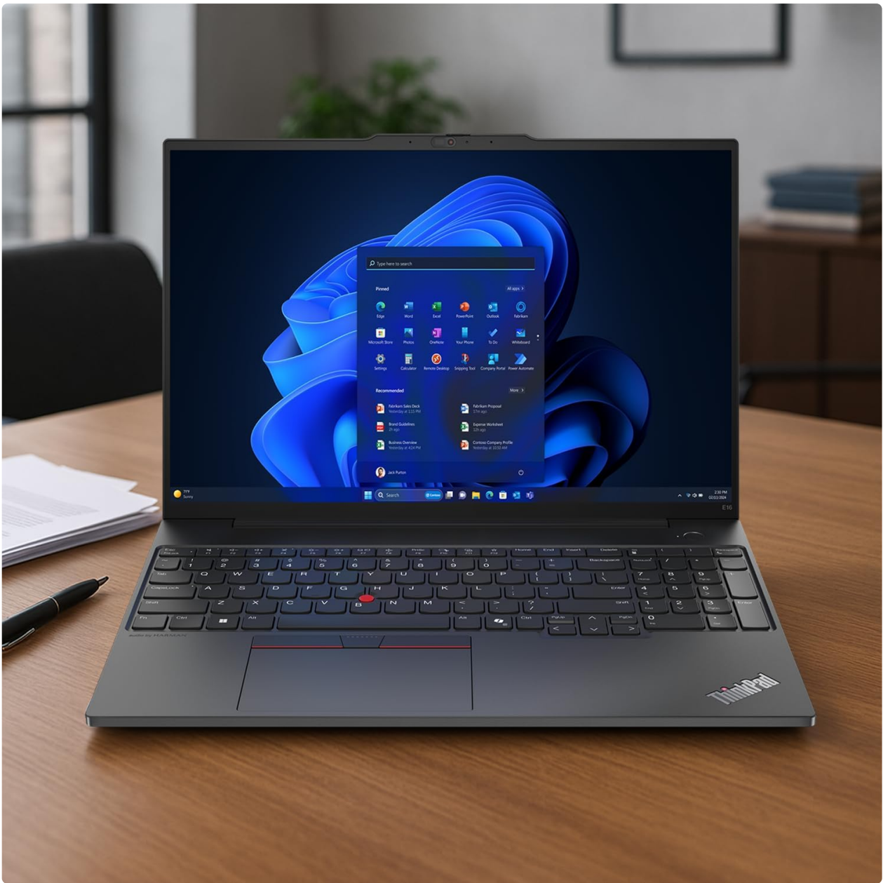
Figure 3.2: Display Specifications