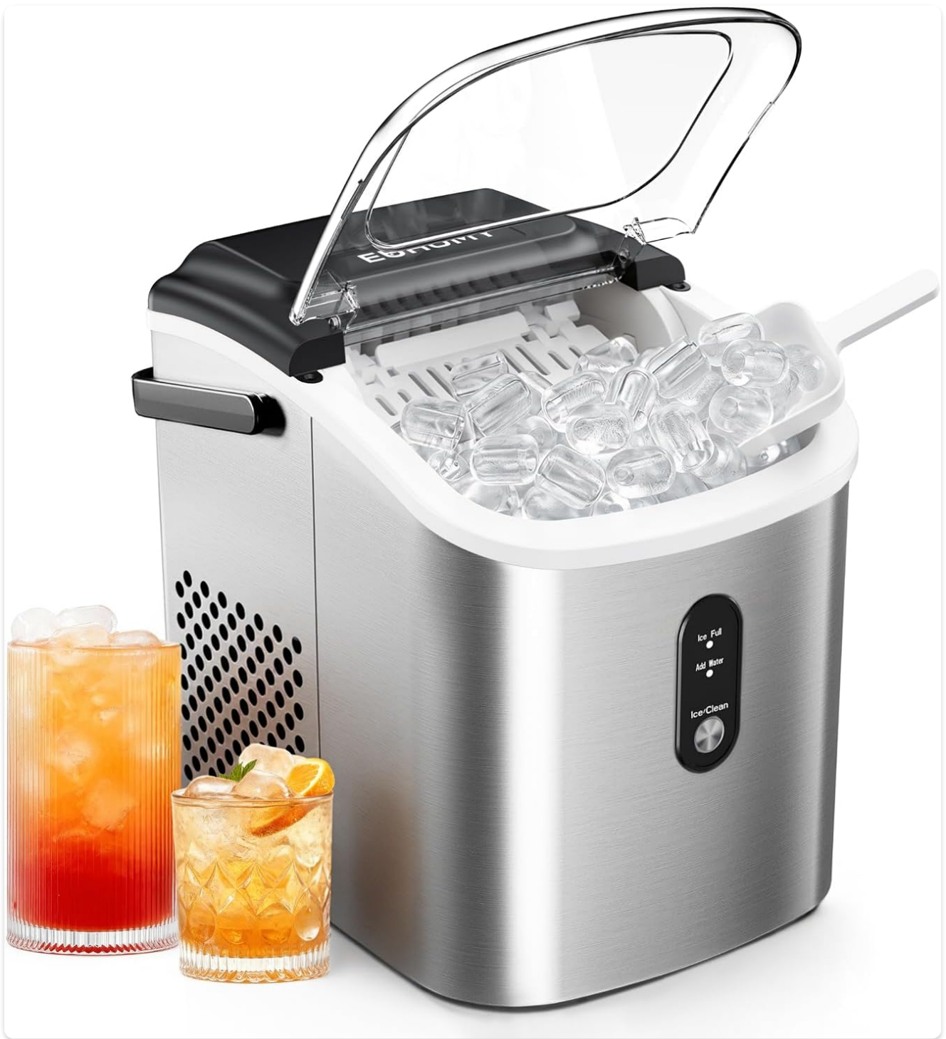
Image: The EUHOMY IM-18S Portable Ice Maker, a compact and efficient appliance for home, kitchen, camping, or RV use.