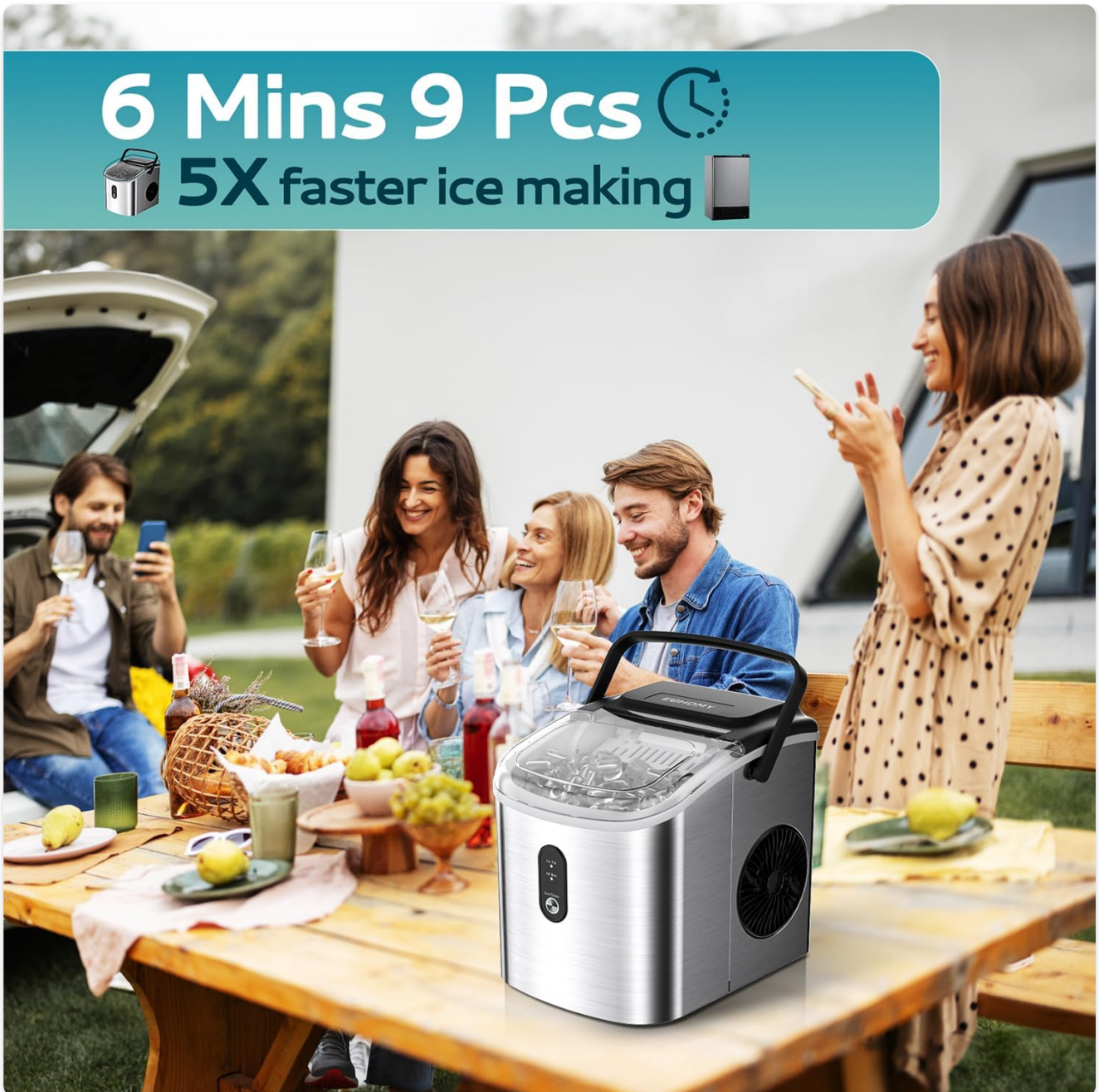
Image: The portable EUHOMY IM-18S ice maker shown in an outdoor environment, demonstrating its versatility for various locations.