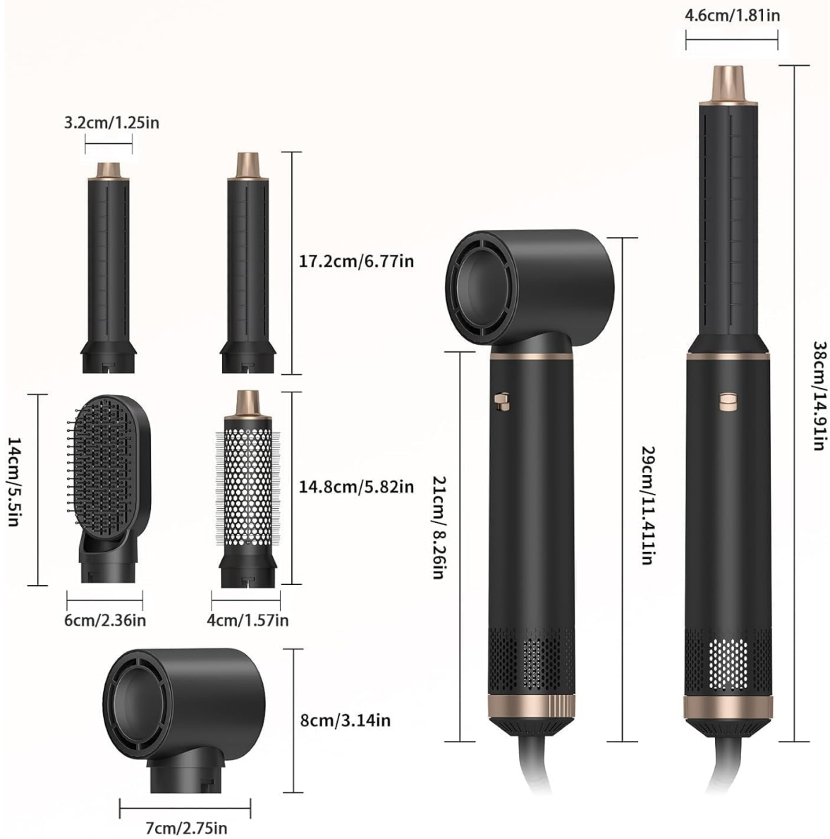
Image: Detailed parameter table showing the dimensions of the main unit and each attachment.