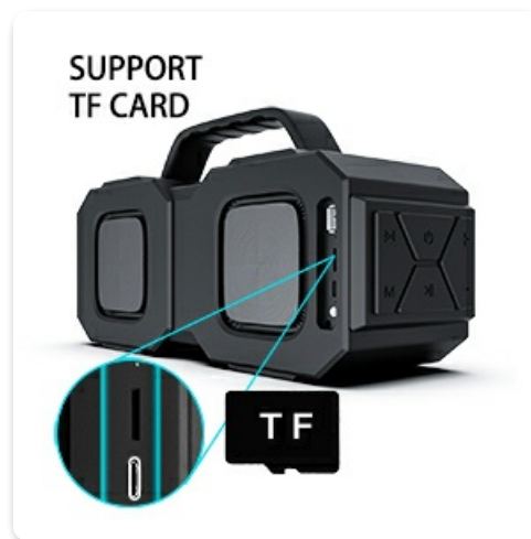
Image 4.1: Detailed view of the TF card slot and USB-A output port.