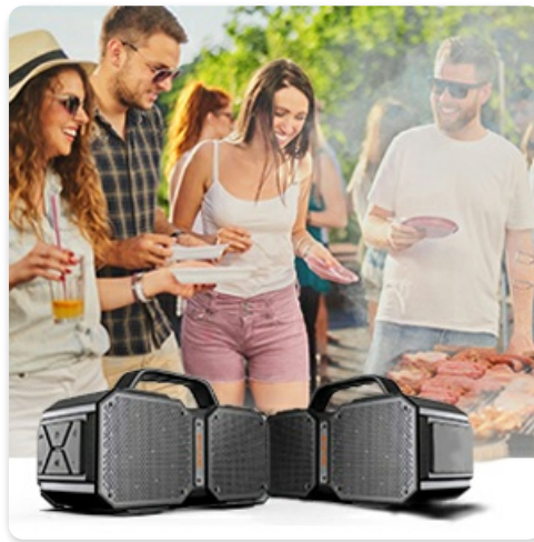
Image 6.1: The BUGANI M83 speaker supports different EQ modes for indoor and outdoor use.

The speaker features different EQ modes for optimized sound in various environments. Press the Mode (M) Button briefly to cycle through available EQ settings (e.g., Indoor, Outdoor).