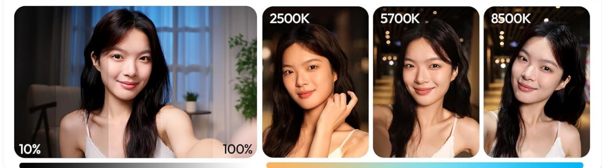
Image: The ULANZI LM23 Magnetic Selfie Light showcasing its adjustable brightness and color temperature settings, from warm to cool light.