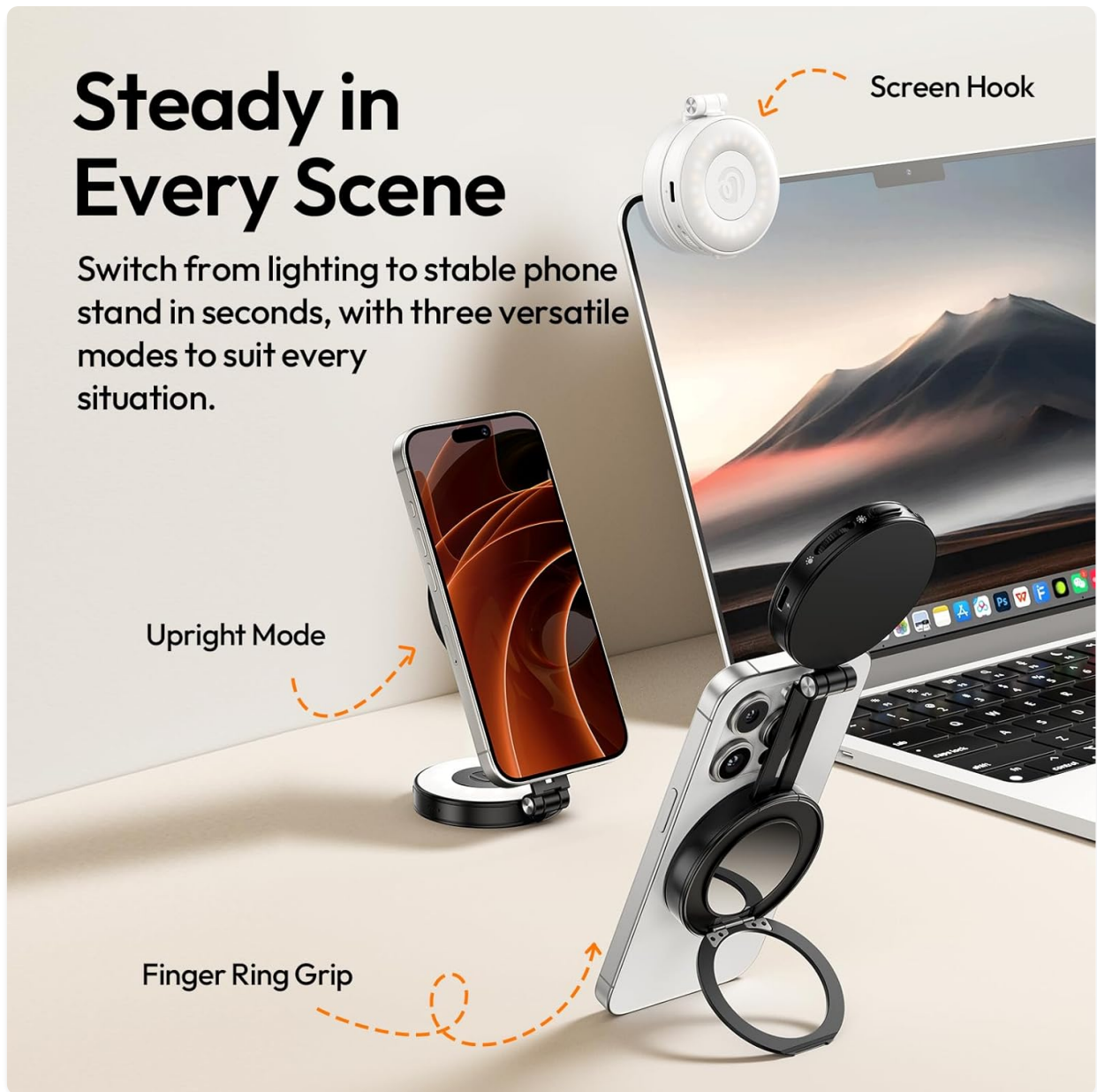
Image: The ULANZI LM23 Magnetic Selfie Light demonstrating its use as a phone stand in upright mode and attached to a laptop screen via its screen hook.

Switch from lighting to stable phone stand in seconds, with three versatile modes to suit every situation.