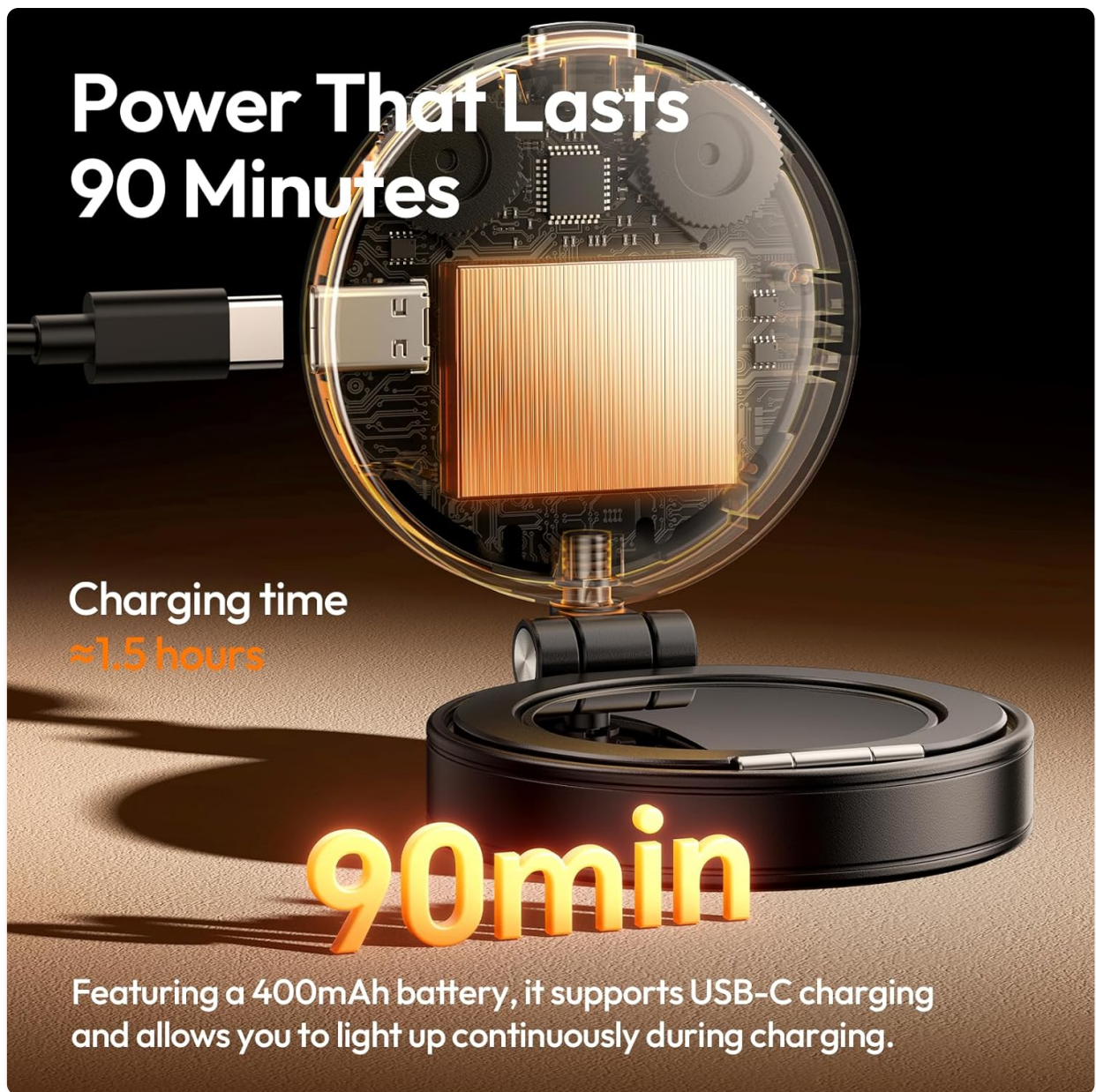
Image: The ULANZI LM23 Magnetic Selfie Light connected to a USB-C charging cable, highlighting its charging capability and battery life.