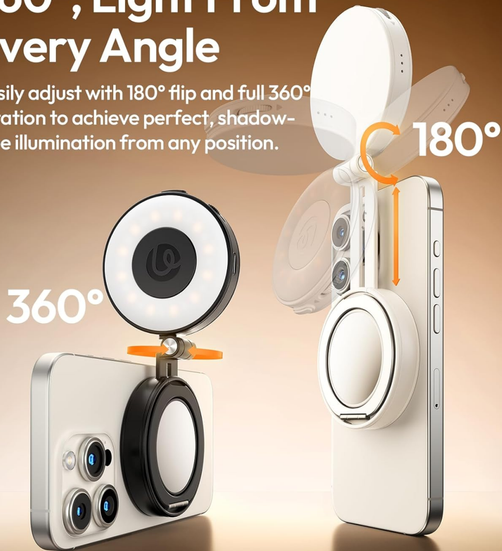
Image: The ULANZI LM23 Magnetic Selfie Light attached to a phone, illustrating its ability to rotate 360 degrees and flip 180 degrees for versatile lighting angles.

Easily adjust with 180° flip and full 360° rotation to achieve perfect, shadow-free illumination from any position.