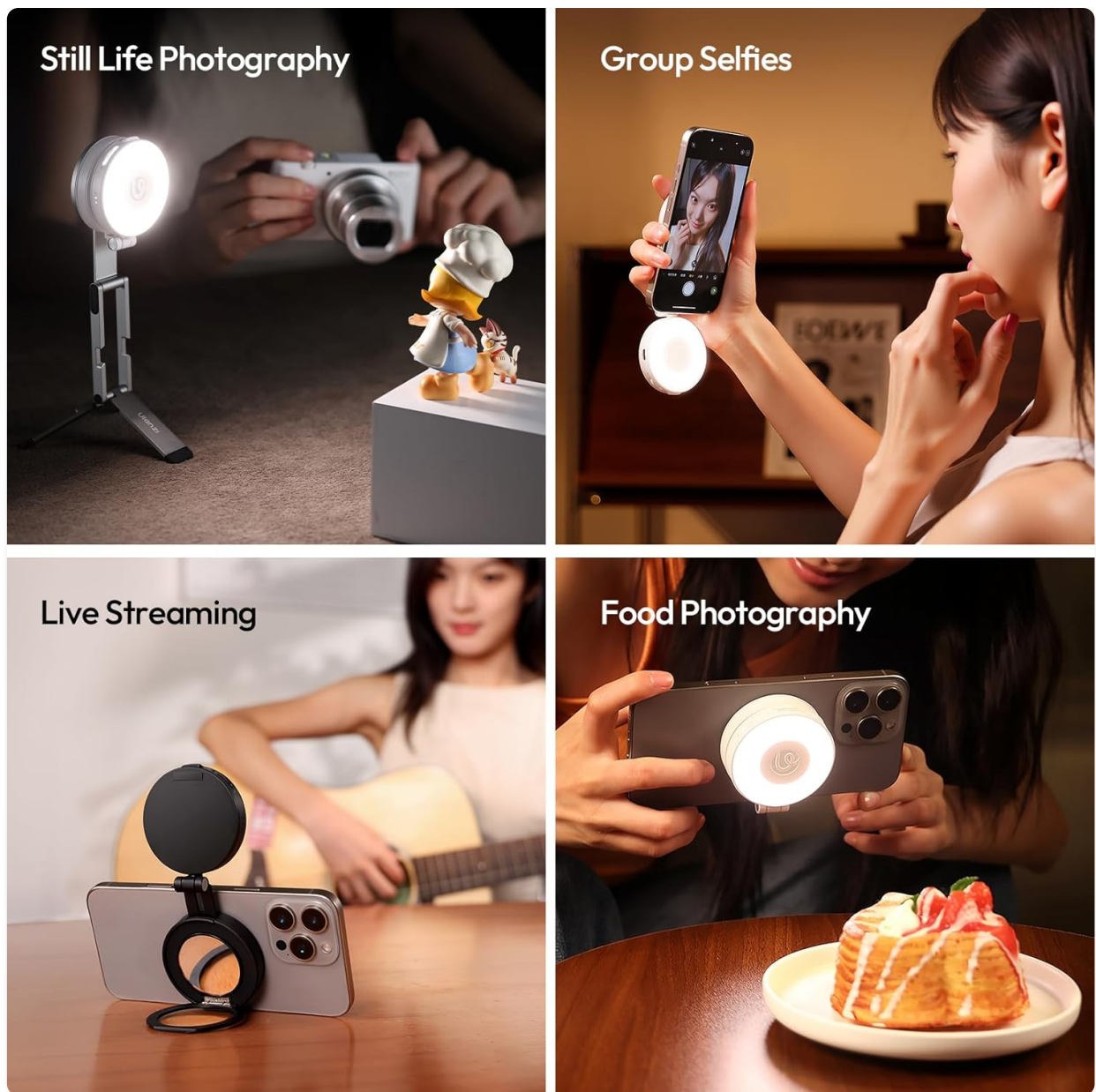
Image: A collage showing the ULANZI LM23 Magnetic Selfie Light being used in different settings: for still life photography, group selfies, live streaming, and food photography.