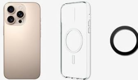
Image: The ULANZI LM23 Magnetic Selfie Light magnetically attaching to the back of an iPhone, illustrating the ease of connection.

*For smartphones featuring MagSafe or with MagSafe phone cases, it also comes with a magnetic ring sticker for option.