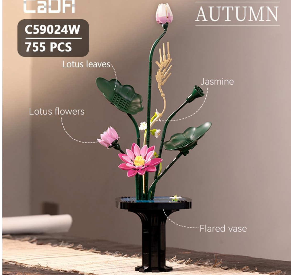
Image 1: The CaDA C59024W botanical flower arrangement, highlighting key components such as lotus leaves, lotus flowers, jasmine, and the flared vase base.