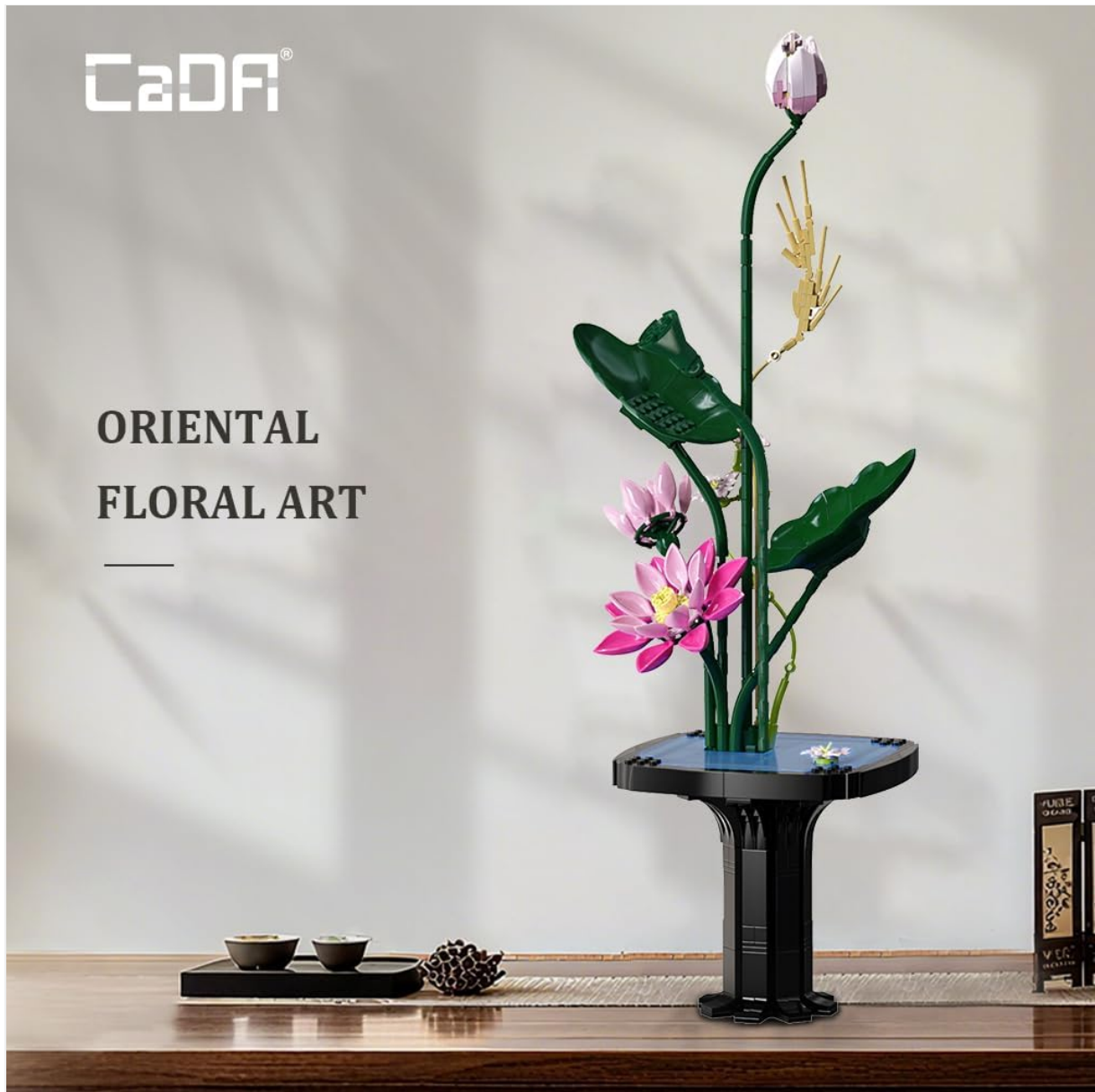
Image 2: The assembled botanical flower model, showcasing its aesthetic as an 'Oriental Floral Art' piece.

The finished product measures approximately 24 cm (width) x 17.6 cm (depth) x 61.6 cm (height), making it a suitable size for various display locations. The design aims to blend creative building with refined home decor aesthetics.