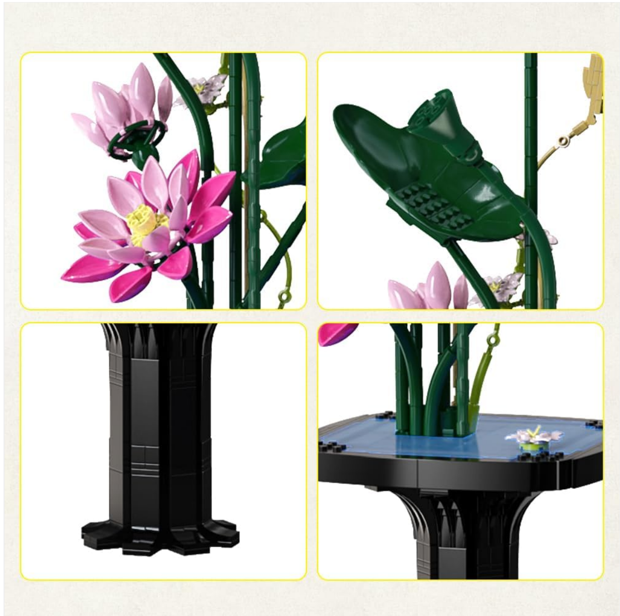
Image 4: Detailed views of individual components, including the lotus flower, lotus leaf, vase base, and water effect pieces, illustrating the intricate design.

Pay close attention to the orientation and connection points of each piece. Some sections may require gentle but firm pressure to ensure secure connections.