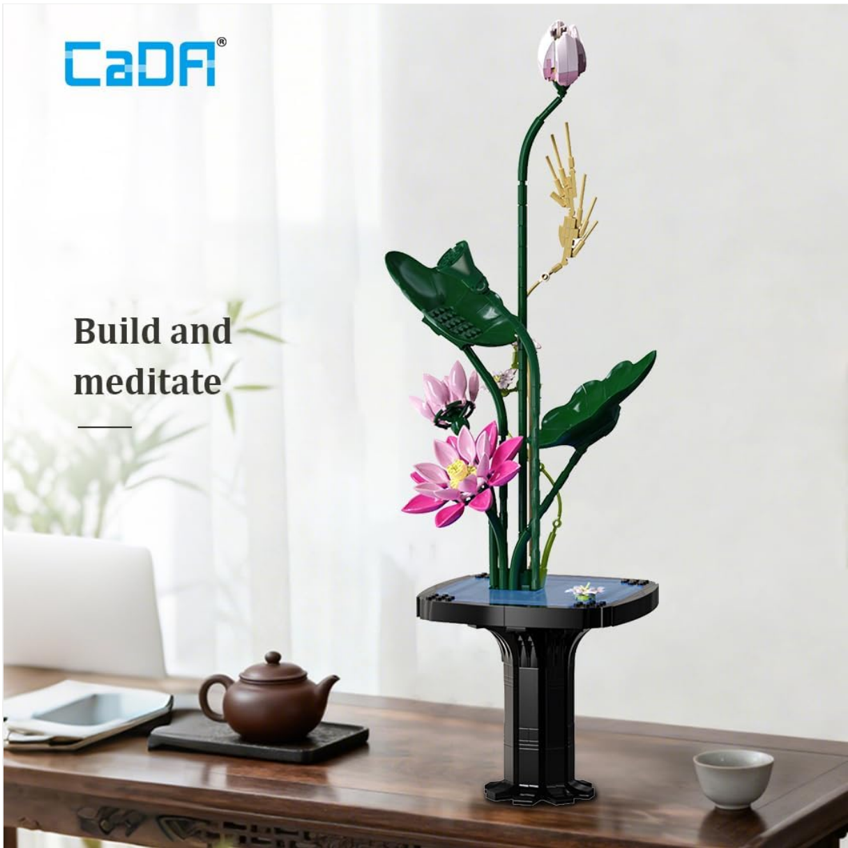
Image 5: The assembled botanical flower model placed in a serene setting, suggesting a meditative building experience.