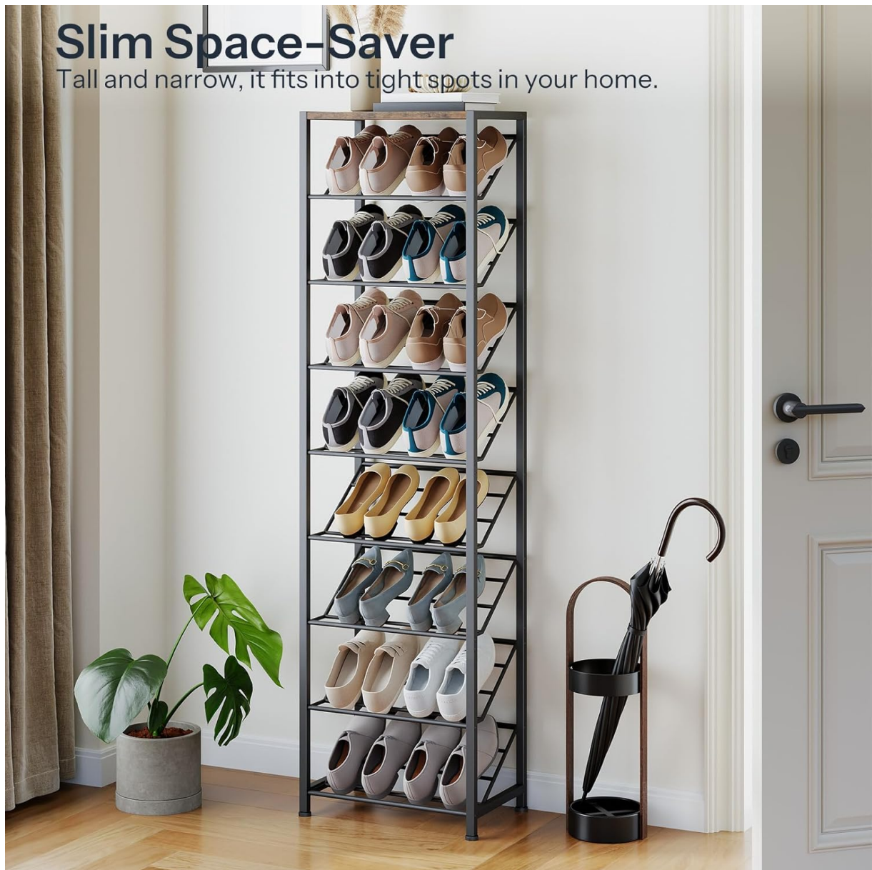
Image: The HOOBRO 9-Tier Narrow Shoe Rack positioned in a narrow hallway, demonstrating its slim, space-saving design.

Tall and narrow, it fits into tight spots in your home.