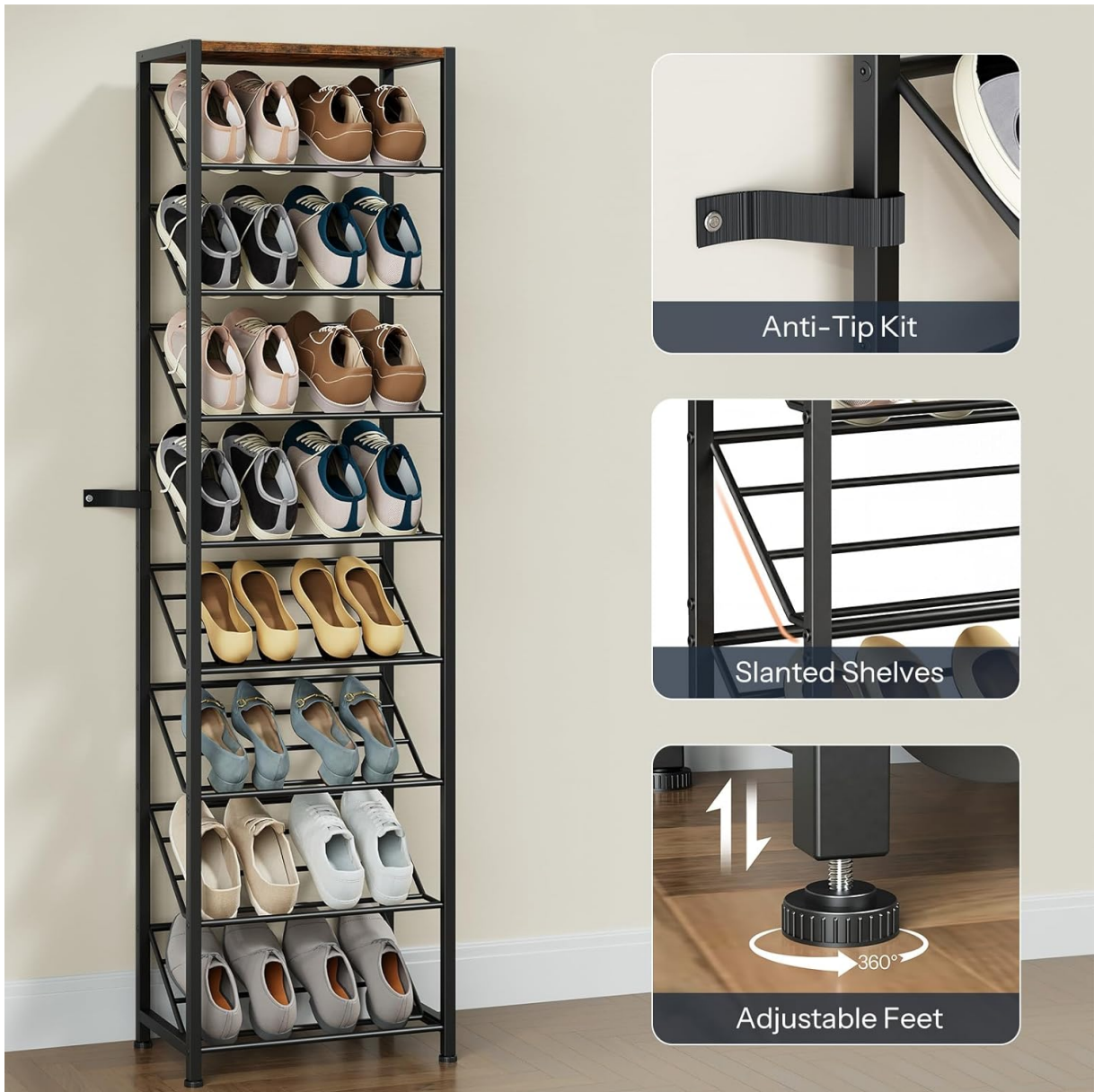
Image: Detailed view highlighting the anti-tip kit for wall attachment, the slanted design of the shelves, and the adjustable leveling feet.