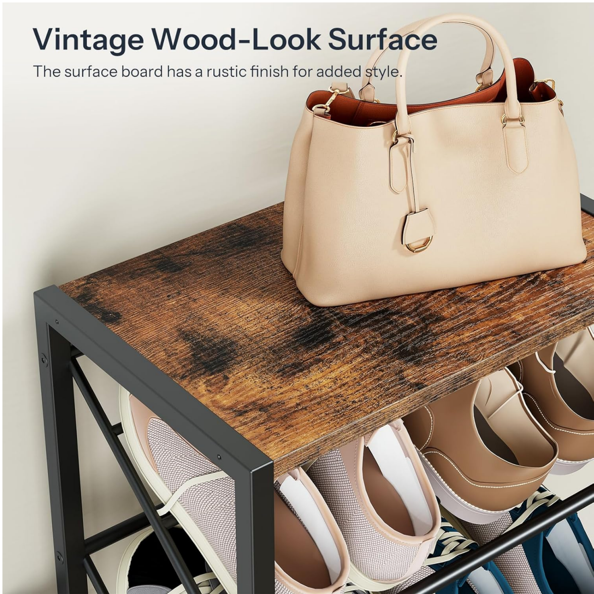
Image: A close-up of the rustic brown top shelf, highlighting its textured, wood-look laminated finish.

The surface board has a rustic finish for added style.