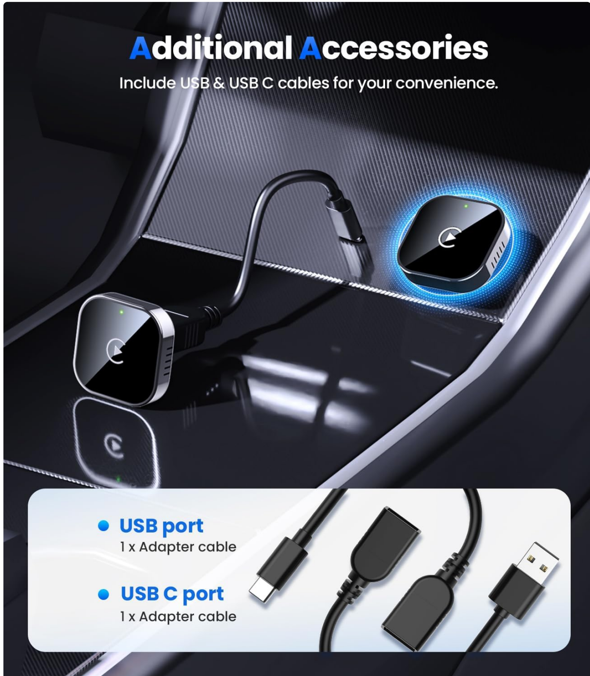
Image: Plugging the Teeran Wireless CarPlay Adapter into the car's USB port.