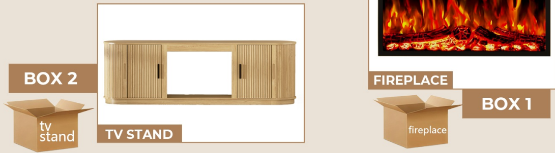
Figure 1: Product delivered in two packages.

Comes with TWO PACKAGES with TWO PRACKINGS, may NOT be delivered at the same time, please be patient!