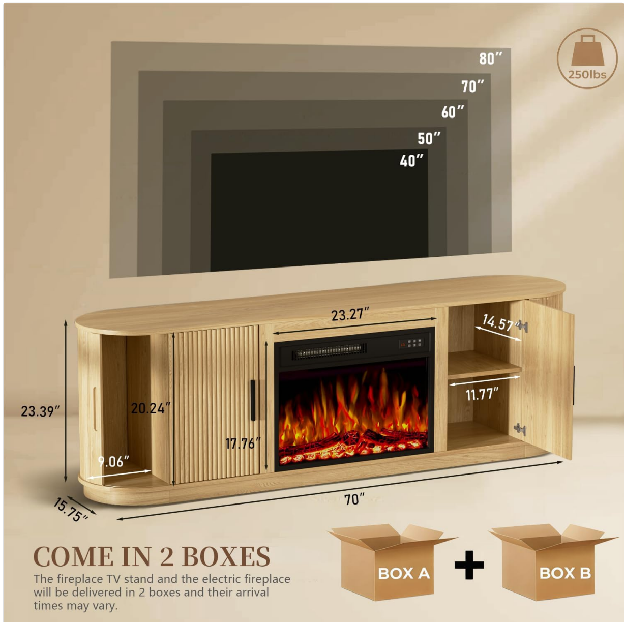
Figure 4: Product dimensions and TV compatibility.