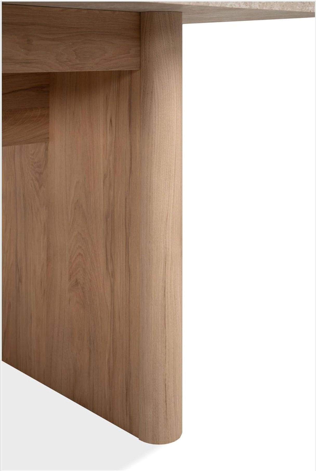
Image: Close-up view of the table's robust wooden leg, showcasing the Jackson Hickory finish and rounded design. This detail highlights the quality of the table's construction.