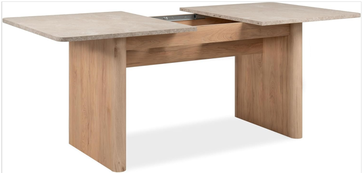
Image: The Finori Sai 80A table in a partially extended state, revealing the internal sliding mechanism and the space where the 40 cm extension leaf is inserted.