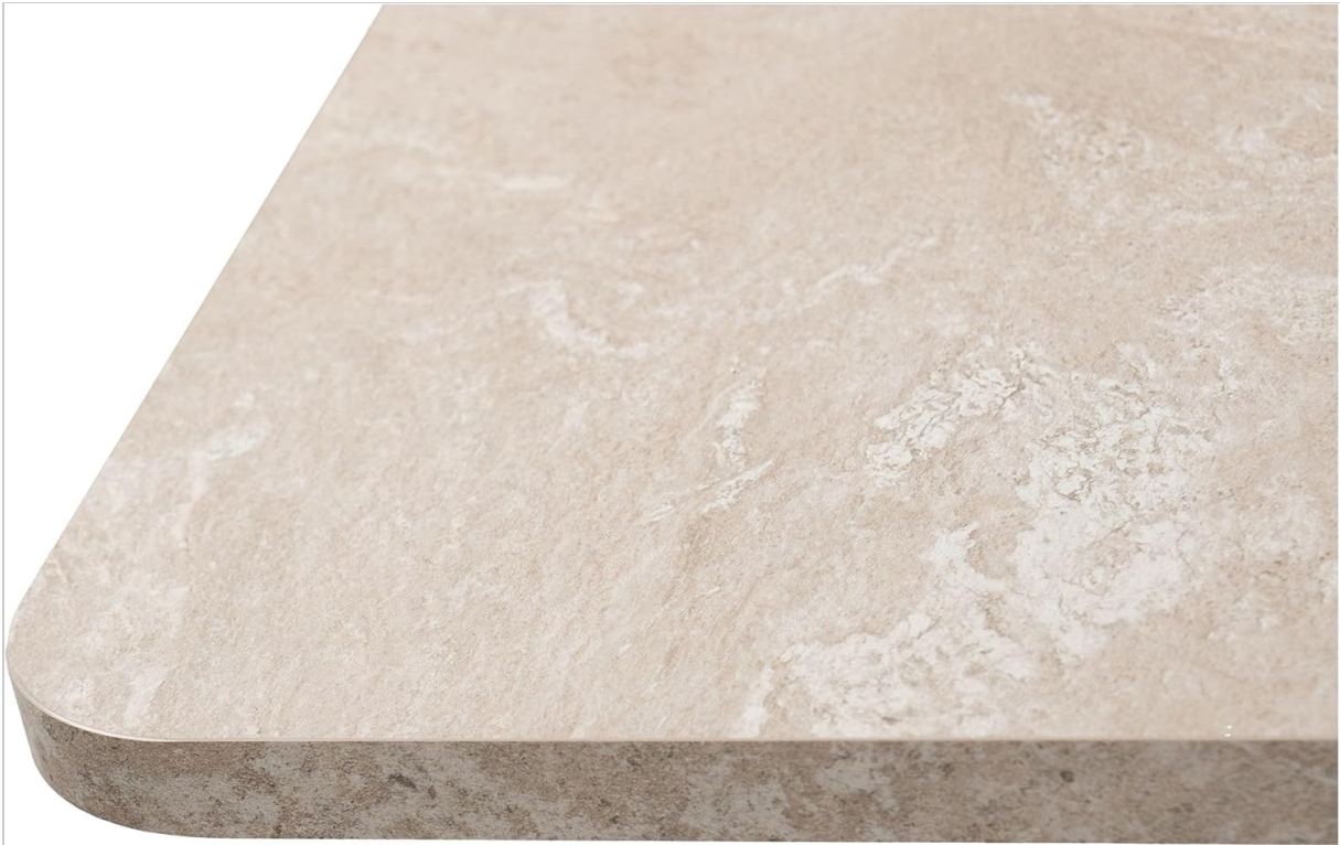
Image: Detailed view of the stoneware decor tabletop, highlighting its textured surface and durable finish, which is easy to clean with a damp cloth.