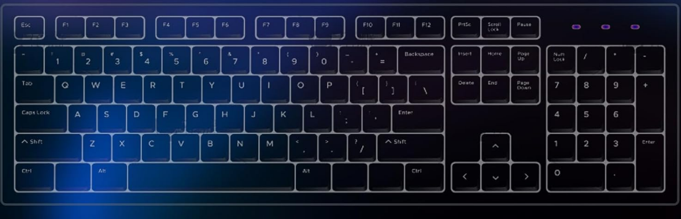
Image 4.2: A visual comparison demonstrating the space-saving benefits of the 96% compact keyboard layout while retaining a number pad.