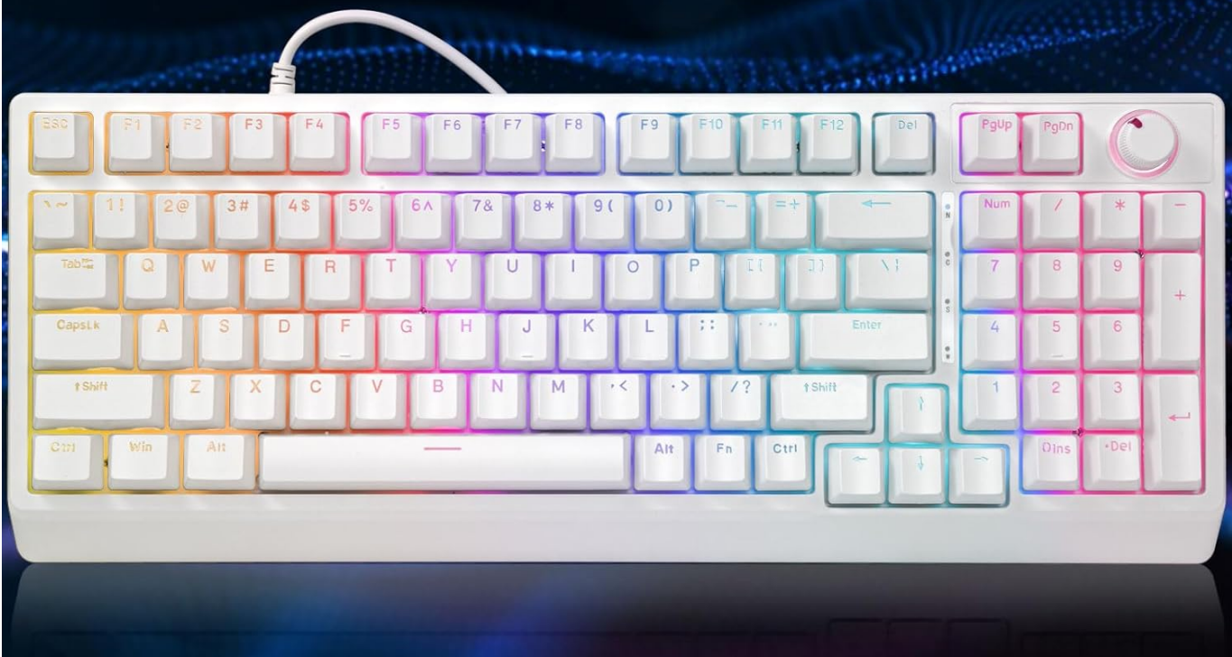
Image 3.1: Visual guide for controlling the 17 LED backlight modes, speed, and brightness using FN key combinations.