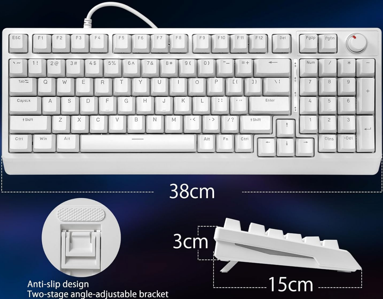
Image 2.2: The ergonomic design of the HUO JI K-700 keyboard, showing its two-stage adjustable foot support for customized typing angles.

Provides more stable and faster transmission speeds when gaming, enjoying the ultimate gaming experience.