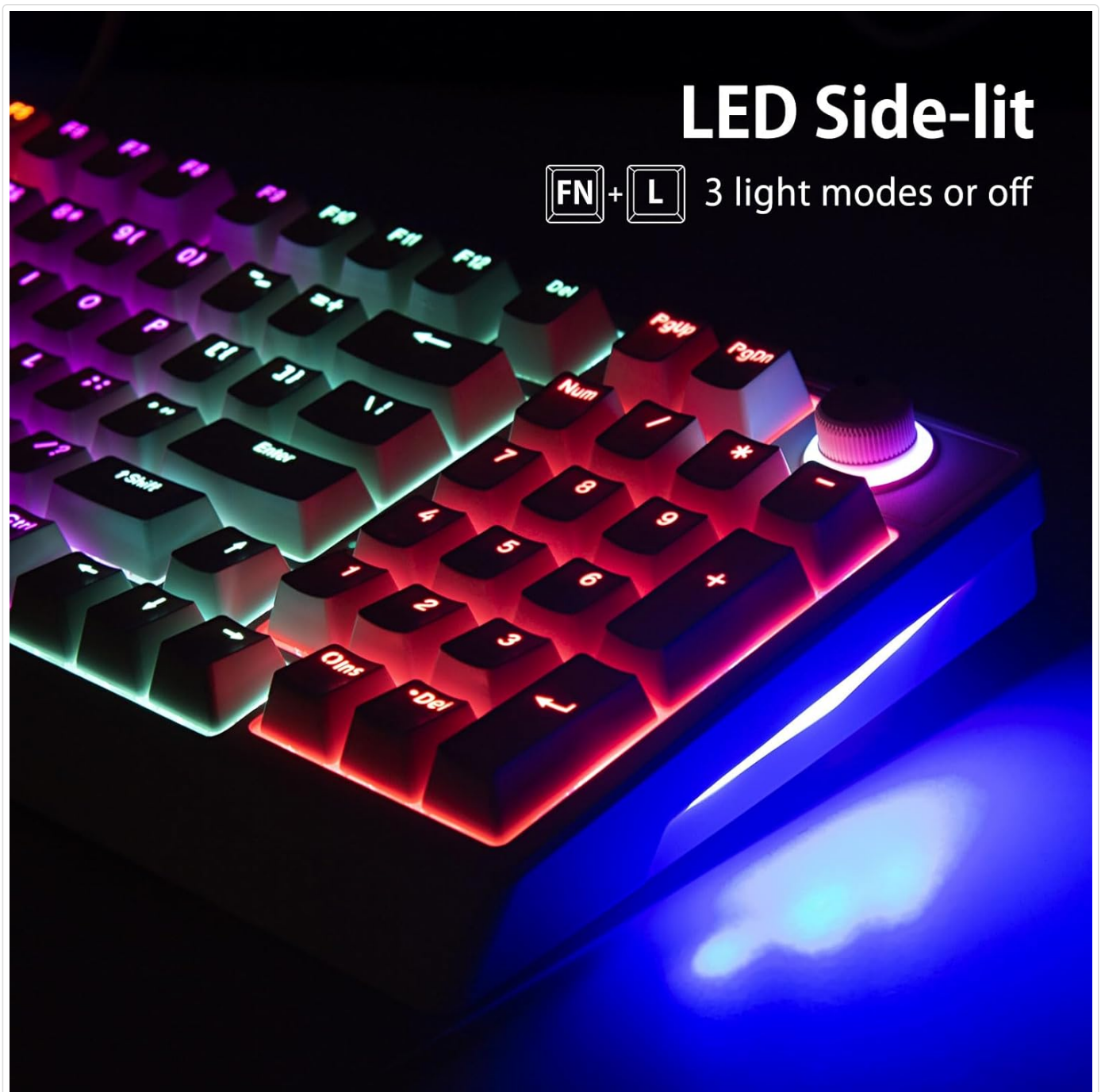
Image 3.2: Close-up view of the LED side-lit feature on the HUO JI K-700 keyboard, showing the FN + L shortcut for control.