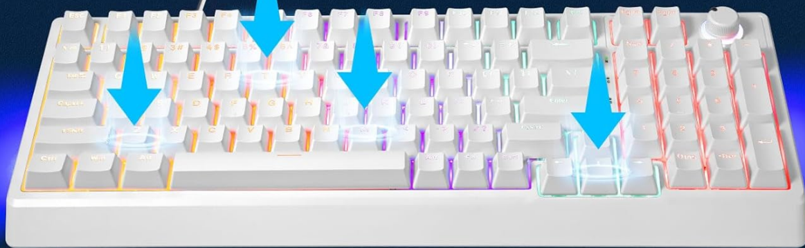
Image 3.4: Visual representation of the 26-key anti-ghosting feature and key combinations for Windows lock, multimedia, and WASD/arrow key interchange.

26 Keys: Z, C, F, Shift-L, Ctrl-F, Space, A, TAP, S, D, W, E, Q, B, V, R, T, X, G, Caps lock, ↑, ↓, ←, →, M, Alt-L