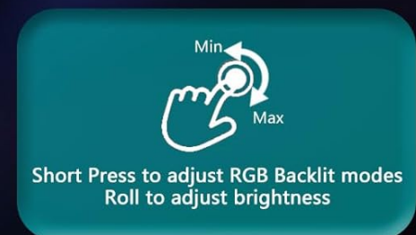
Image 3.3: Diagram illustrating the functions of the multi-function knob for volume control and switching to backlight adjustment modes.