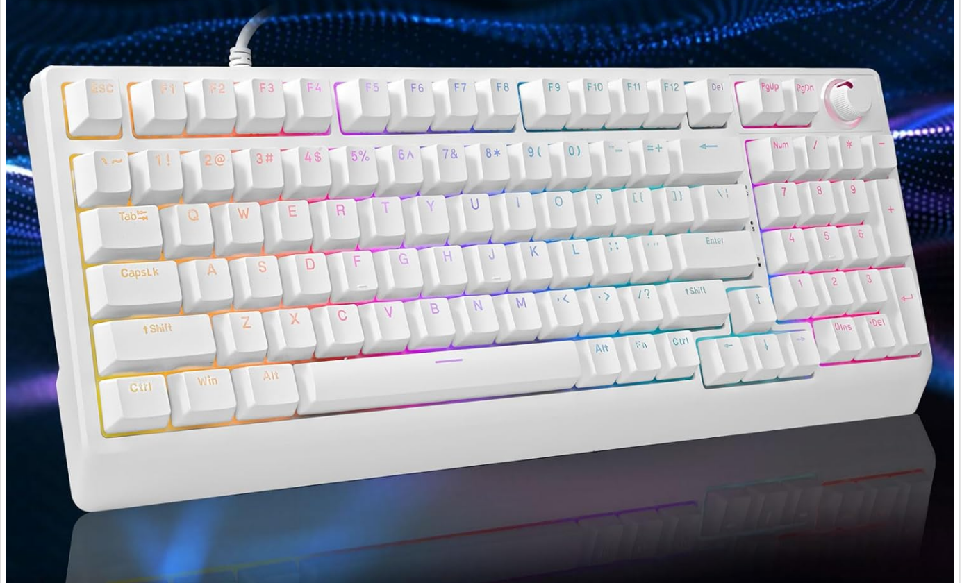
Image 1.1: Overview of the HUO JI K-700 Wired Mechanical Gaming Keyboard, showcasing its linear red switches, LED backlighting, volume knob, multimedia keys, anti-ghosting, double-shot keycaps, plug-and-play functionality, and 96% layout.