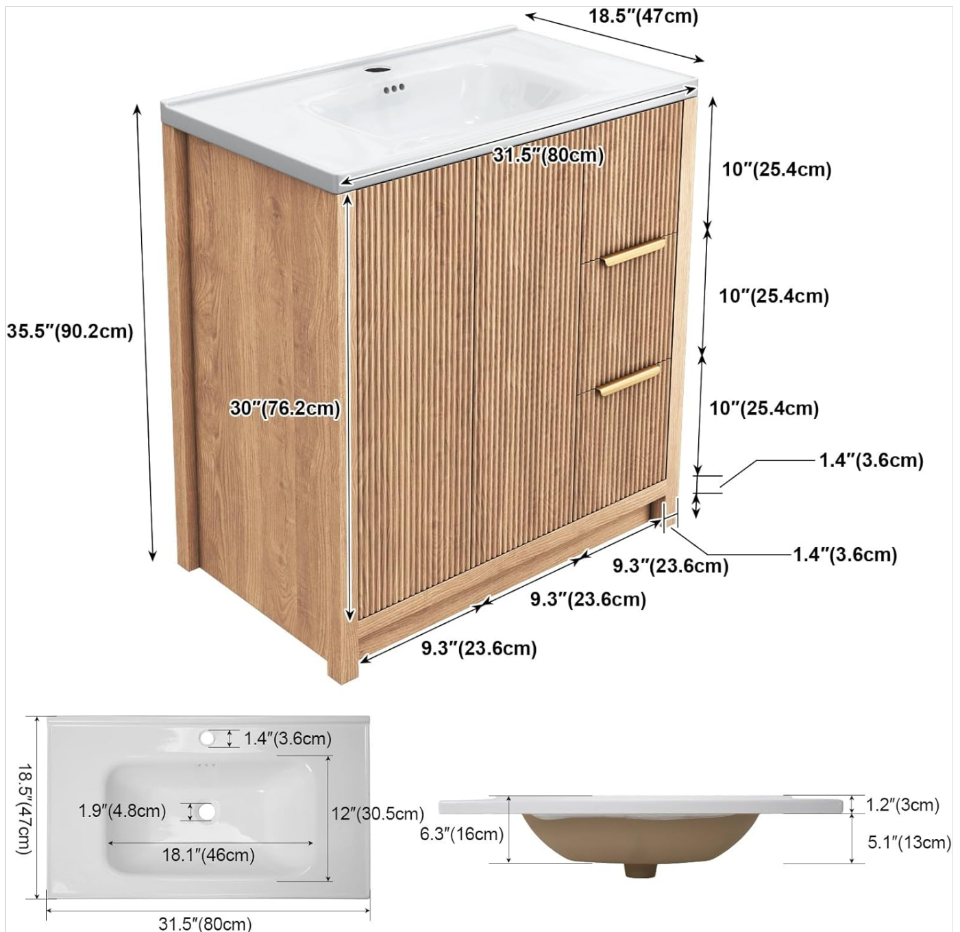
Figure 2: Product dimensions for planning installation.