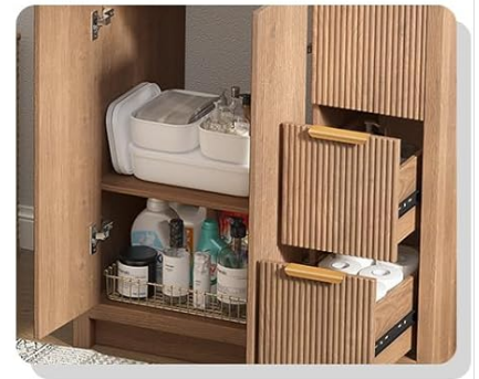
Large storage space