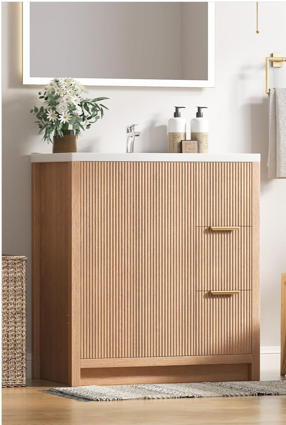
Figure 4: Push-to-open mechanism and smooth sink surface.