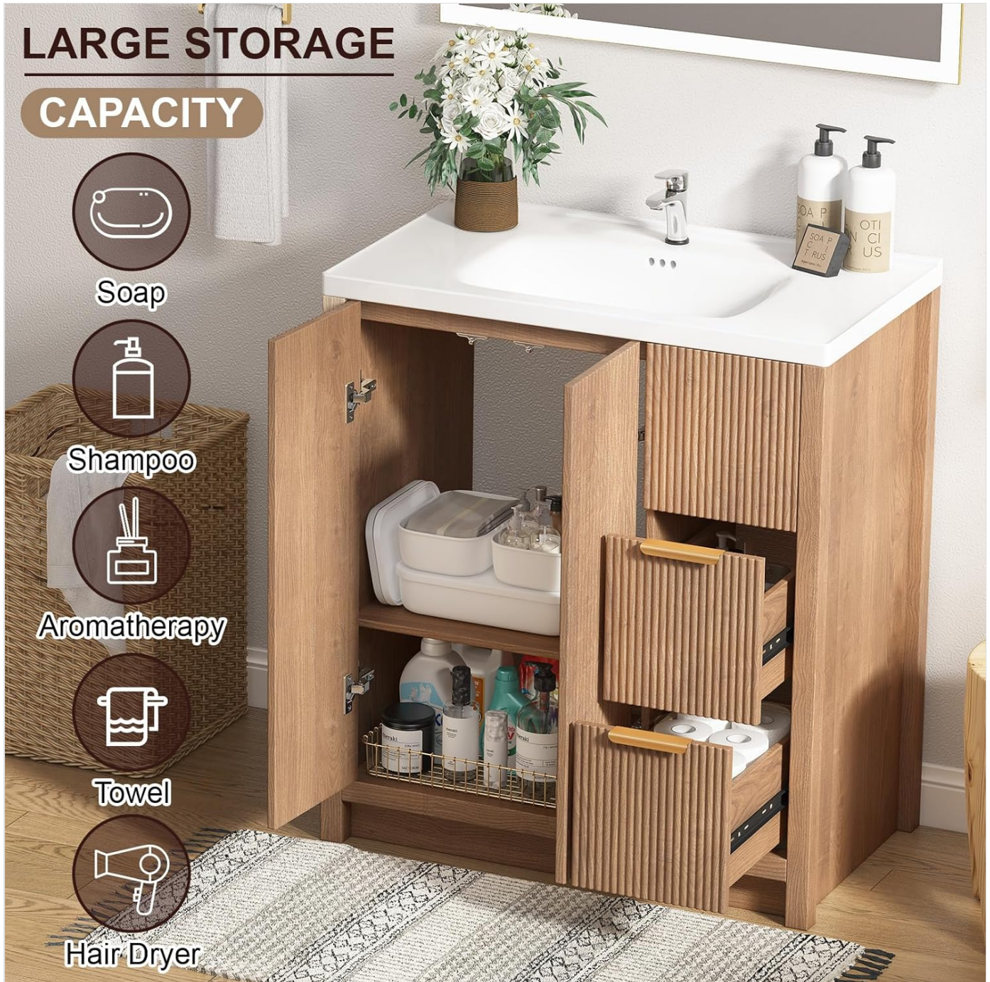
Figure 3: The vanity offers spacious and organized storage for bathroom essentials.