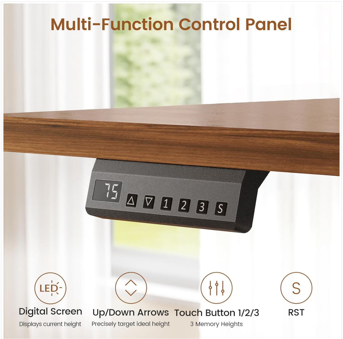
Image: Close-up of the multi-function control panel with an LED screen displaying current height, up/down arrows for precise adjustment, three memory height buttons (1, 2, 3), and an RST button for reset.

panel located on the underside of the desktop to adjust the height.