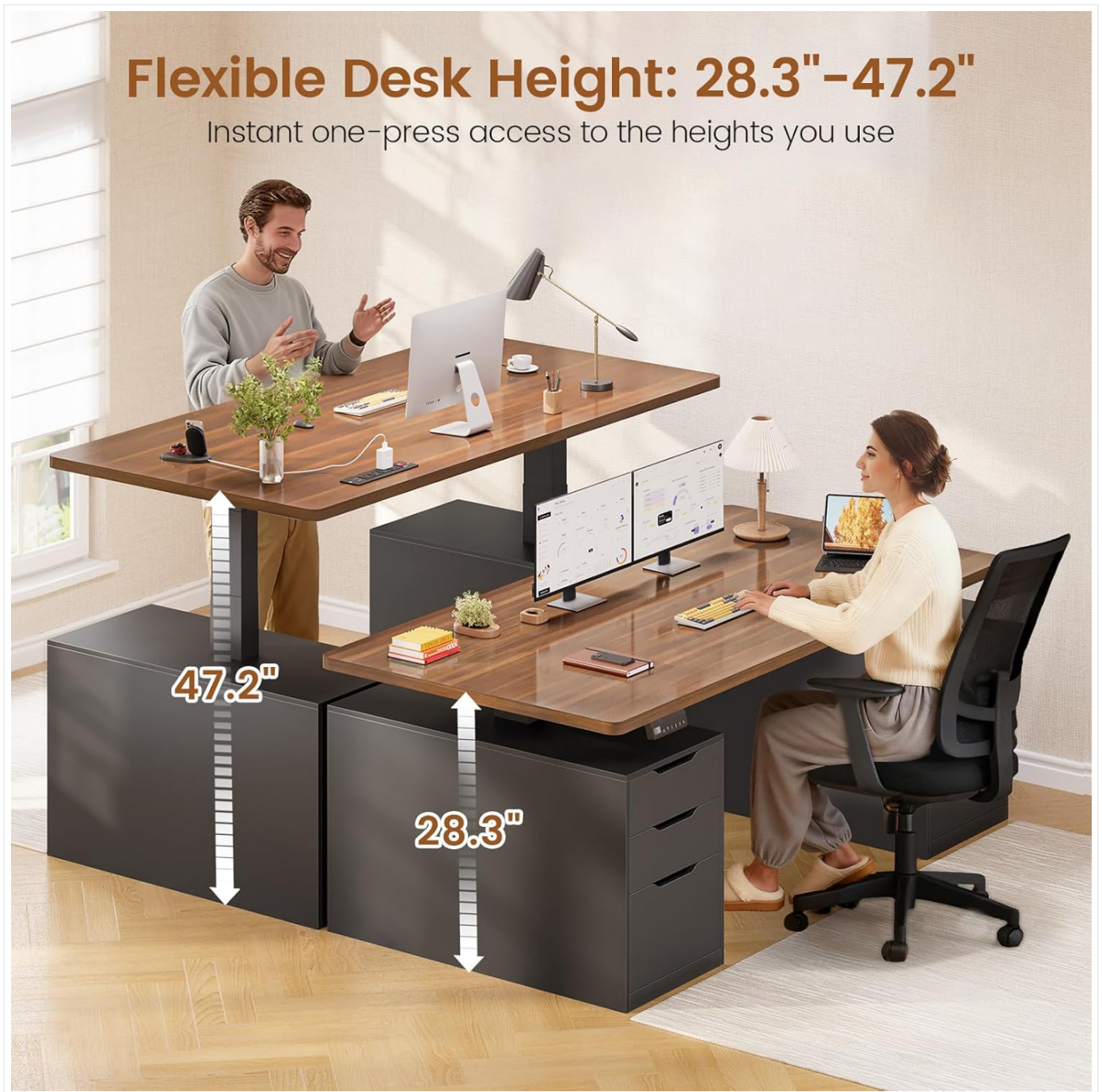
Image: Illustration showing the desk adjusting between its minimum height of 28.3 inches (sitting position) and maximum height of 47.2 inches (standing position), highlighting the flexibility for different postures.

Instant one-press access to the heights you use