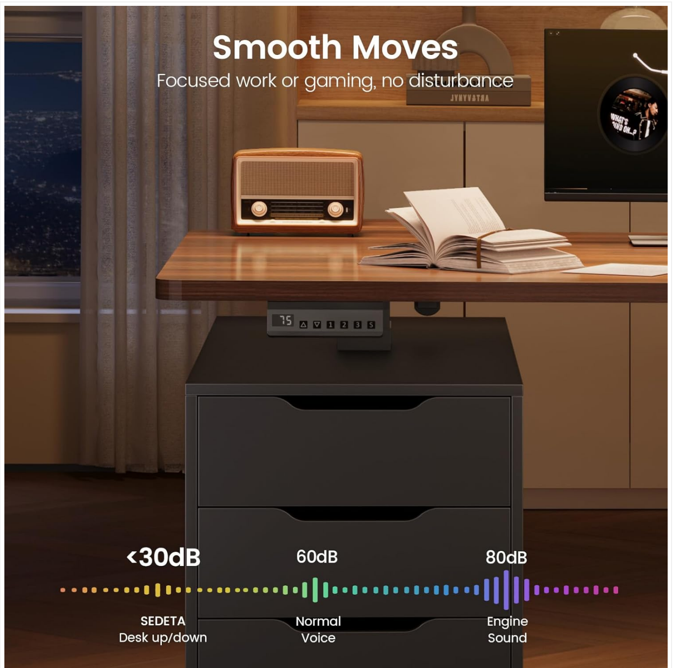
Image: Graphic illustrating the low noise level (below 30dB) of the SEDETA desk during operation compared to normal voice (60dB) and engine sound (80dB), emphasizing smooth and quiet movement.