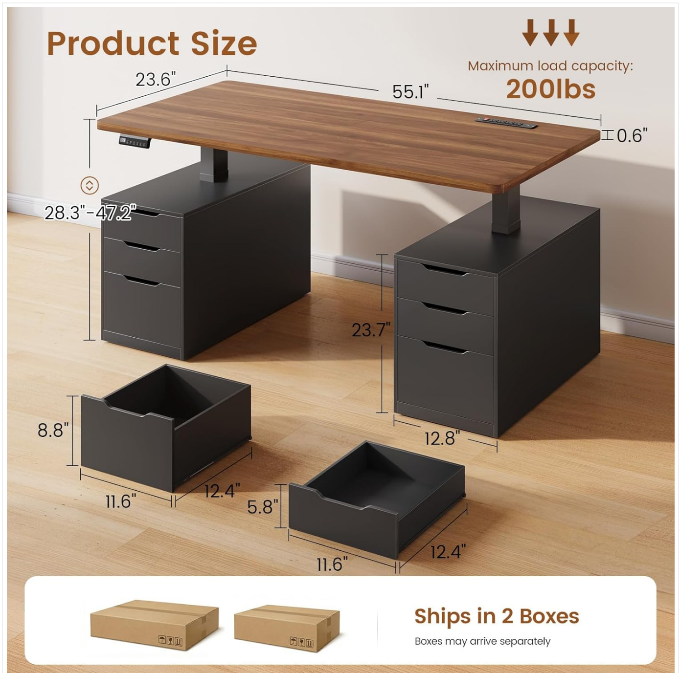
Image: Overview of the desk dimensions (55.1" W x 23.6" D x 28.3"-47.2" H) and maximum load capacity (200 lbs), indicating that the product ships in 2 boxes.