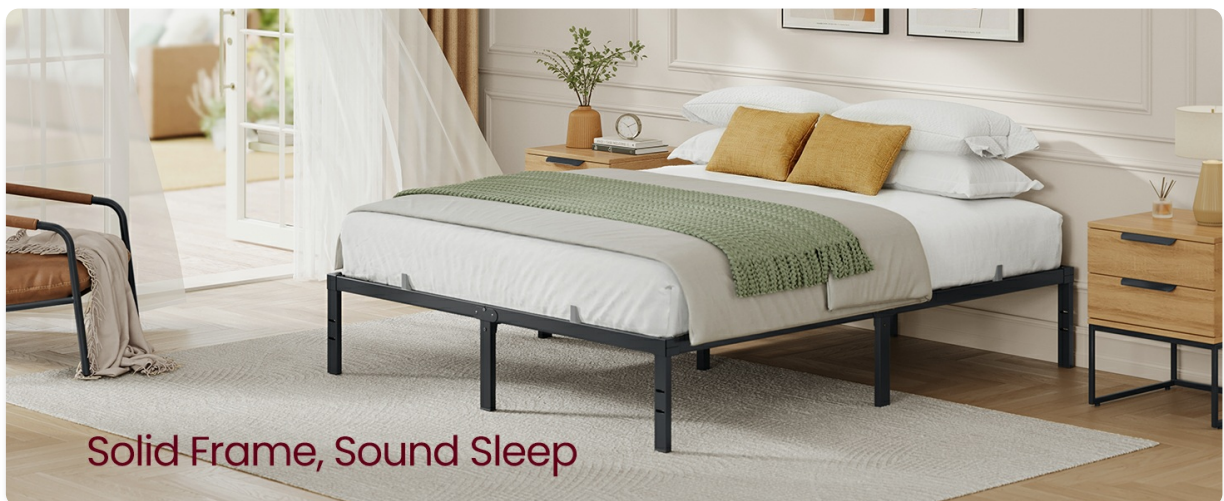
Image: VASAGLE Queen Metal Bed Frame in a modern bedroom setting.

The VASAGLE Queen Metal Bed Frame (Model URMB651BD02S) is a heavy-duty platform bed designed for stability and ease of assembly. It features a 14-inch height, providing ample under-bed storage space, and includes mattress retainers to prevent mattress sliding. This bed frame supports up to 1100 lbs and does not require a box spring.