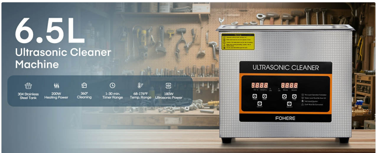
Figure 2: Power and Transducer System Overview.