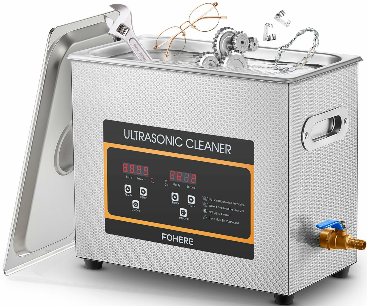
Figure 1: FOHERE 6.5L Ultrasonic Cleaner, Model JX-031S.