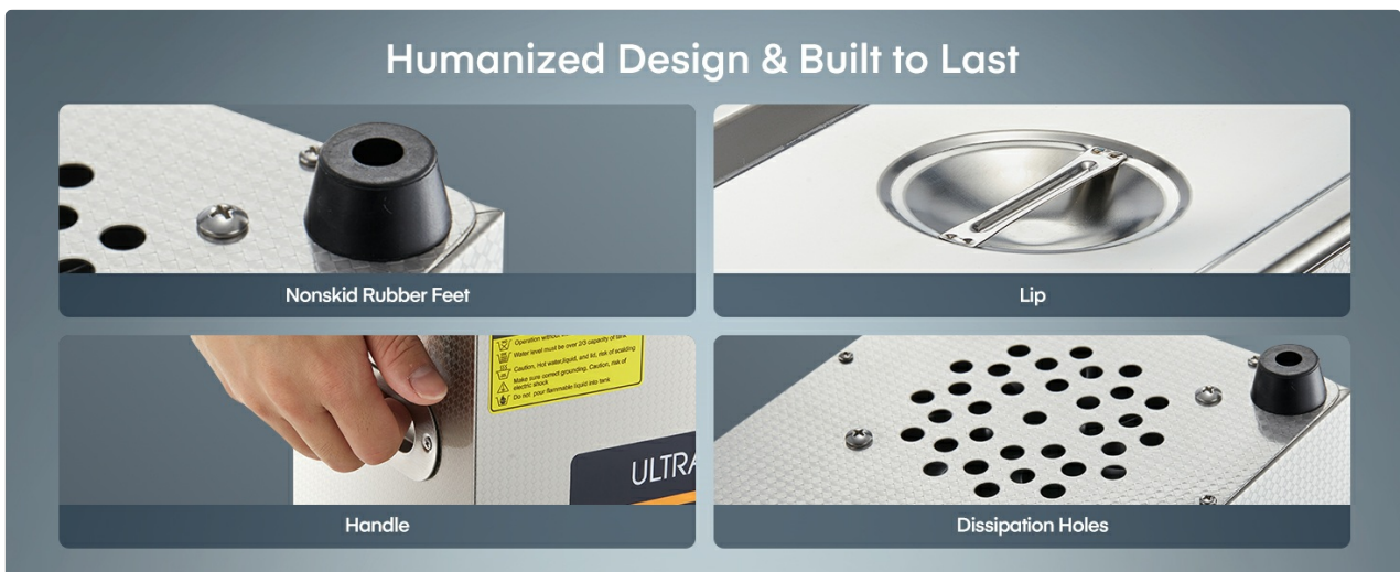
Figure 5: Design features for durability and ease of use, including non-skid feet and drain.