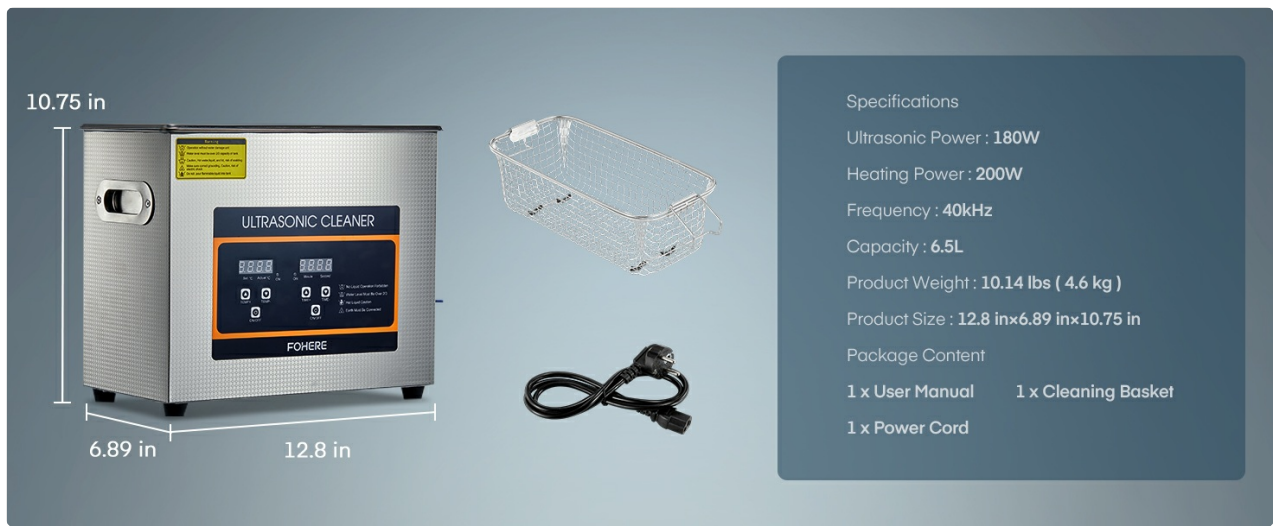
Figure 6: Product dimensions and package contents.