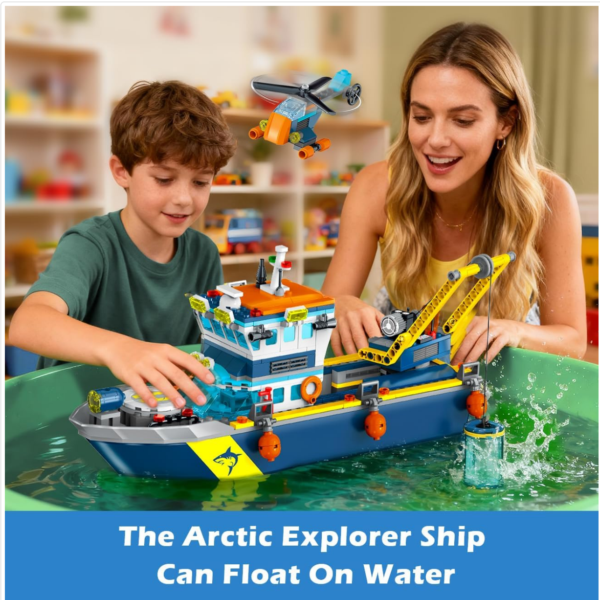
Figure 3: The Arctic Explorer Ship demonstrating its floatable design in water.