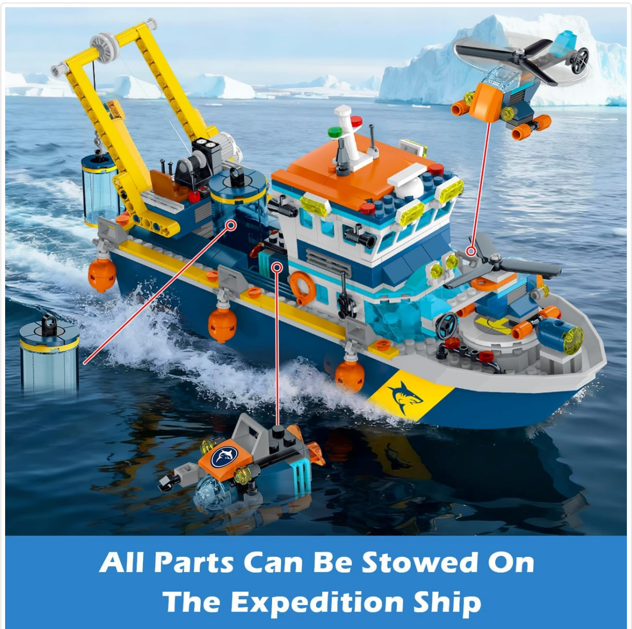
Figure 5: All expedition tools, including the helicopter and submarine, can be stowed on the ship.