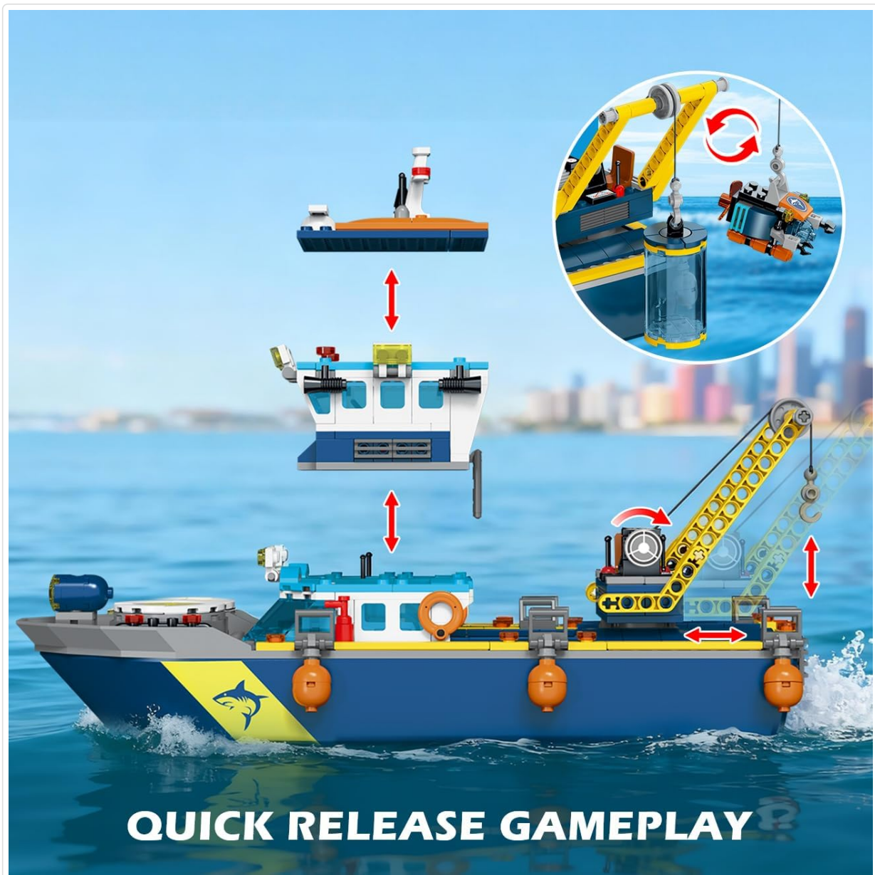
Figure 4: Illustrates the crane mechanism and modular design for quick play changes.