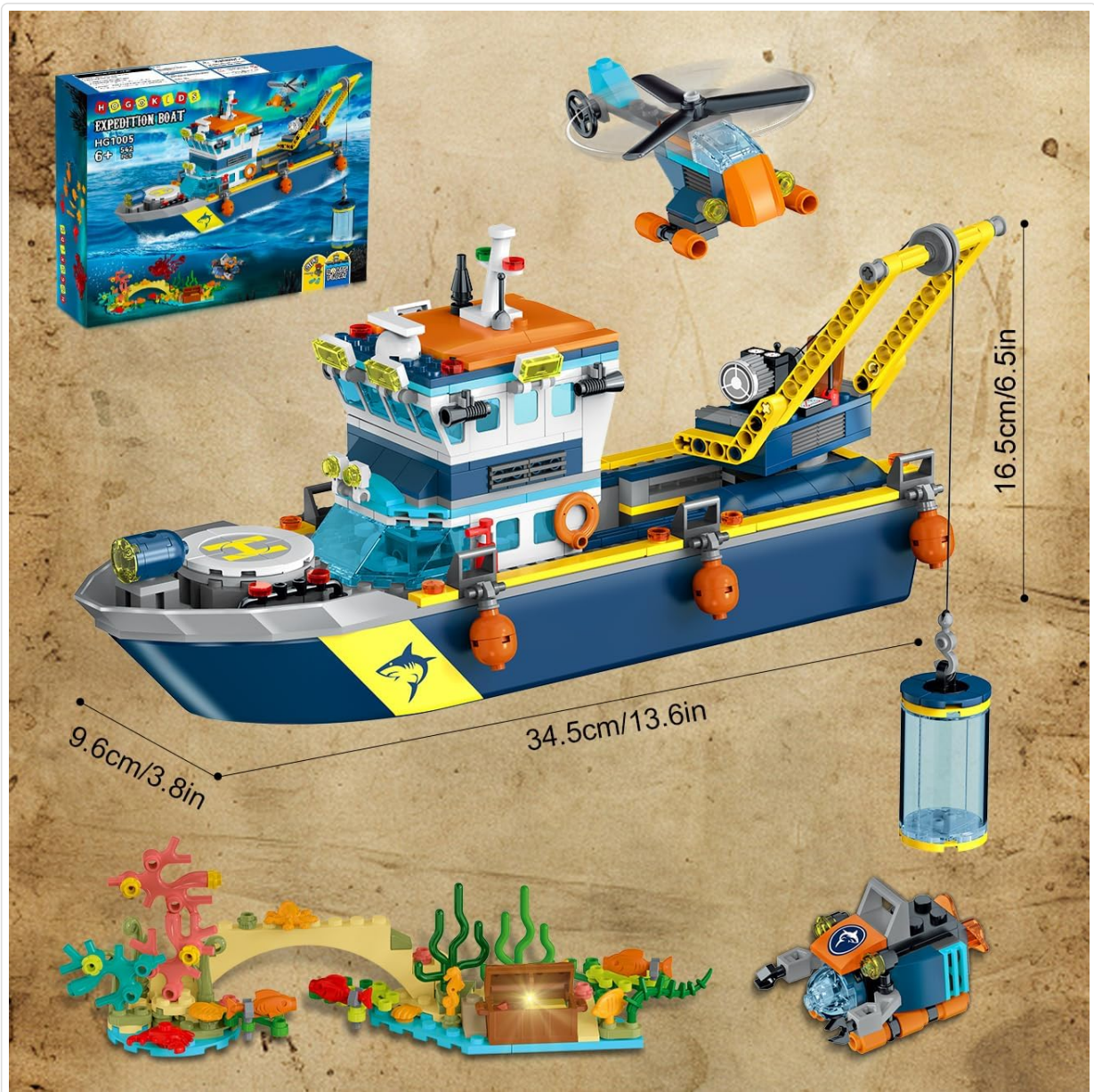
Figure 7: Key dimensions of the assembled Arctic Explorer Ship.