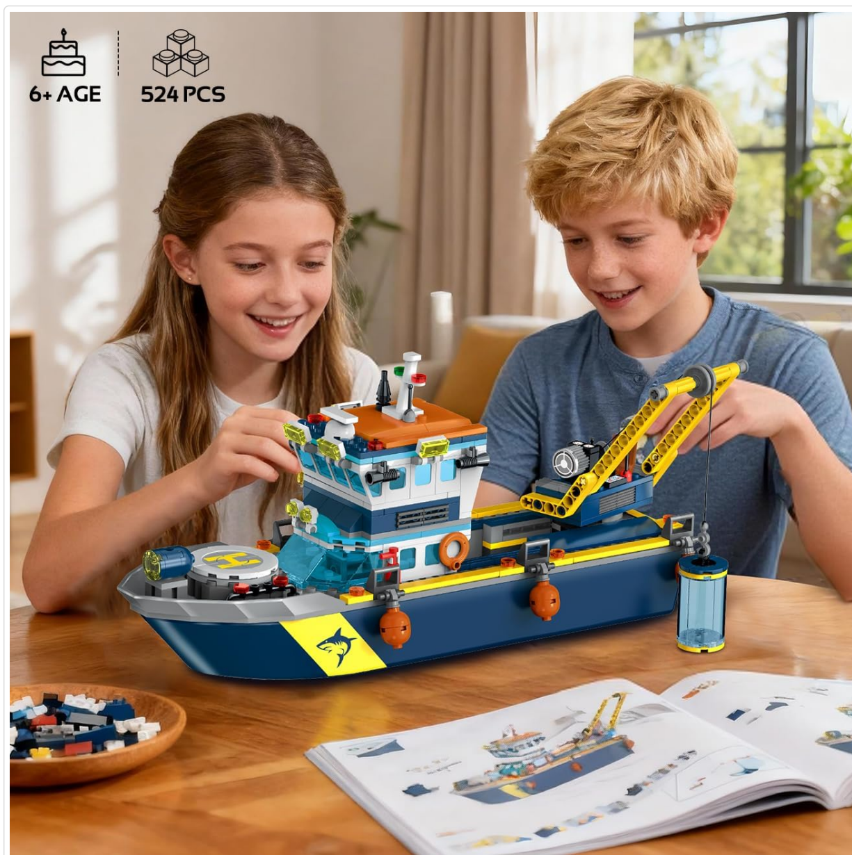
Figure 2: Children engaging in the assembly process, guided by the instruction manual.

specific instructions for integrating these into the ship's structure. The battery pack for the LED lights uses small watch batteries, which can be replaced by opening the screw compartment.