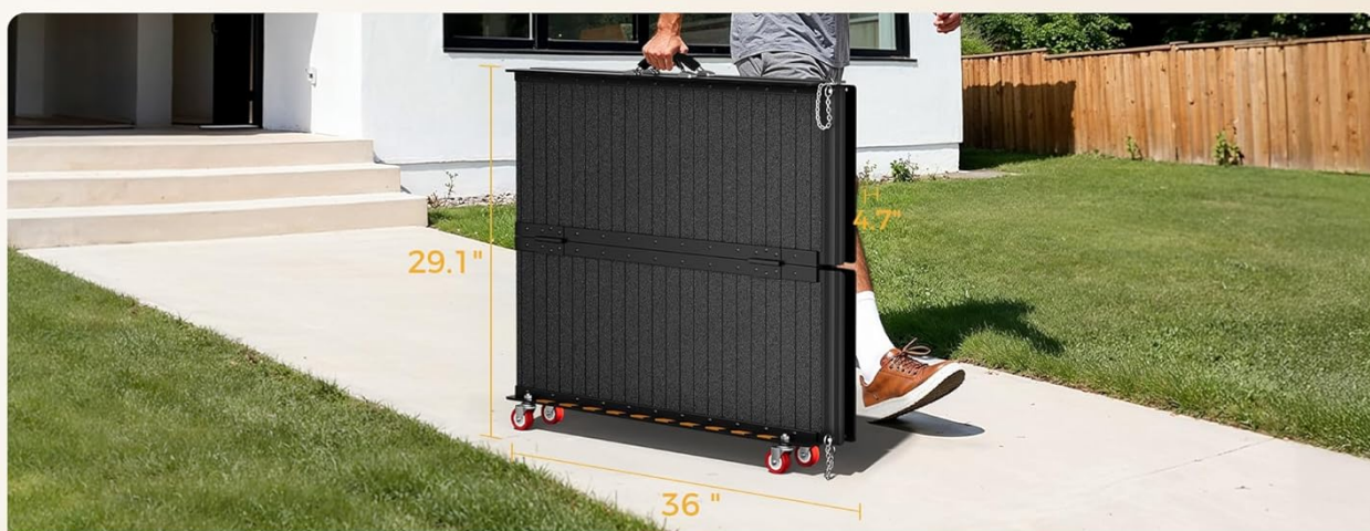
2-Fold roll with ease