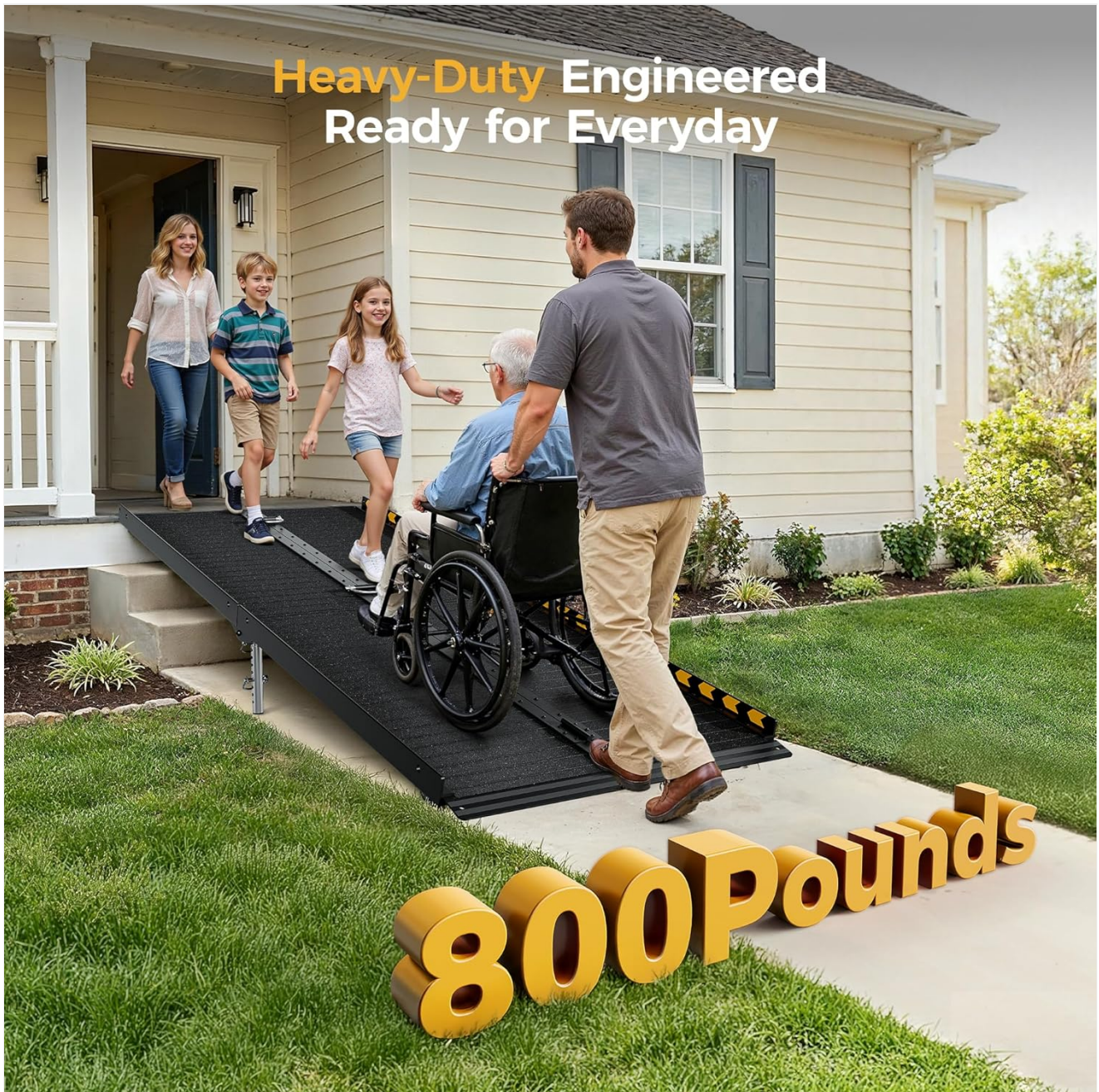
Image: A person assisting another in a wheelchair up the CAMMOO ramp, demonstrating its use for home access.