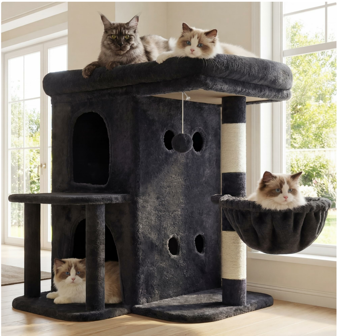
Image 1.1: The Heybly HCT204SG Cat Tree in Smoky Gray, showcasing its multi-level design and various features with cats utilizing the different areas.