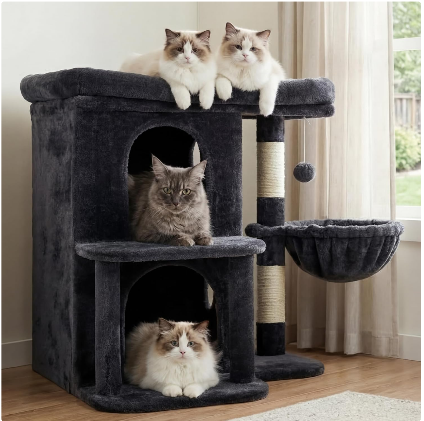
Image 3.1: Multiple cats engaging with different parts of the cat tree, including the top perch, condos, and scratching posts.